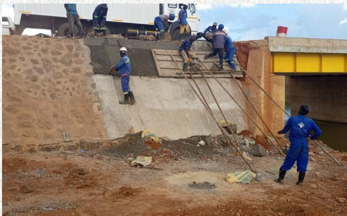
Protection works on the embankments in progress.

T he protection works on the embankments for the approach roads Lundazi Bridge are progressing well.