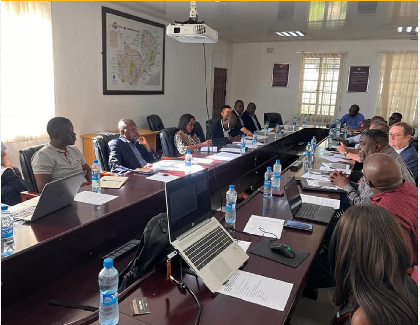
RDA officials during a meeting with representatives from some Copperbelt Mining Firms at RDA head office recently.

A s part of the programme to improve the road network, the Government through the Road Development Agency (RDA) has contracted Turbo Kachin Consortium (Turbo-KC) as the Concessionaire to rehabilitate the Chingola-Kasumbalesa Road under the Public-Private Partnership (PPP) Model.