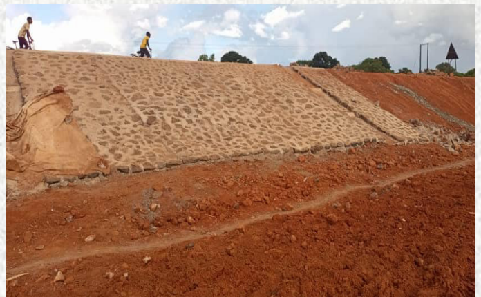
More images from Lundazi Bridge under construction.

The surfacing of the approach roads and the bridge deck are expected to be completed in May 2023.