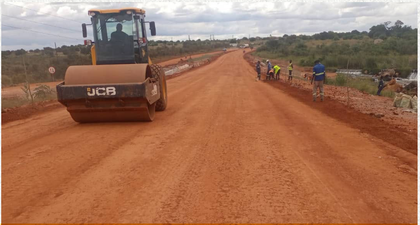
Completed base course stabilization.

Currently, overall physical progress at Msuzi Bridge is at 97%.