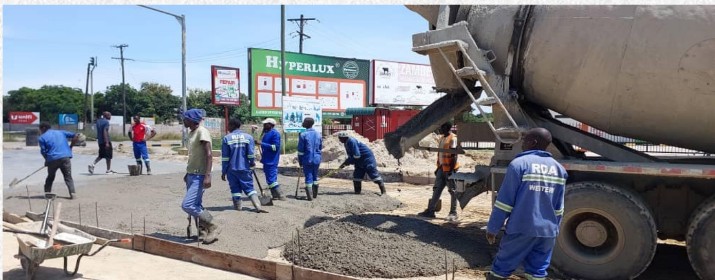
The construction of a 60 meters rigid pavement at Mongu traffic lights.

Project Risk Management is a critical process that helps ensure a project's success. By identifying potential risks, assessing their impact, and developing mitigation plans, the project team can reduce the likelihood of project failure.