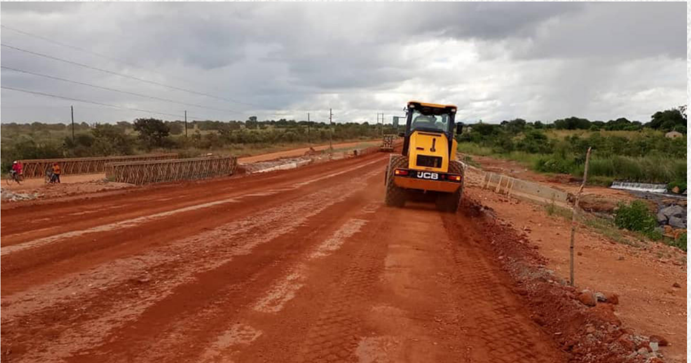
Base course stabilization works at Msuzi Box Culvert.

T he stabilization of the base course on the approach roads at Msuzi Box Culvert on the Chipata to Lundazi Road has been completed.