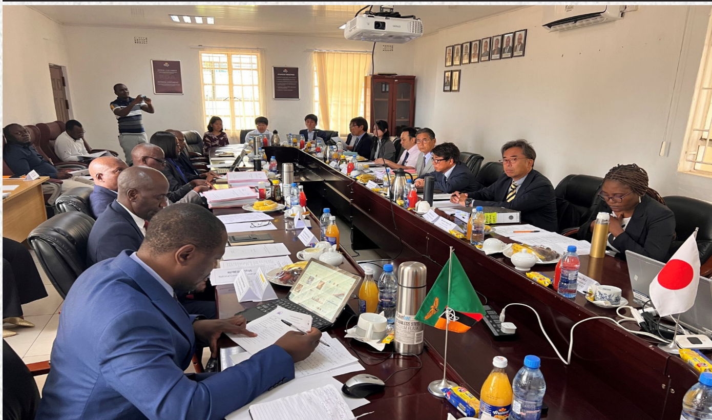
Participants to the 4th Joint Coordinating Committee (JCC) meeting of the JICA Technical Cooperation Project (TCP) at the RDA head office conference room.

The Zambian Government has assured Japan that the knowledge obtained from the Japan International Cooperation Agency (JICA) Bridge Maintenance Capacity Building Project shall be put to good and sustainable use.