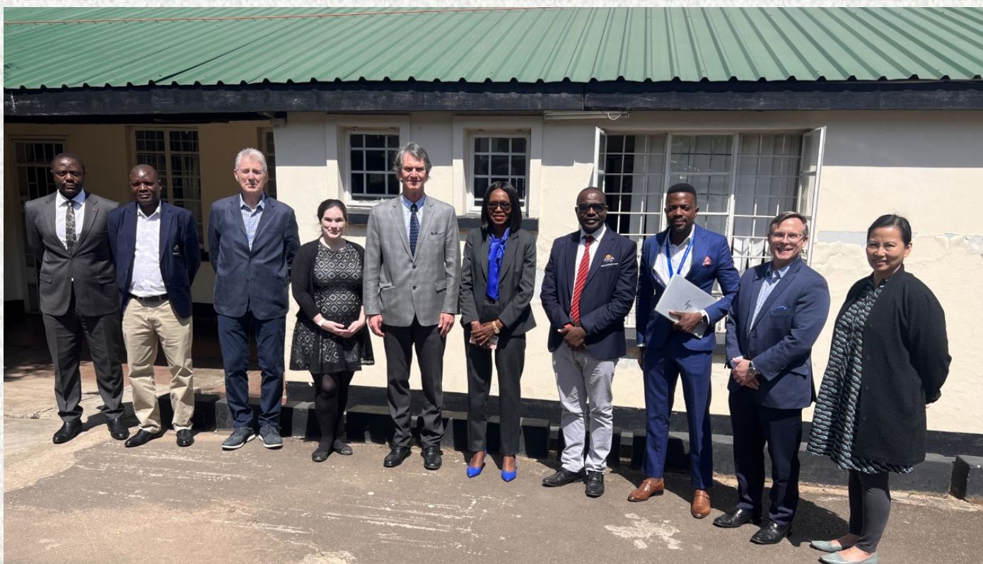
Group photograph of RDA and MCC officials after the meeting at RDA head office in Lusaka.

A team of technical officers from the Millennium Challenge Corporation (MCC) based in the United States of America (USA) recently engaged the Road Development Agency (RDA) in relation to the second Compact programme that will focus on directing investment towards supporting the growth of agriculture and agro-processing in Zambia.