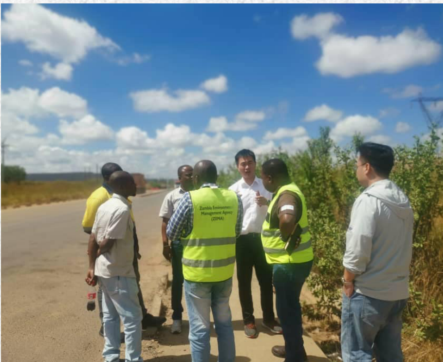
The team from RDA, ZEMA and Concessionaire conducting a joint inspection at Chingola-Kasumbalesa Road project site.

A team from the Road Development Agency (RDA), Zambia Environmental Management Agency (ZEMA) and the Concessionaire, Turbo Kachin Investment Consortium undertook a joint inspection at the Chingola-Kasumbalesa Road project site.