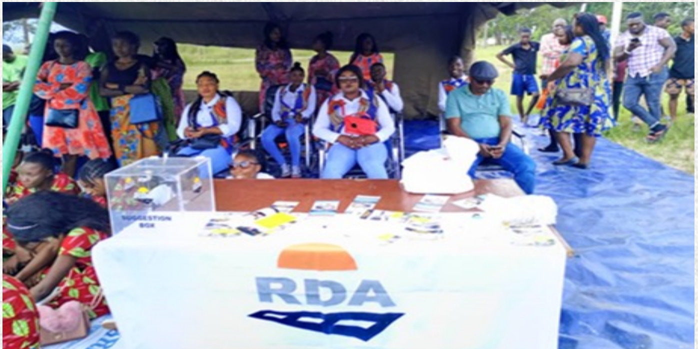
The RDA stand in Mansa during the 2023 International Women's Day.