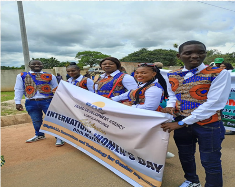
RDA employees in Mansa getting ready for the march-past.

Z ambia joined the rest of the world in celebrating the International Women's Day under the theme "DigitALL: Innovation and Technology for Gender Equality".