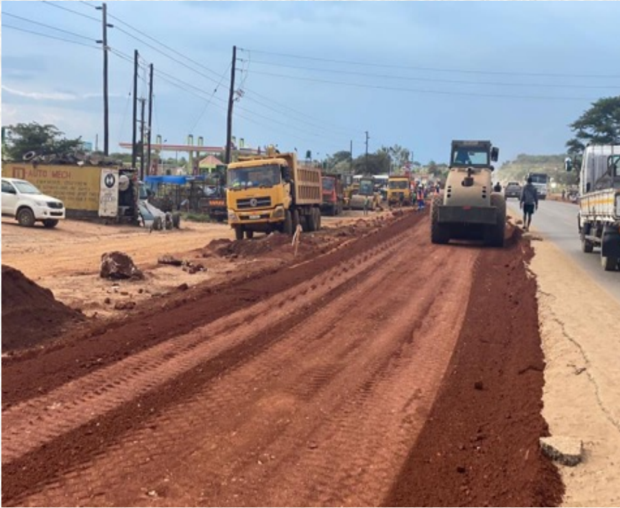
Road expansion works at 10 miles.

I n a bid to decongest traffic on the Great North Road (T2) at 10 miles area in Chibombo District, the Road Development Agency (RDA) has embarked on works to re-engineer the Mungule Road intersection with the Great North Road to augment its traffic capacity on a short to medium term basis.