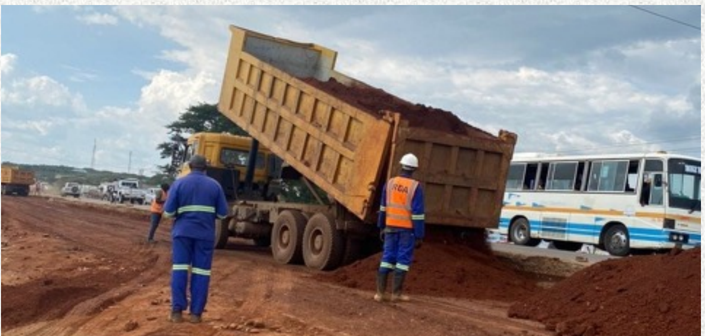
A tipper truck dumping gravel for use at 10 miles.

The works are being executed in-house by the RDA Lusaka Regional Office in collaboration with the Zambia National Service (ZNS).