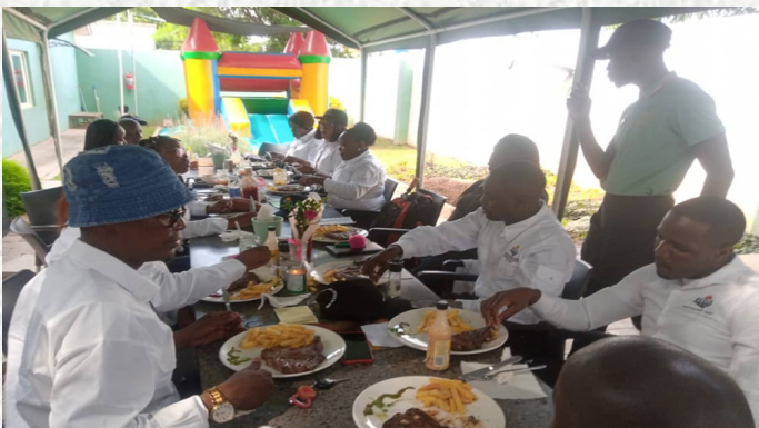
Lusaka participants having lunch after celebrating Women's Day.