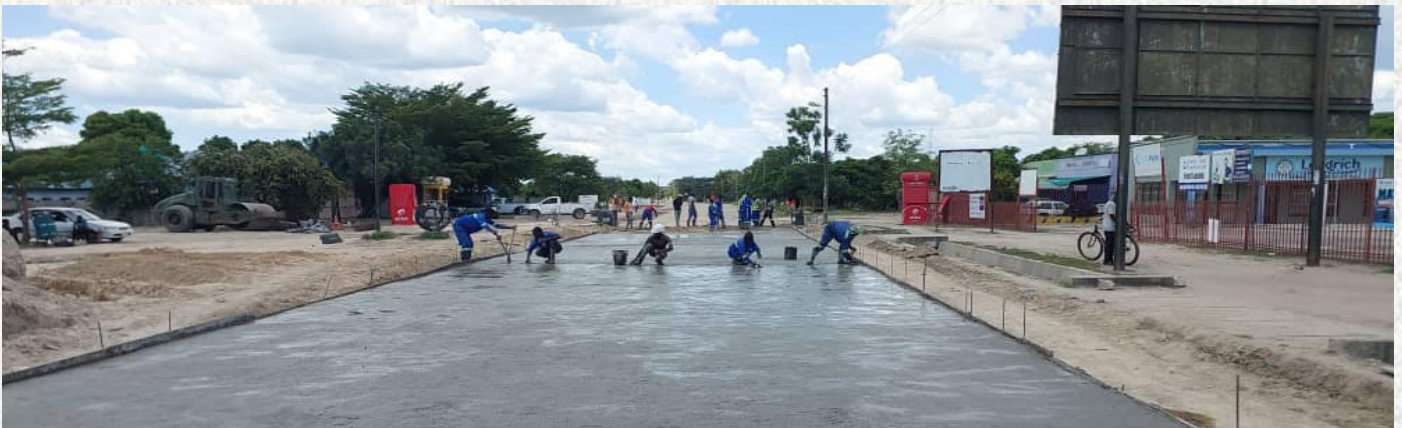
Works in progress.