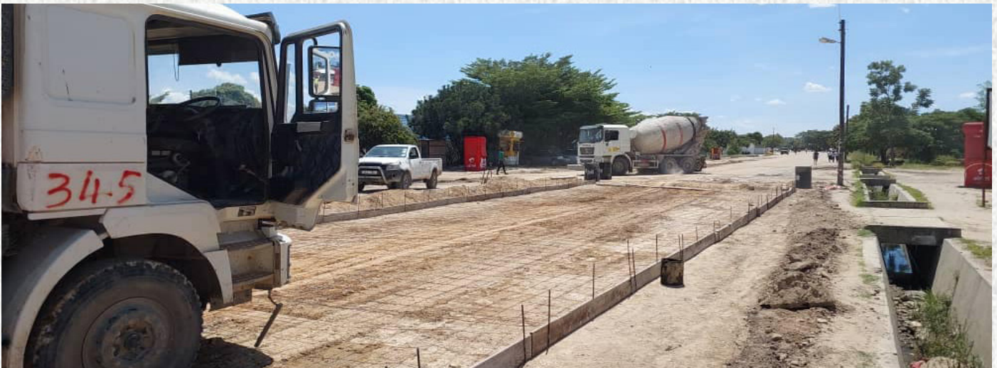
Completed section of the concrete pavement.