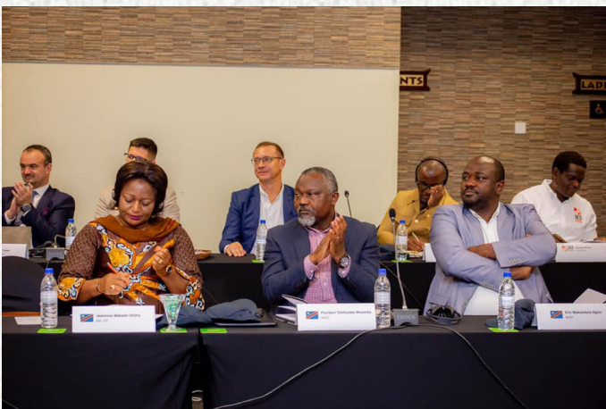
Delegates listening to the deliberations during the Joint Steering Committee meeting.