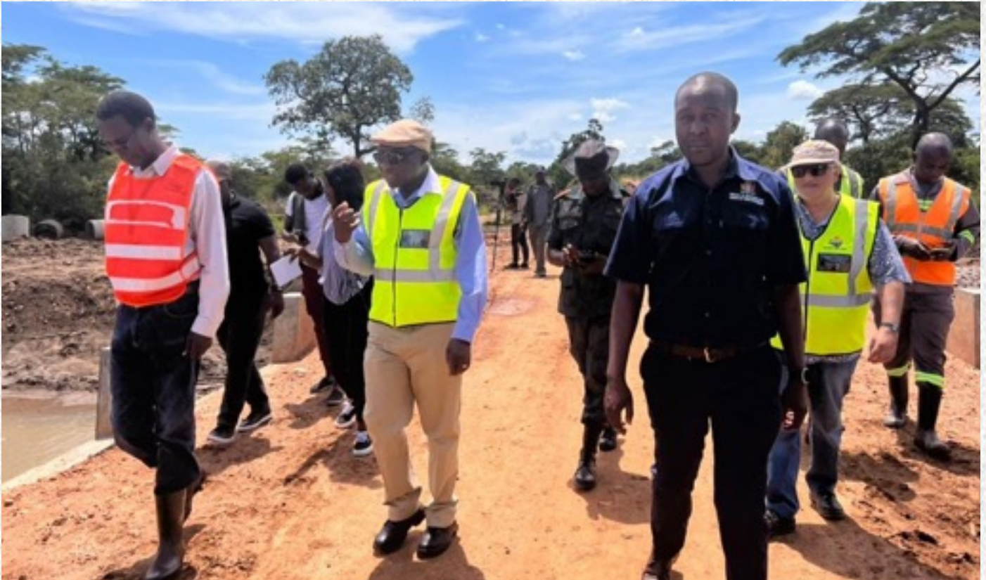
Minister of Infrastructure, Housing and Urban Development, Hon. Eng. Charles L. Milupi with Road Development Agency (RDA) and Ministry officials during the inspection of the Monze-Niko road.

M inister of Infrastructure and Urban Development Hon. Eng. Charles L. Milupi says the Government, through the Road Development Agency (RDA) intends to upgrade to international bituminous standard the entire Monze-Niko road in Southern Province.