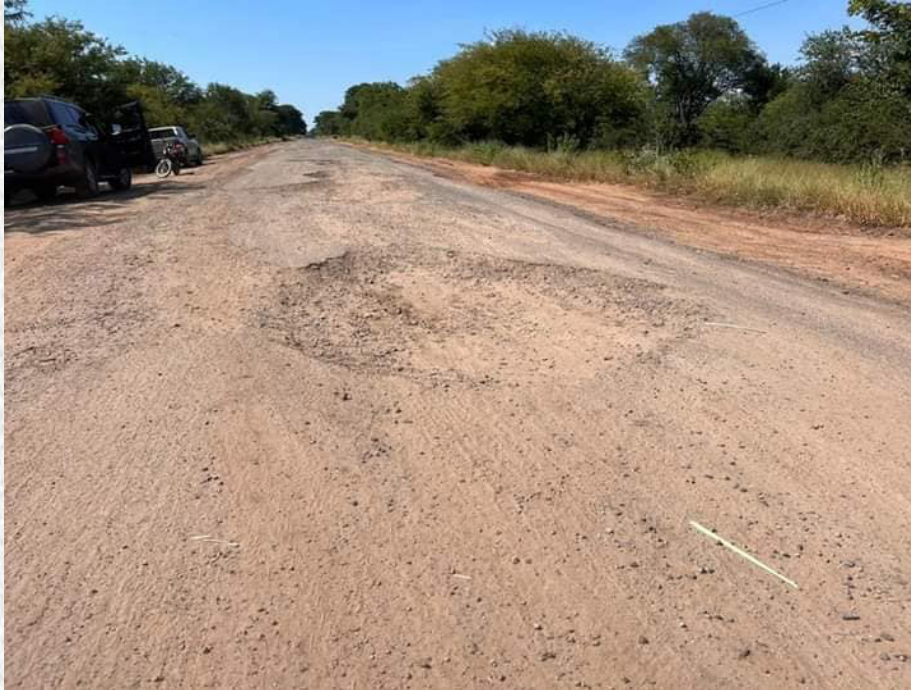
A damaged section of the Livingstone-Kazungula-Sesheke road.

.... Says the road requires reconstruction