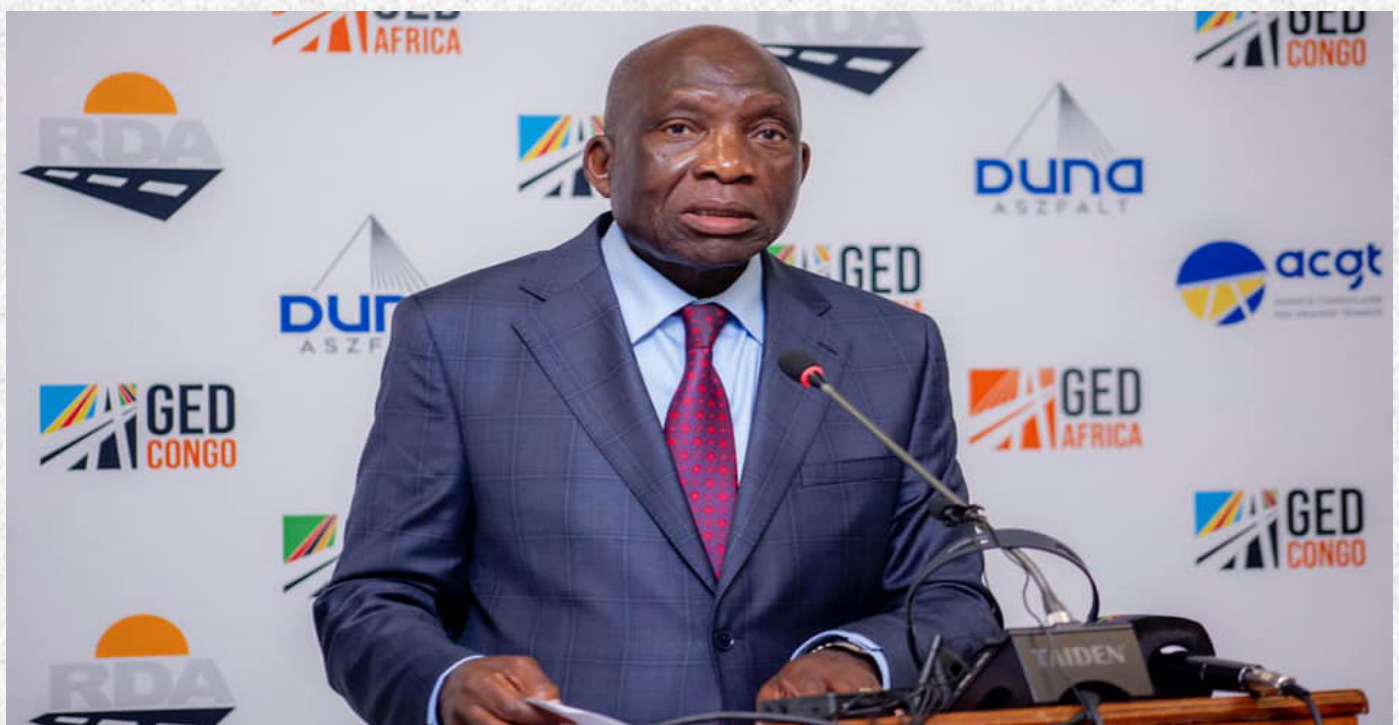
Minister of Infrastructure, Housing and Urban Development, Hon. Eng. Charles L. Milupi speaking during the official opening of the Inter-Governmental Steering Committee meeting on the Kasomeno-Mwenda toll road and bridge project in Livingstone.

I nfrastucture, Housing and Urban Development Minister, Hon. Eng. Charles L. Milupi has directed the Inter-Governmental Steering Committee spearheading the commencement of works on the Kasomeno-Mwenda toll road and bridge project as well as the One-Stop Border Post (OSBP) to accelerate implementation of the project.