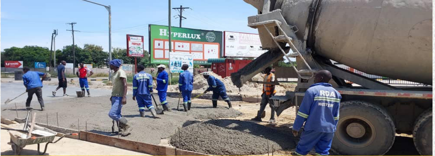
Cement stabilization in progress.

This is the section which had heavily deteriorated and was characterized by massive potholes.