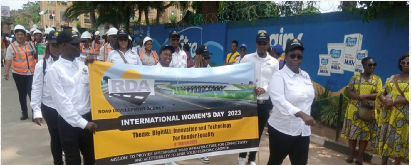
RDA members of staff during the march-past in Lusaka.