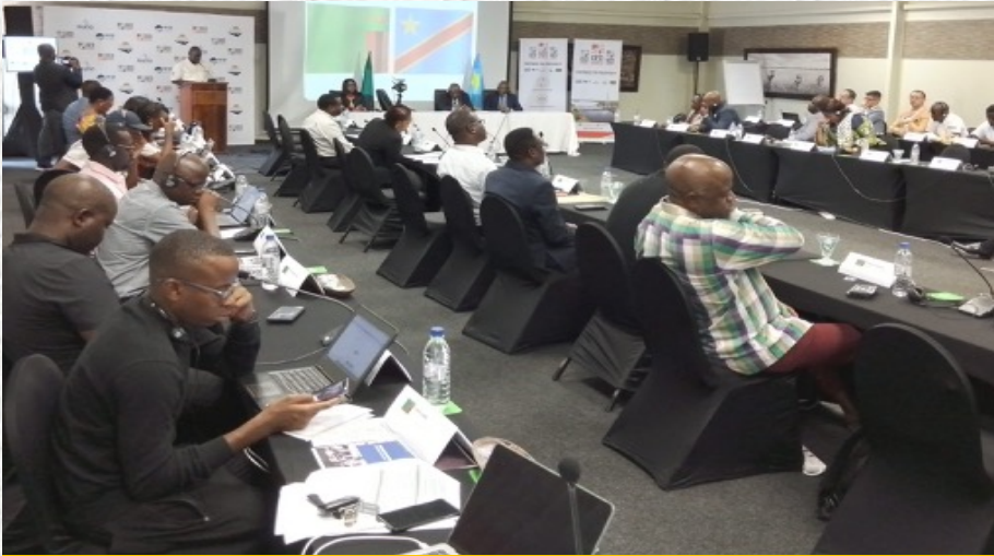
Participants to the inter-Governmental meeting on the Kasomeno-Mwenda toll road and One Stop Border Post (OSBP) project following the proceedings.