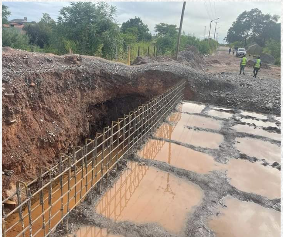
Works in progress.

The project is currently at 90% complete and the road has since been opened to traffic. The remaining works are erosion protection of the embankments and dredging of the river bed.