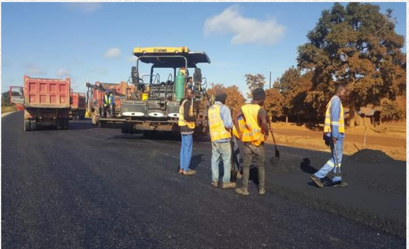
Chinsali-Nakonde Road works in progress.

Lot 2, the section from Isoka to Nakonde (107 kilometres), 83 kilometres has been rehabilitated and opened to traffic. Further, works in the Nakonde Central Business District have commenced.