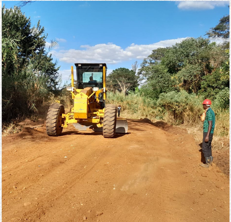
Works on the Chipata-Magwero Road.

Works have started and progress of 20% has been attained which includes completion of clearing and grubbing of the 11.6 kilometers in readiness to commence construction of drainage structures, grading and regravelling of sections that require the road to be raised.