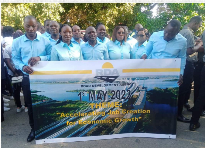
Group photo from the Lusaka team before the march past.