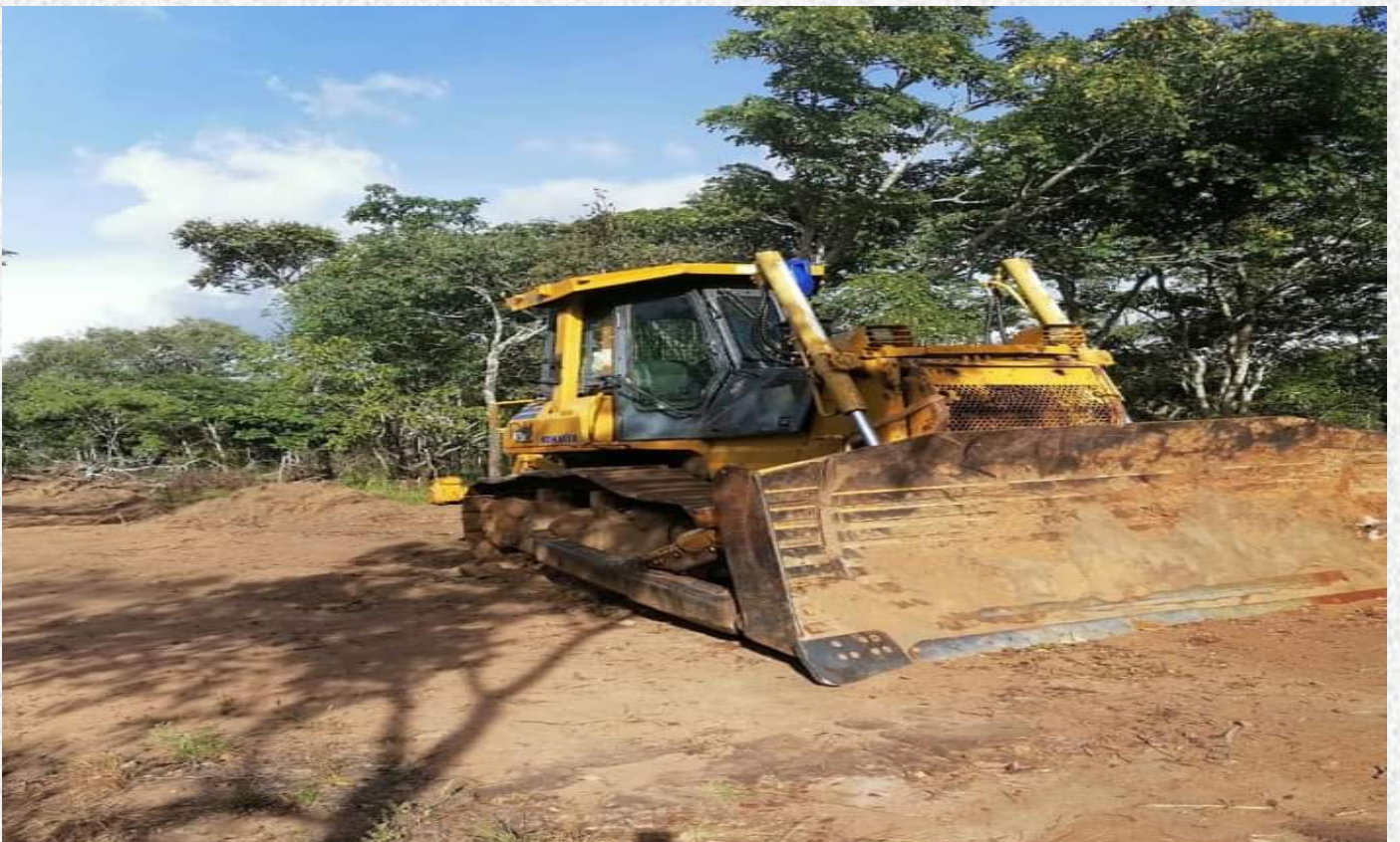
Works on the access road to the tourism site in Muchinga Province.

About 50 general workers are expected to benefit from this project. The expo is scheduled to take place in October 2023.