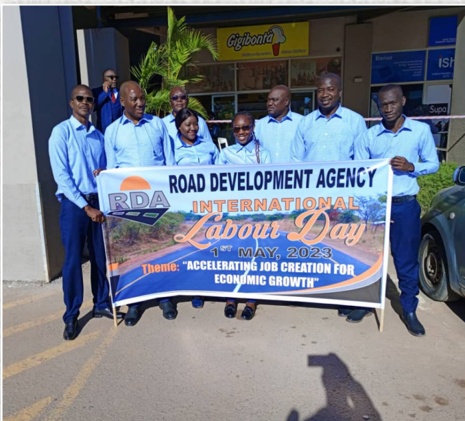
Group photo from the team at the Copperbelt Regional Office.