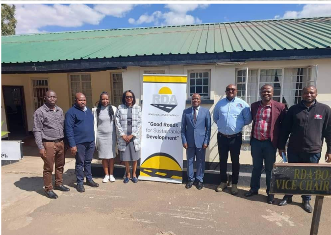
The RDA held a consultative meeting with the Zambia Metrology Agency (ZMA). The meeting discussed various matters to enhance Axle Load Control and asizing of weighbridge devices in Zambia.