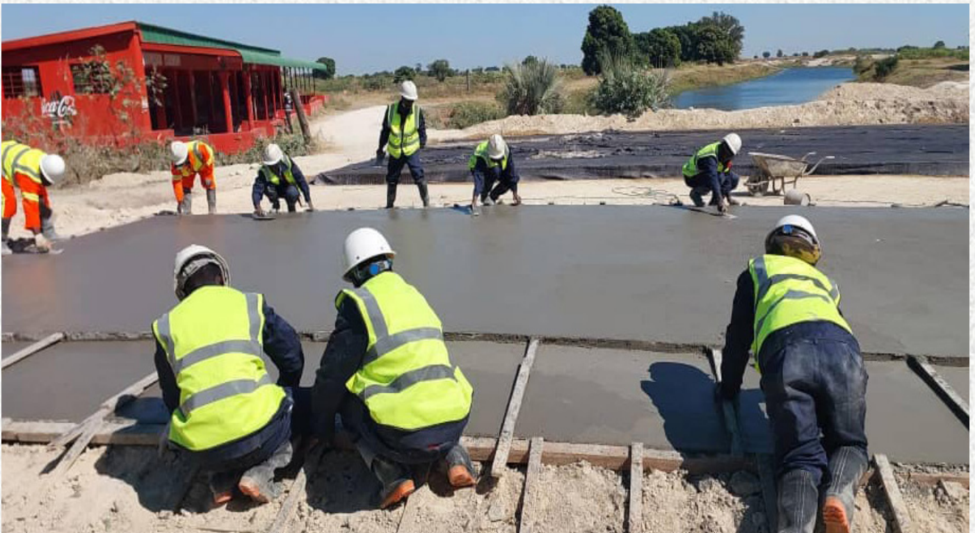
Concrete works at Nayuma harbour on the Mongu-Limulunga Road.

AVIC International, the contractor for the project has completed the 5% cement stabilization of the subbase on the entire 1.1km access road and are now preparing to commence the laying of the crushed stone base.