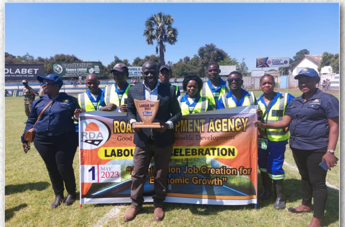
Group photo from the team at the Central Regional Office.