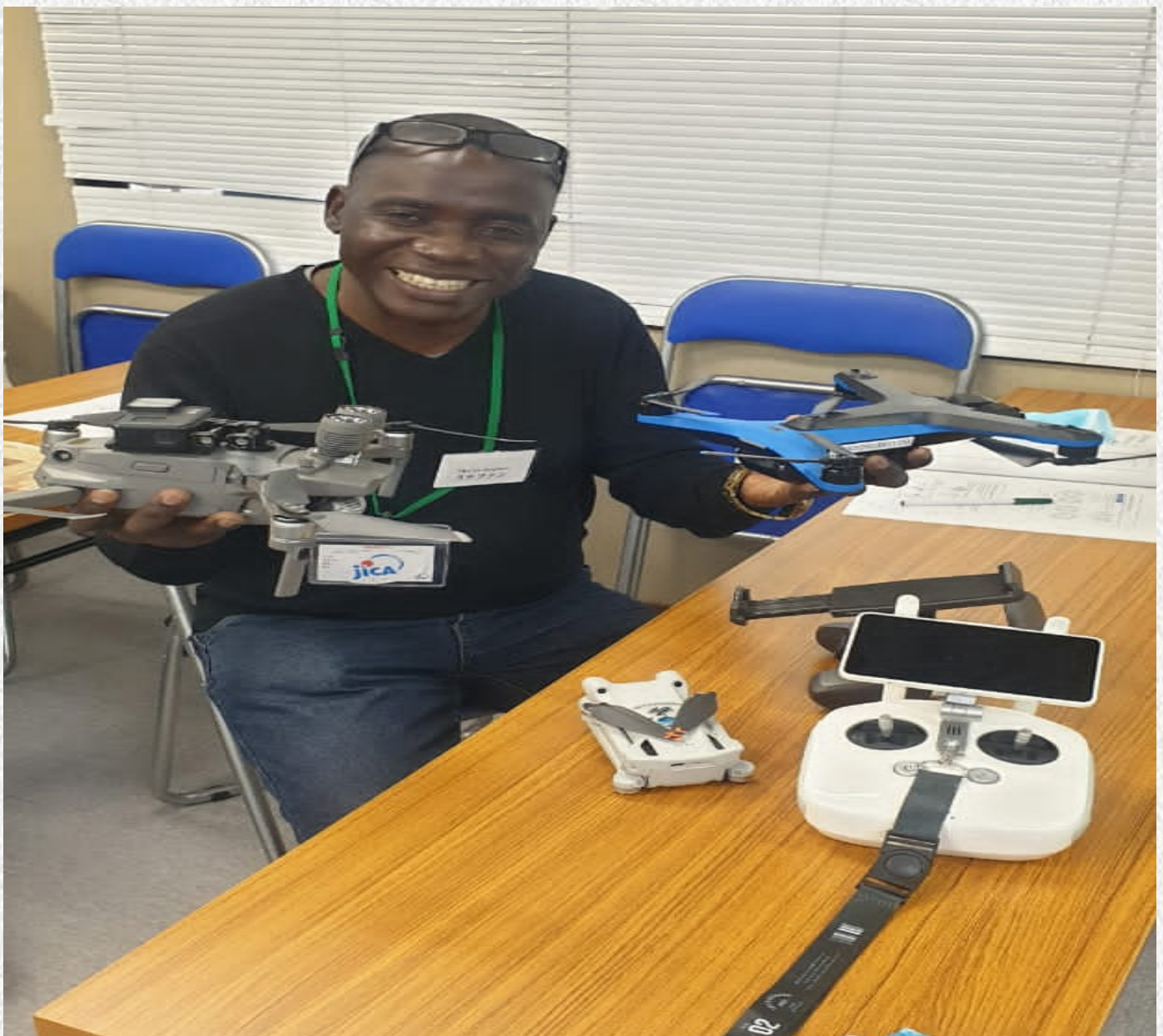
In class at the Drone Academy in Japan.