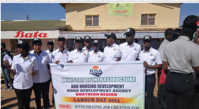
Group photo from the team at the Northern Regional Office.