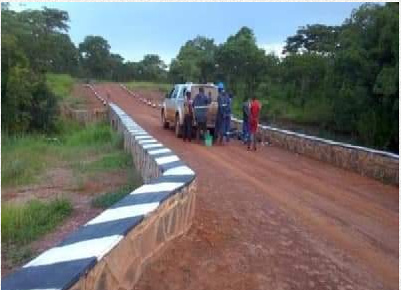
Completed works at Itabu Bridge.