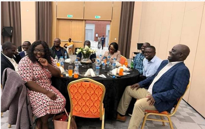
RDA members of Staff during the May Day celebrations at Mulungushi International Conference Centre.