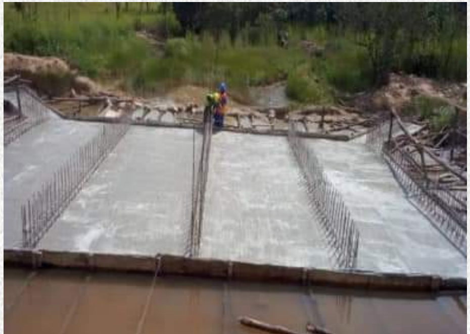
Ongoing works at Mbula Bridge.

Rehabilitation works on Itabu Bridge have been completed while works on Mbula Bridge are ongoing. Overall physical progress on the project is at 60 %.