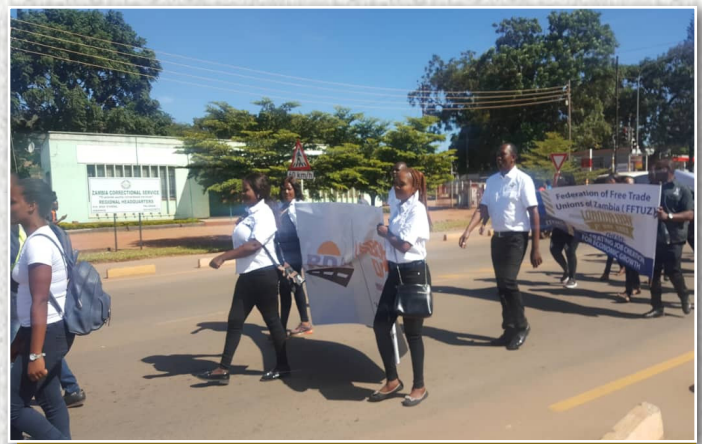
March-past by our team in Eastern Province.