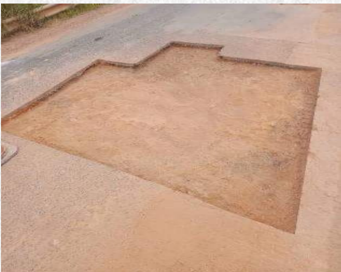
Cutting of potholes at km50+500

The maintenance works on the Chembe to Mansa to Nchelenge Road have intensified after the rainy season and physical progress is at 25 %.