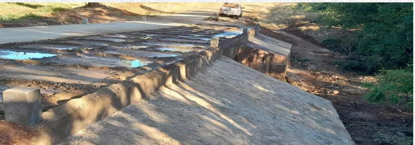
Mthiko Culvert after the works.