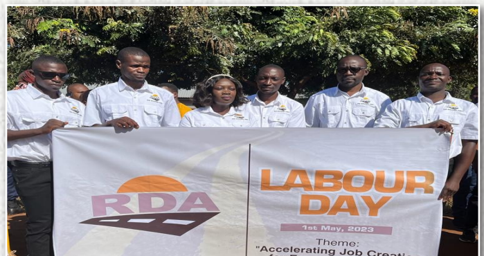
Nyimba Weighbridge officers.