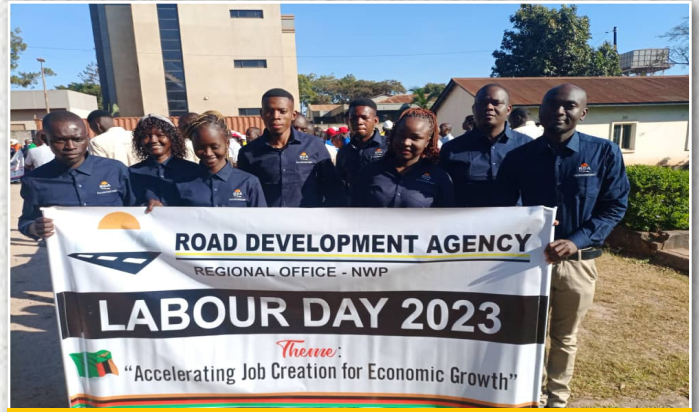
Group photo from the team at the North-Western Regional Office.