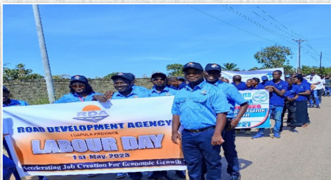
RDA Luapula Regional staff pose for pictures.