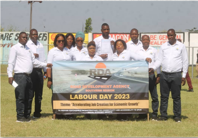
Group photo from the team at Southern Regional Office.