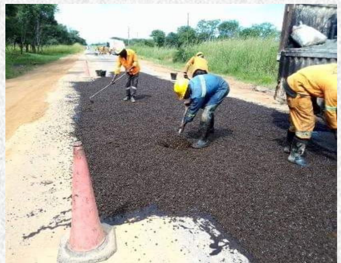
Sealing of pothole at km28+410