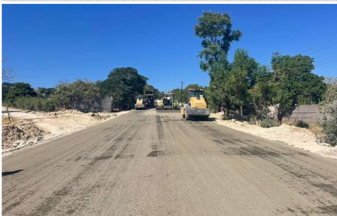
Works on the access road into the Limulunga Royal Palace in Western Province.