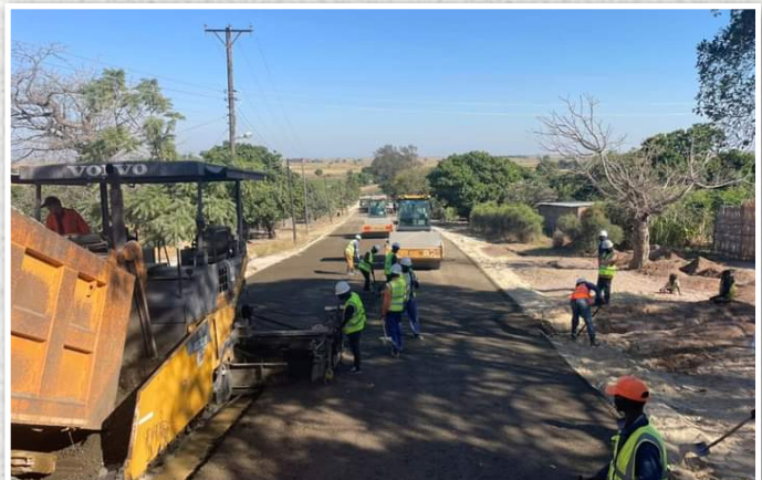
The laying of crushed stone base on the 1.1 km access road into the Limulunga Royal Palace in Western Province