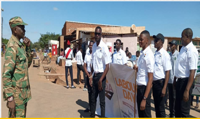
Katete Weighbridge officers.