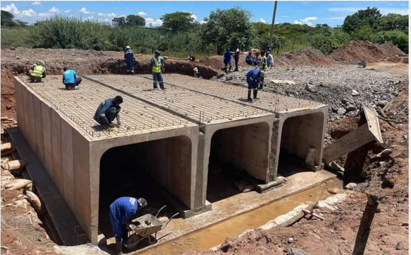
Ongoing works at Luanshya stream culverts.

The Luanshya stream culvert works on Roan Road have been substantially completed.