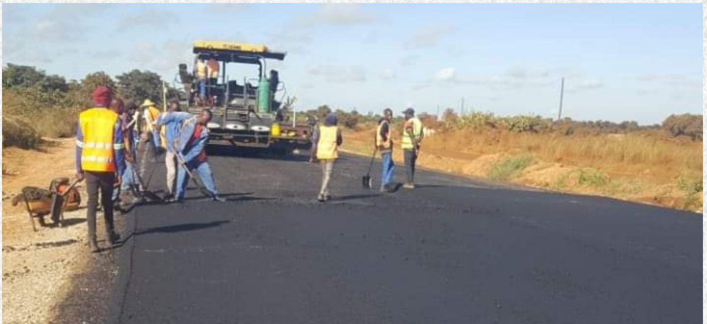
Works on the Chinsali-Nakonde Road.