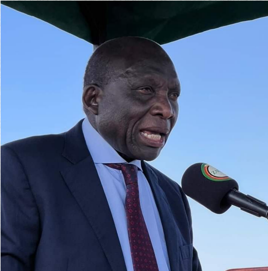
Minister of Infrastructure, Housing and Urban Development Hon. Eng. Charles L. Milupi delivering his speech during the commissioning of the Kafue Hook Bridge.

Hon. Eng. Milupi further said the Government was currently carrying out holding maintenance works on various roads using the Road Development Agency (RDA) Regional Offices in the respective Provinces to ensure that the road network does not deteriorate further as the treasury sources for funds to carry out major repair works.