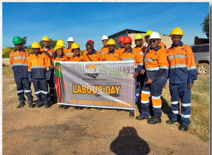
Group photo from the team at Muchinga Regional Office.