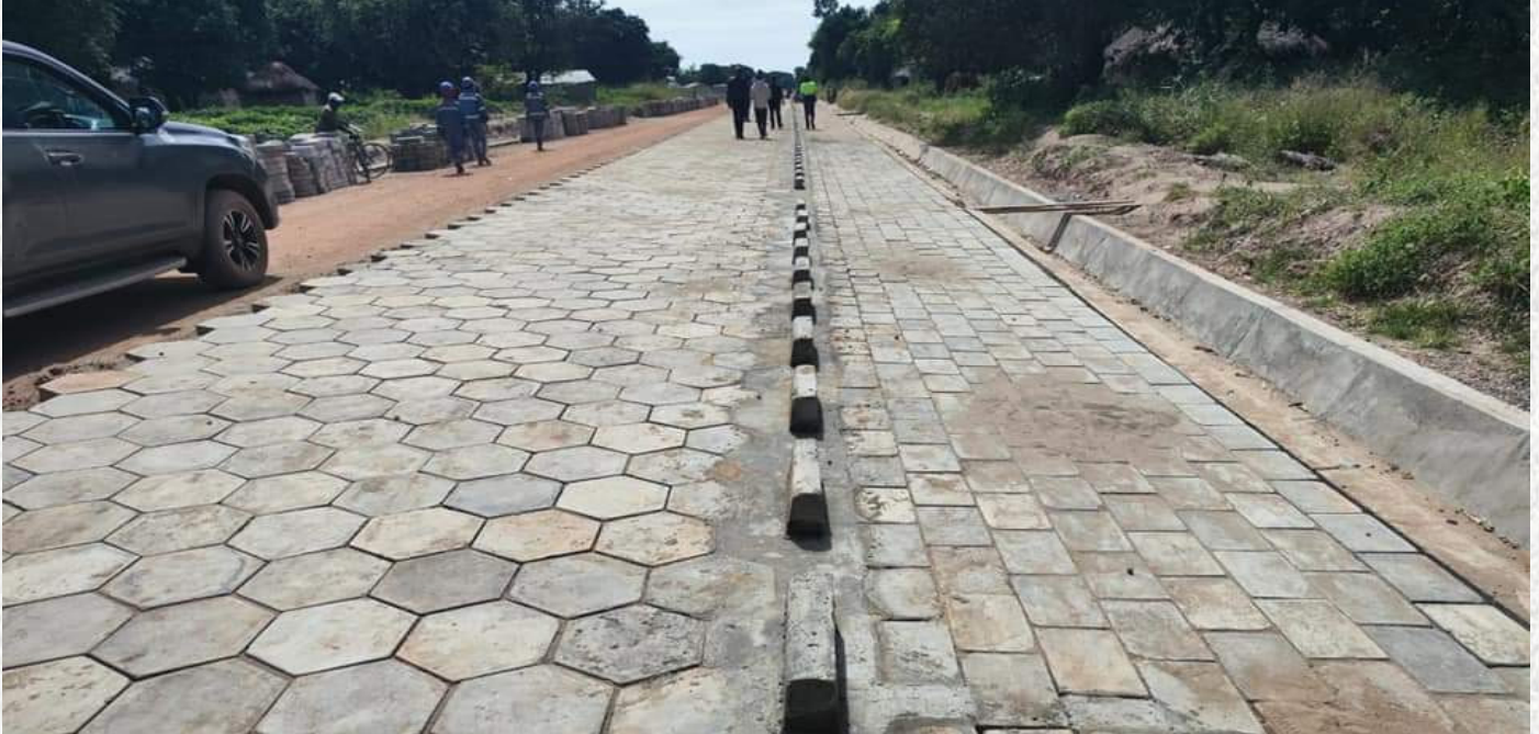
Output Performance Road Contracts (OPRC) under the IRCP Urban Section on a Primary Feeder Road Package 10 in Samfya District under construction.

Below are pictures for works on Package 10 in Samfya District and Package 9 in Kawambwa District in Luapula Province.