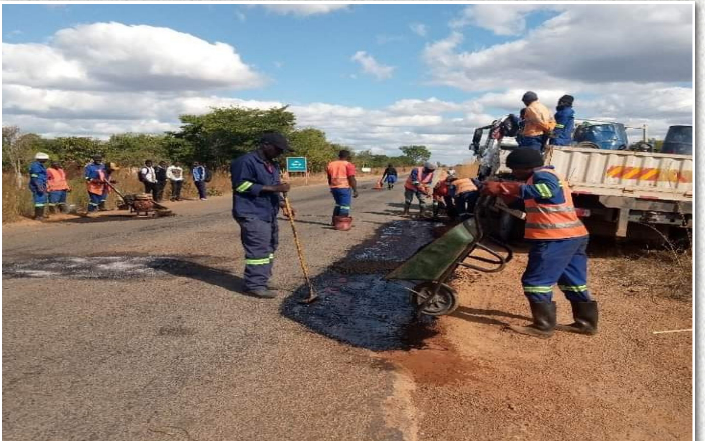
Pothole patching works on the Mpika-Kasama Road.