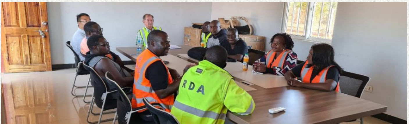
Site Meeting at the Chinsali Nakonde Road Project.

Effective risk identification provides a solid foundation for subsequent risk analysis, response planning, and overall risk management throughout the project life cycle. It enables organizations to proactively address risks, allocate resources appropriately, and increase the likelihood of project success.