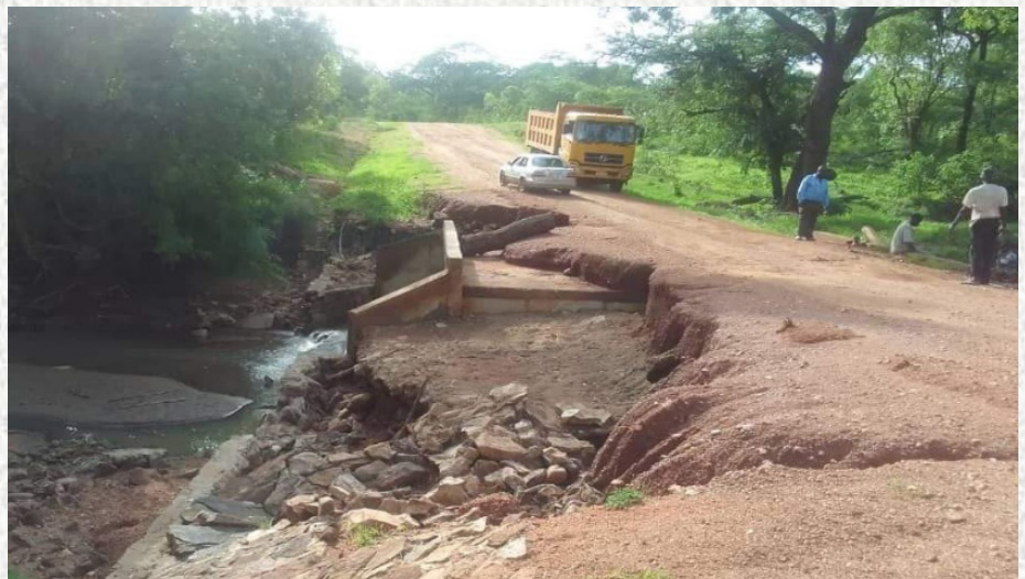
Mthiko Culvert before the works.

The road is very critical to Eastern Province as it services the main ZESCO Substation supplying electricity to the whole Province.