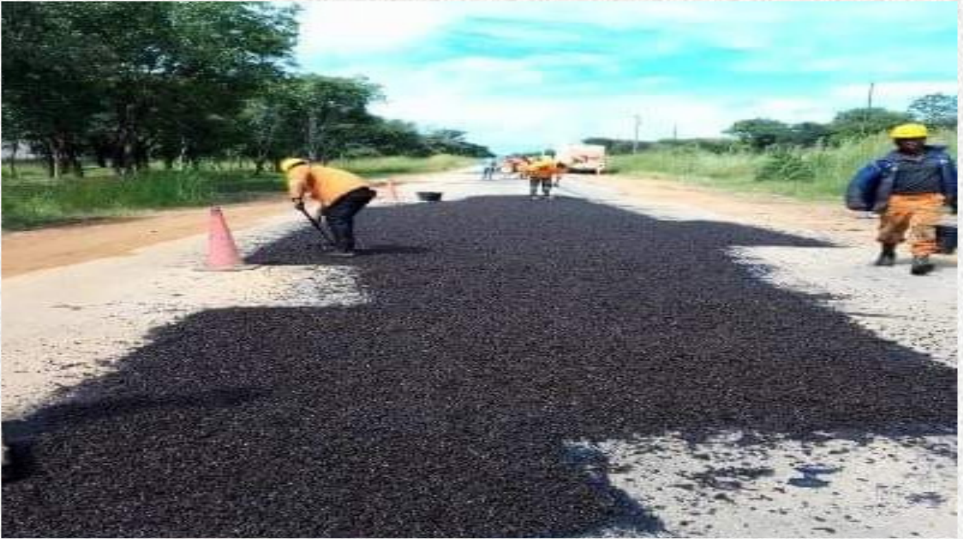
Chembe-Mansa road section under maintenance.

T he Chembe to Mansa to Nchelenge Road stretches from Chembe to Nchelenge via Mansa, Mwense and Mwansabombwe Districts of Luapula Province covering a total distance of 340.6 kilometers.