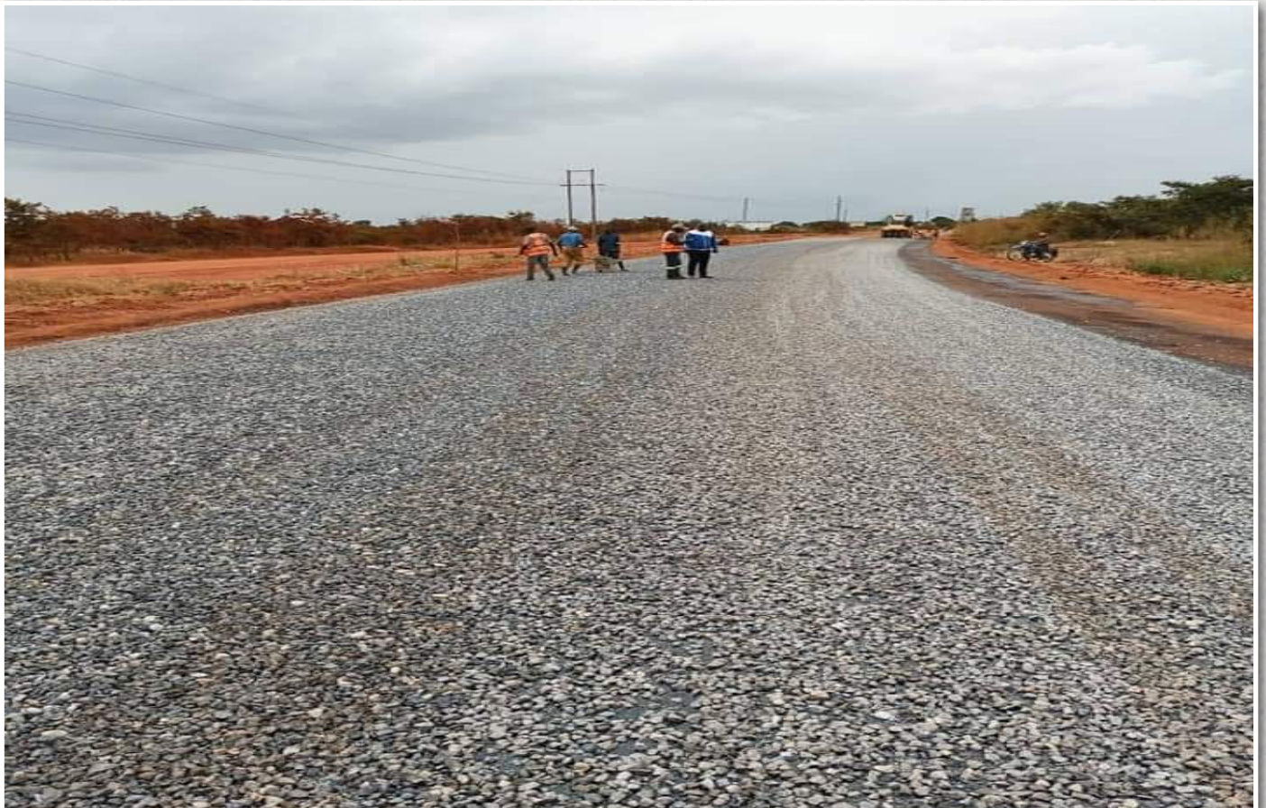
Fifty percent of the single seal has been done at Lundazi Bridge.