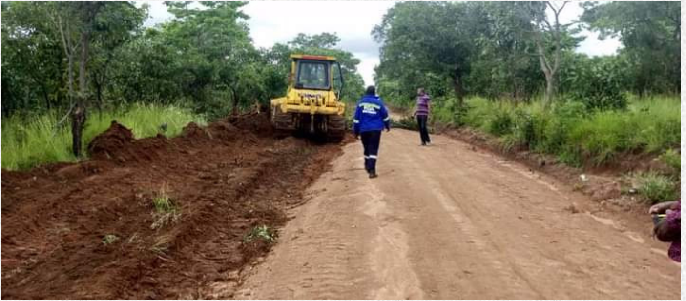
Clearing and grubbing on one of the access roads to tourism site in Chinsali.

T he Government through the Road Development Agency (RDA) in Muchinga Province has started works on access roads to tourism sites in readiness to the 2023 Muchinga Exposition (Expo).