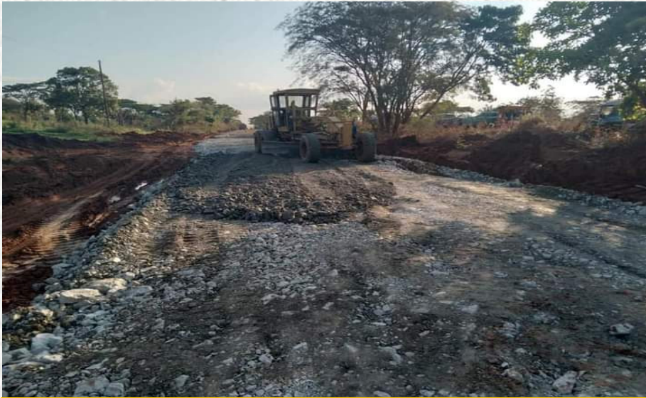
Works in progress on Chibuluma Road.

The Road Development Agency (RDA) in collaboration with two stakeholders is undertaking maintenance works on Chibuluma Road in Kitwe.