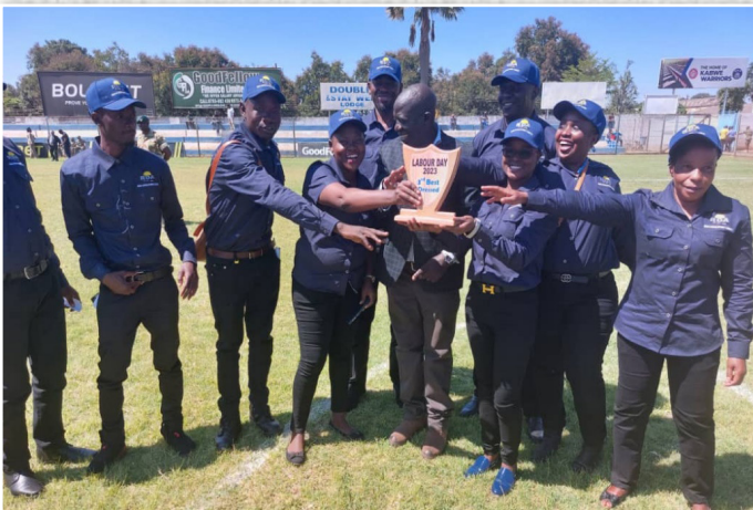
Group photo from the team at the Central Regional Office.