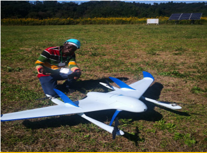
Bridge Inspection Course in Japan (October 2022) at the Drone Academy.