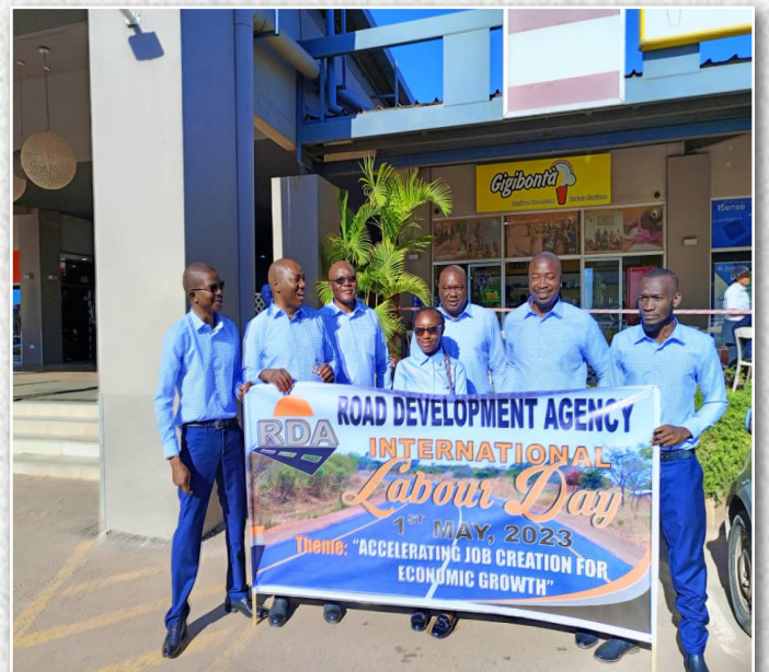
Group photo from the team at the Copperbelt Regional Office.