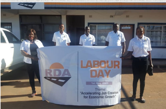
Group photo from the team at the Eastern Regional Office.