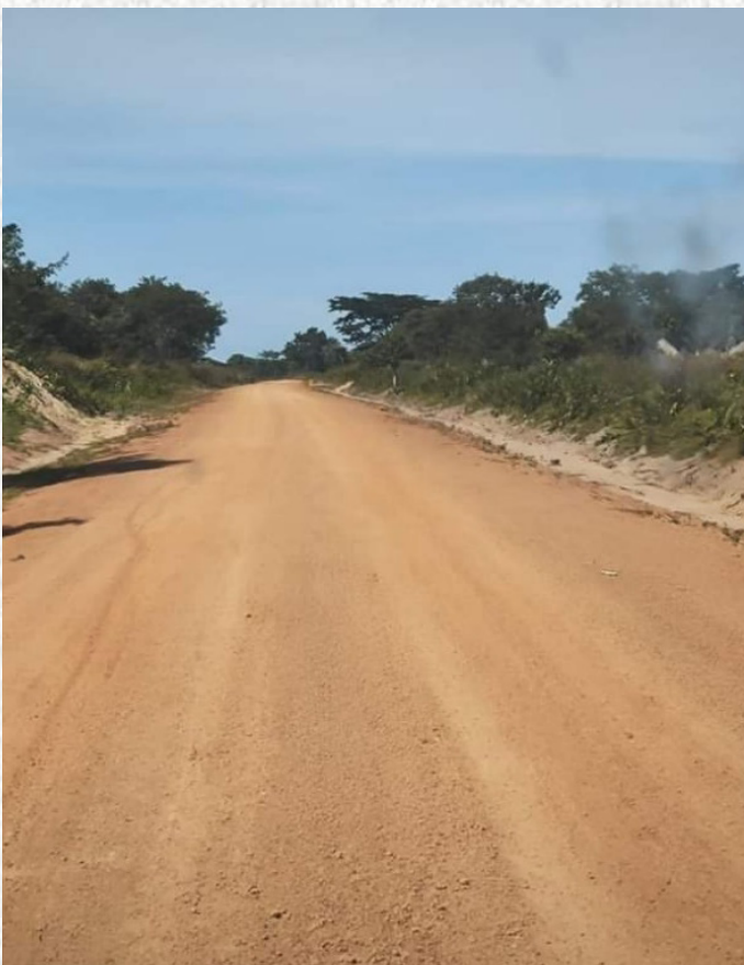
Completed Primary Feeder Road Package 10 under maintenance in Samfya.