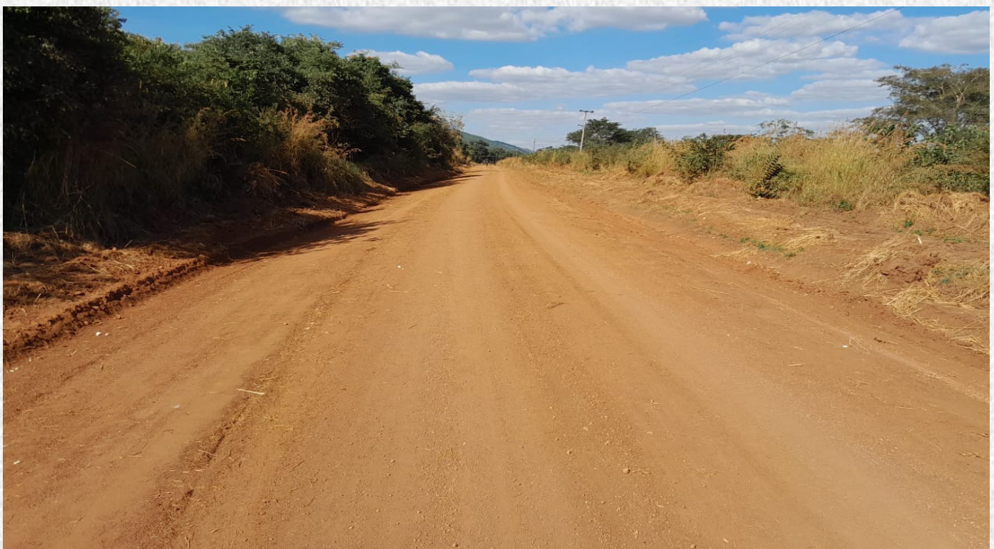
Graded section of the Chipata-Magwero Road.