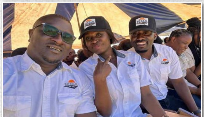
Team Northern Province.