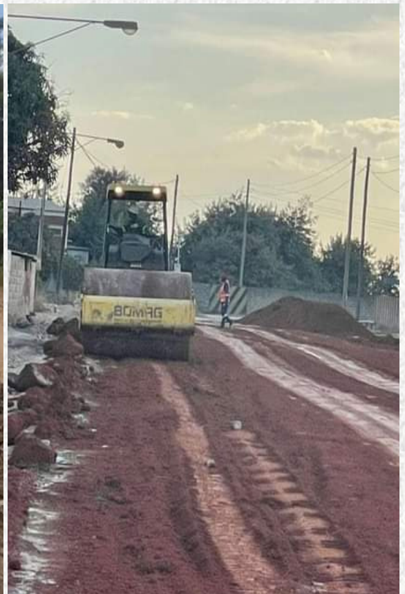
Chibuluma Road works.