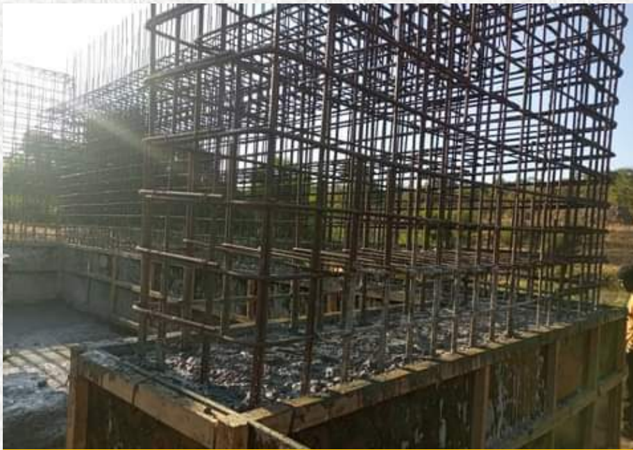
Formwork and casting of concrete for the abutment stem at Mkushi Bailey Bridge.

T he Ministry of Infrastructure, Housing and Urban Development (MIHUD), through the Road Development Agency (RDA) in July this year, embarked on the project to construct a 45.72 metres long Bailey Bridge across the Mkushi River in the Luano District of Central Province.