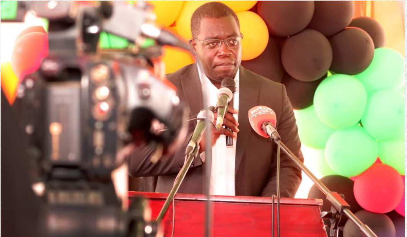
Commerce, Trade and Industry Minister, Hon. Chipoka Mulenga giving his remarks during the signing of the Concession Agreement for the development of Sakania Border Post infrastructure and the Ndola-Mufulira Road on the Copperbelt Province.