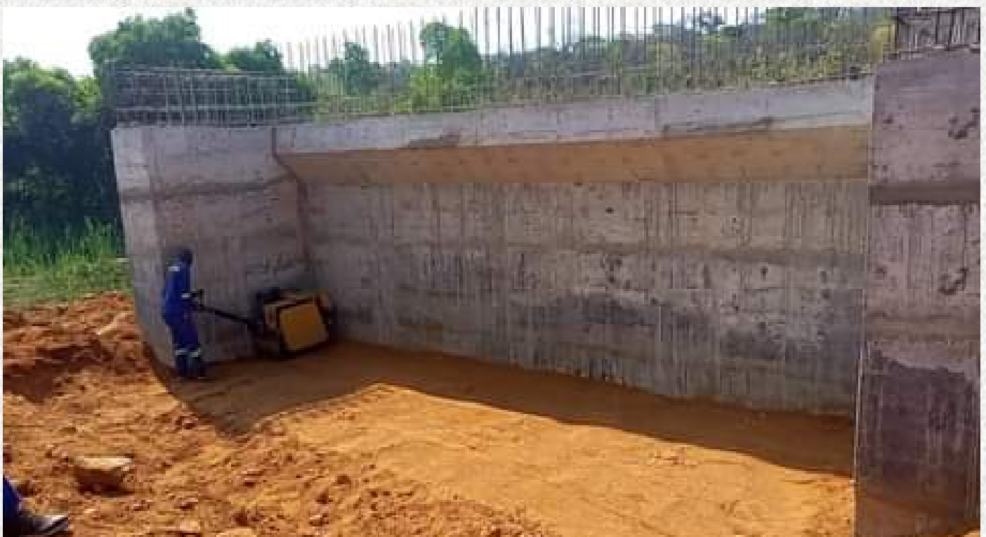
Compaction near the stem with a pedestrian roller at Mkushi Baily Bridge.

The major outstanding works are: the assembly and launching of the Bailey Bridge; installation of the relief culverts and completion of approach embankment construction; and ancillary works.