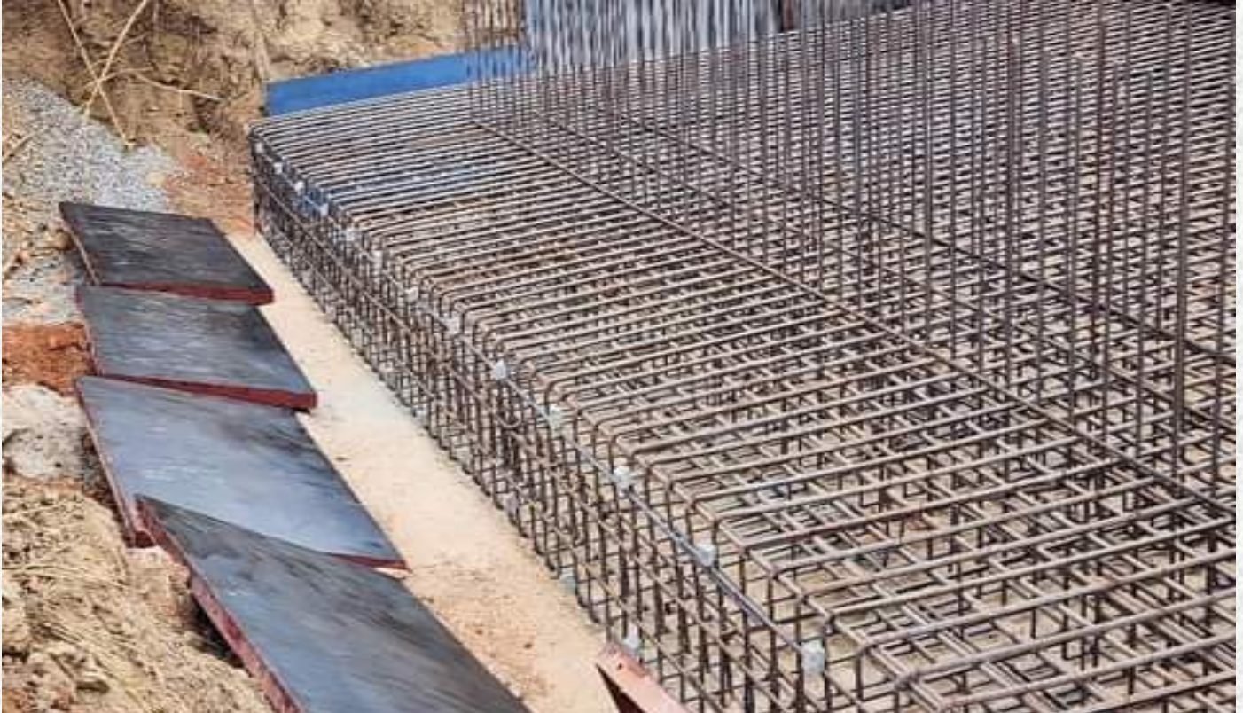
Reinforcement of the abutment base.

T he Road Development Agency (RDA) in June 2023 embarked on the project to construct the 51.67 metres long ACROW Bridge across the Luombwa River in the Nasanga Farm Block of Serenje District in Central Province.