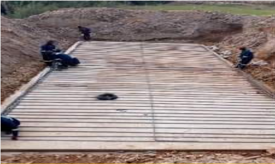
Tying steel reinforcement for the base at Lwitikila ACROW Bridge in Kanchibiya District.

The Road Development Agency (RDA) in July this year embarked on the project to construct the Lwitikila ACROW Bridge under Force Account in Kanchibiya District in Muchinga Province.