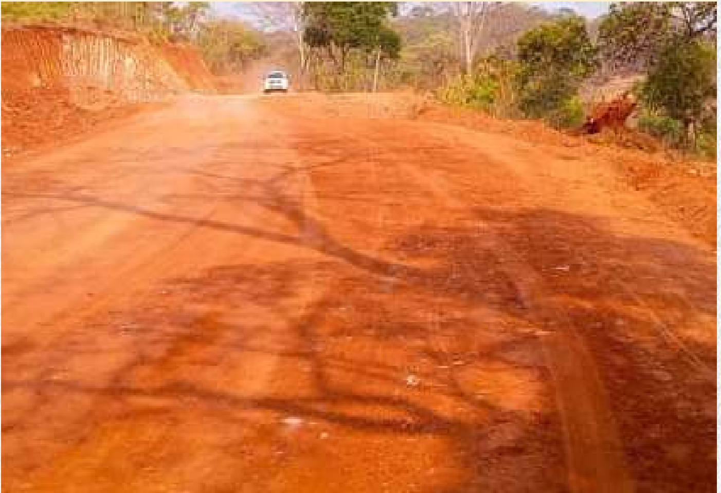
A section of the rehabilitated Chipata-Magwero Road in Eastern Province.

I nfrastucture, Housing and Urban Development Minister, Hon. Eng. Charles L. Milupi and three other Cabinet Ministers recently inspected the rehabilitated Chipata-Magwero Road in Eastern Province.