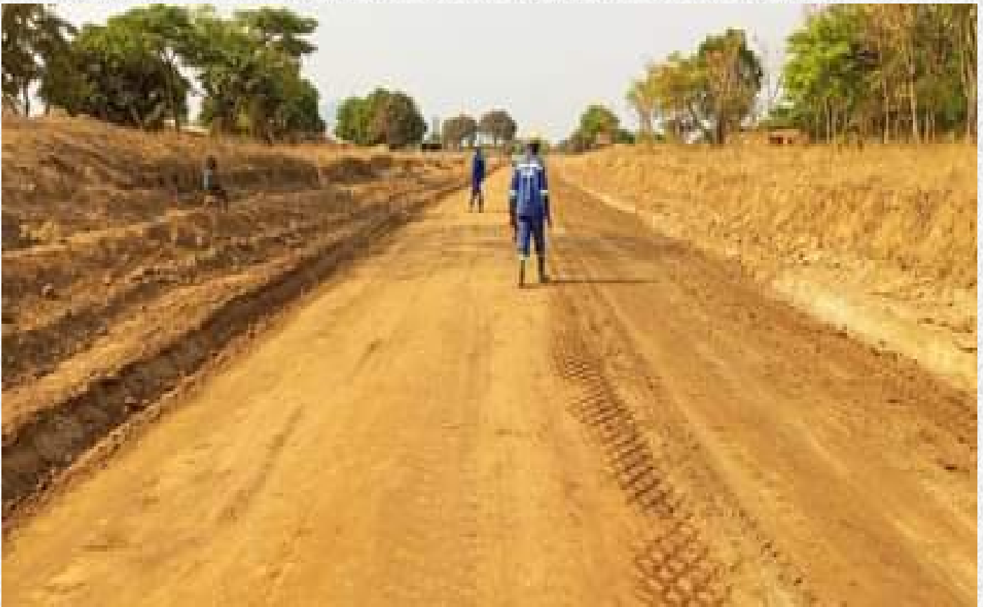
Road formation works underway.

Currently, clearing and grubbing has been completed and road formation works are underway.