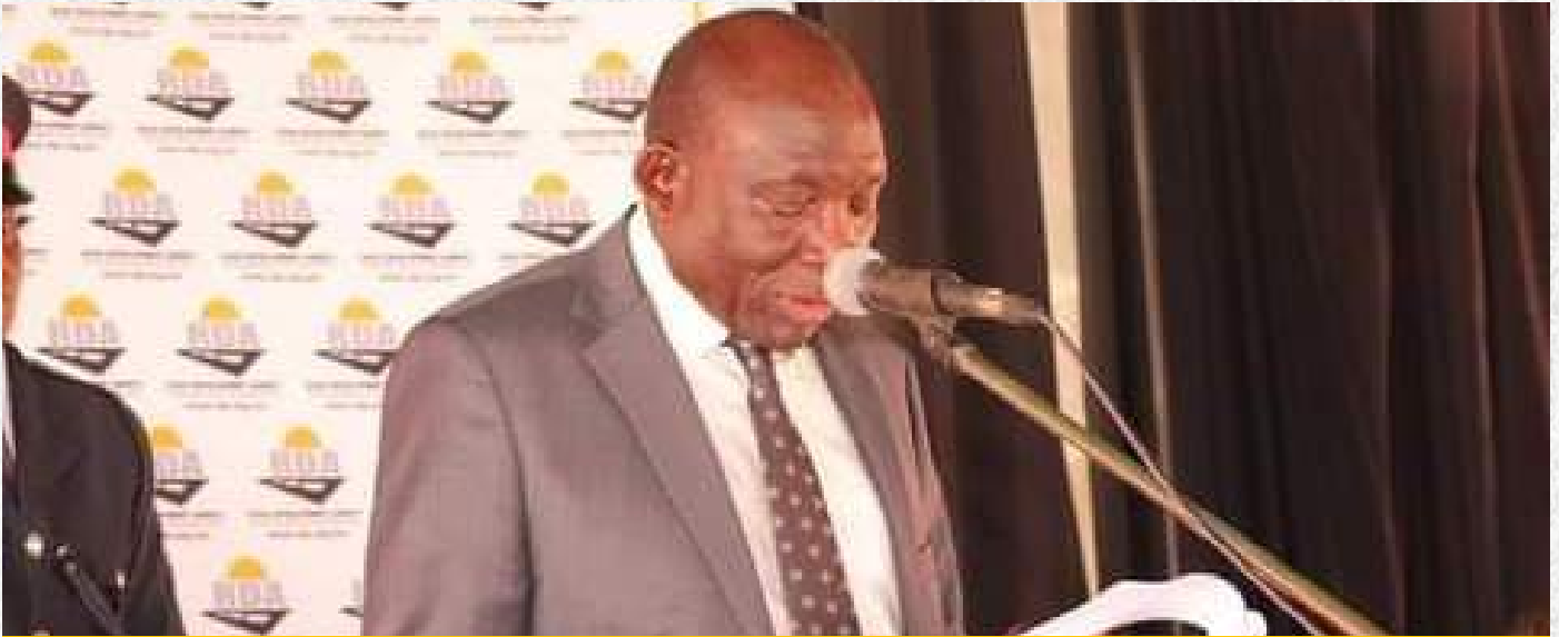
Infrastructure, Housing and Urban Development Minister, Hon. Eng. Charles L. Milupi reading his speech during the signing of the Concession Agreement for the reconstruction of Katete to Chanida Road and associated border infrastructure.