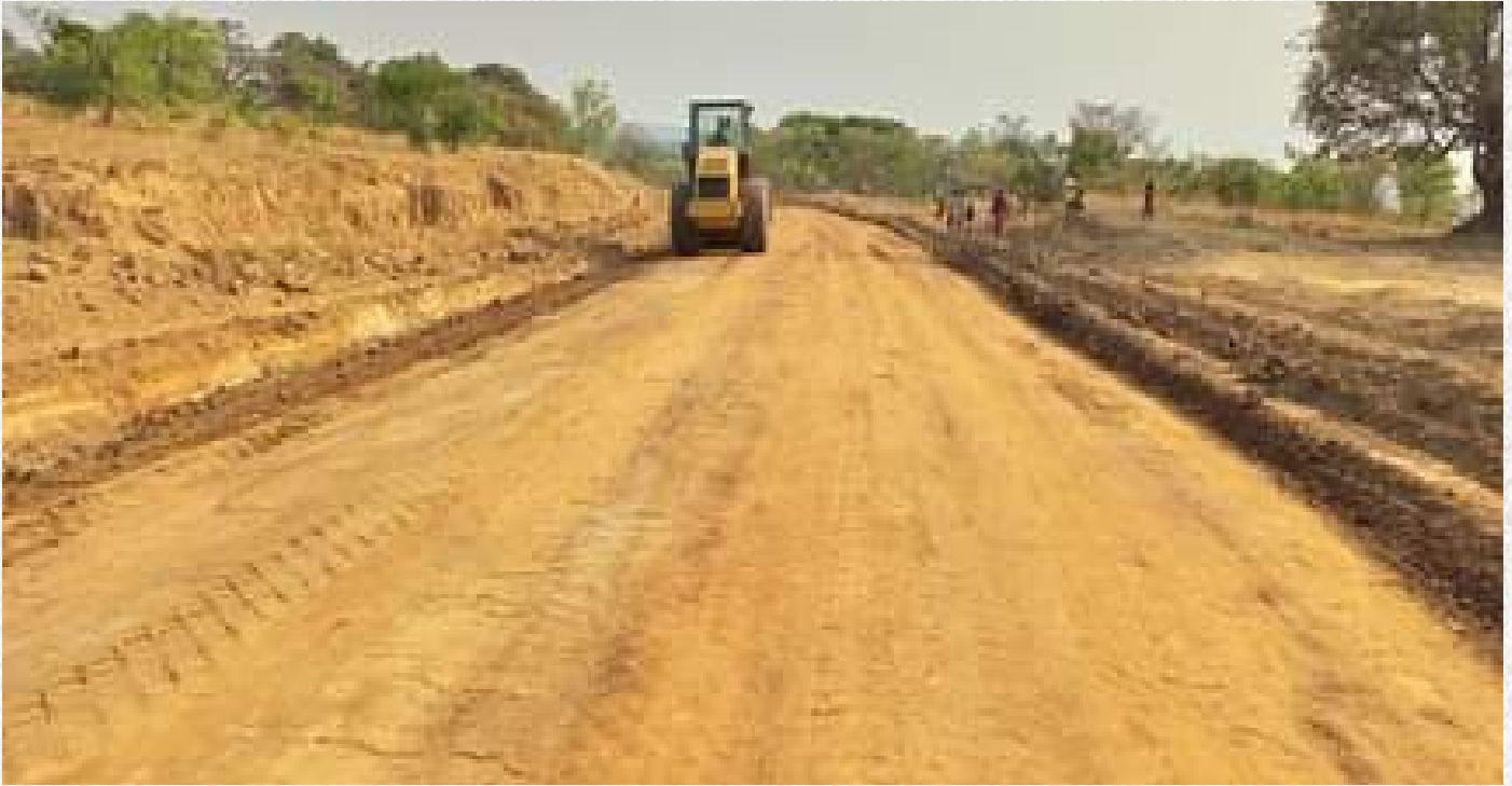
Re-graveling works on the Chipata-Vubwi Road.

T he Road Development Agency (RDA) through the Eastern Regional Office in September this year commenced spot improvement works on the Chipata-Vubwi Road.