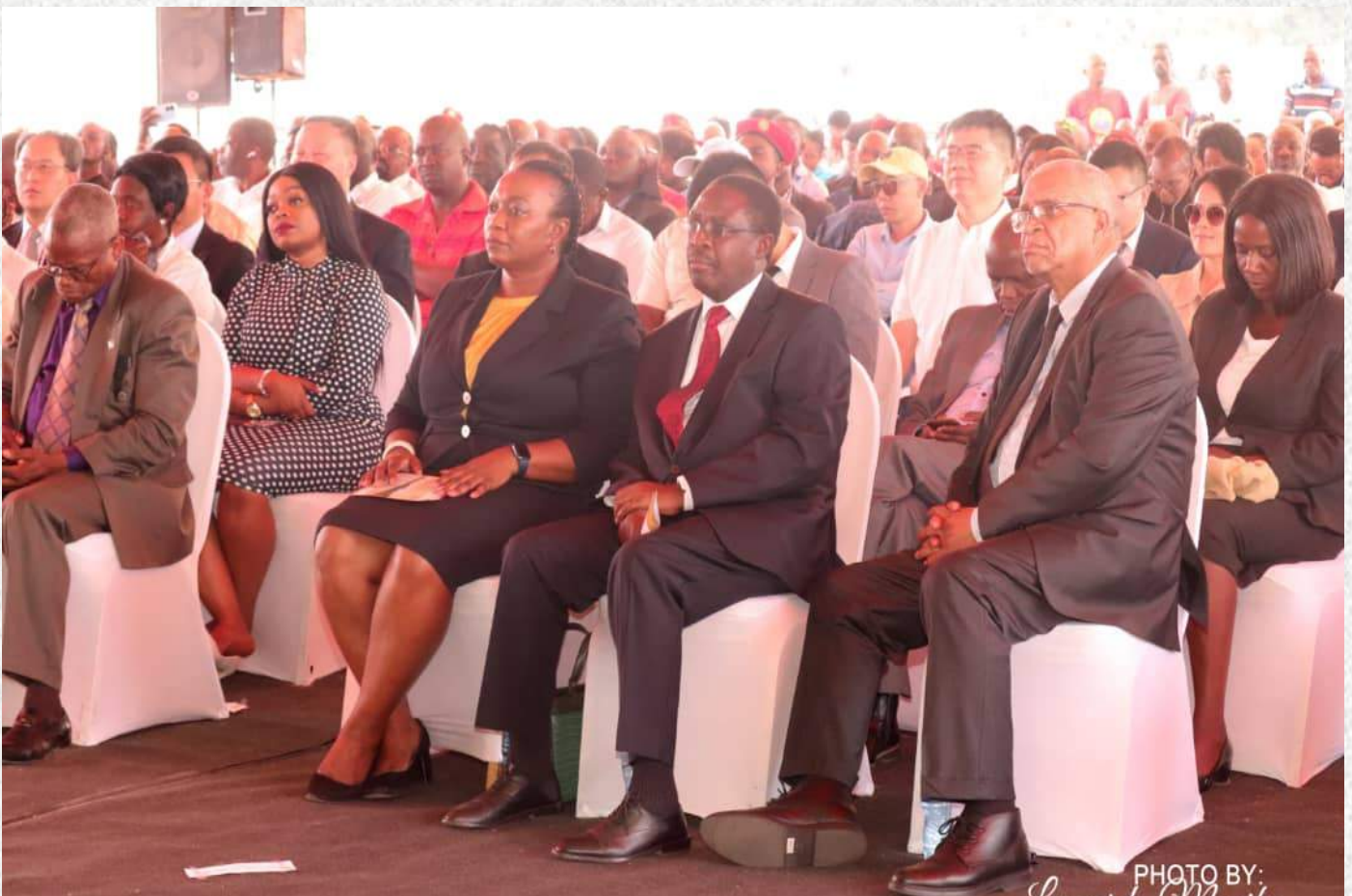
Public Private Partnership (PPP) Council Members and guests following proceedings during the signing ceremony of the Concession Agreement.