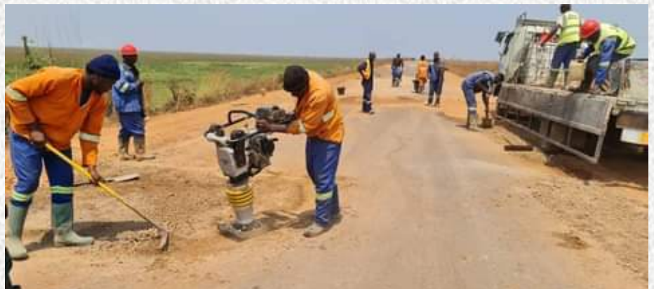
Pothole patching works on the Tuta Road.

The works are being carried out under Force Account by the Road Development Agency (RDA) Luapula Regional Office and are expected to be completed in November this year.