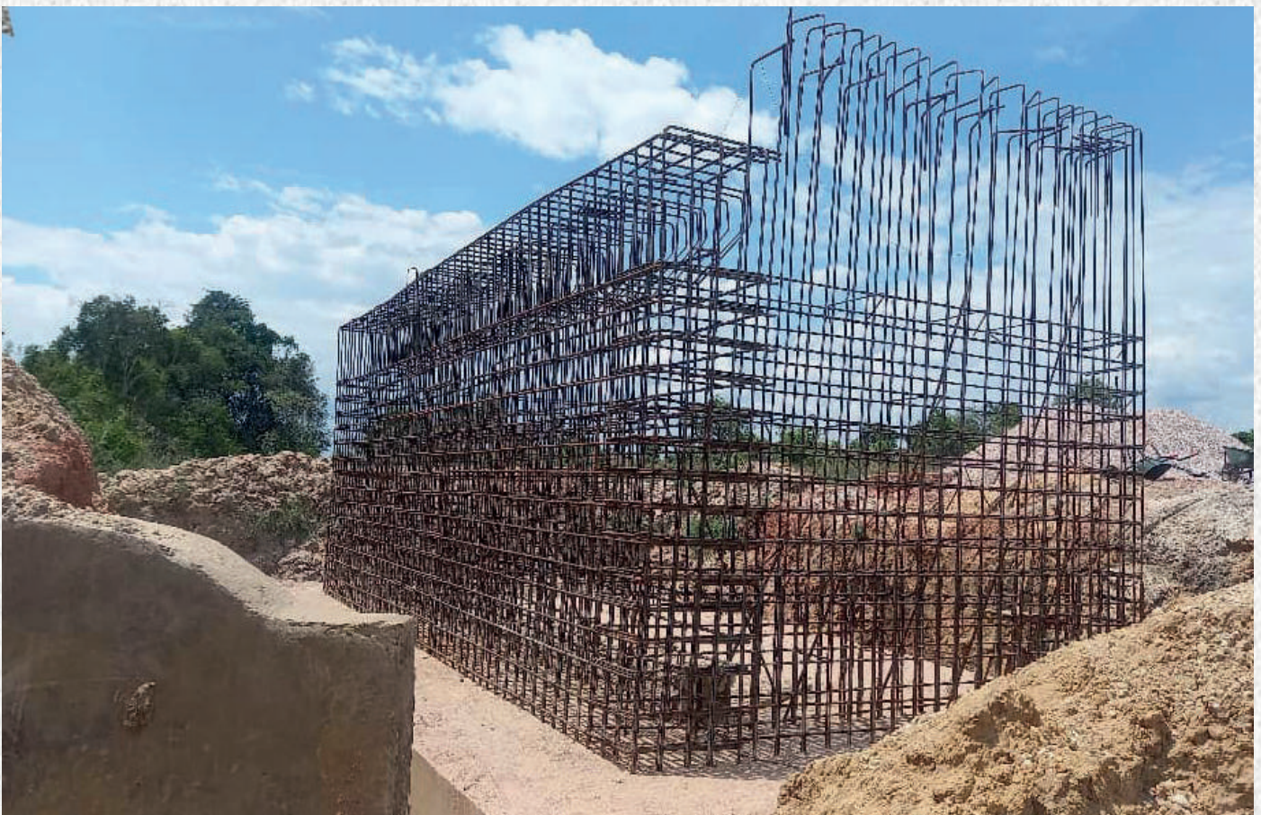
Reinforcement of the abutment base.

Completed concrete footing for the abutment at Lwitikila ACROW Bridge in Kanchibiya District.