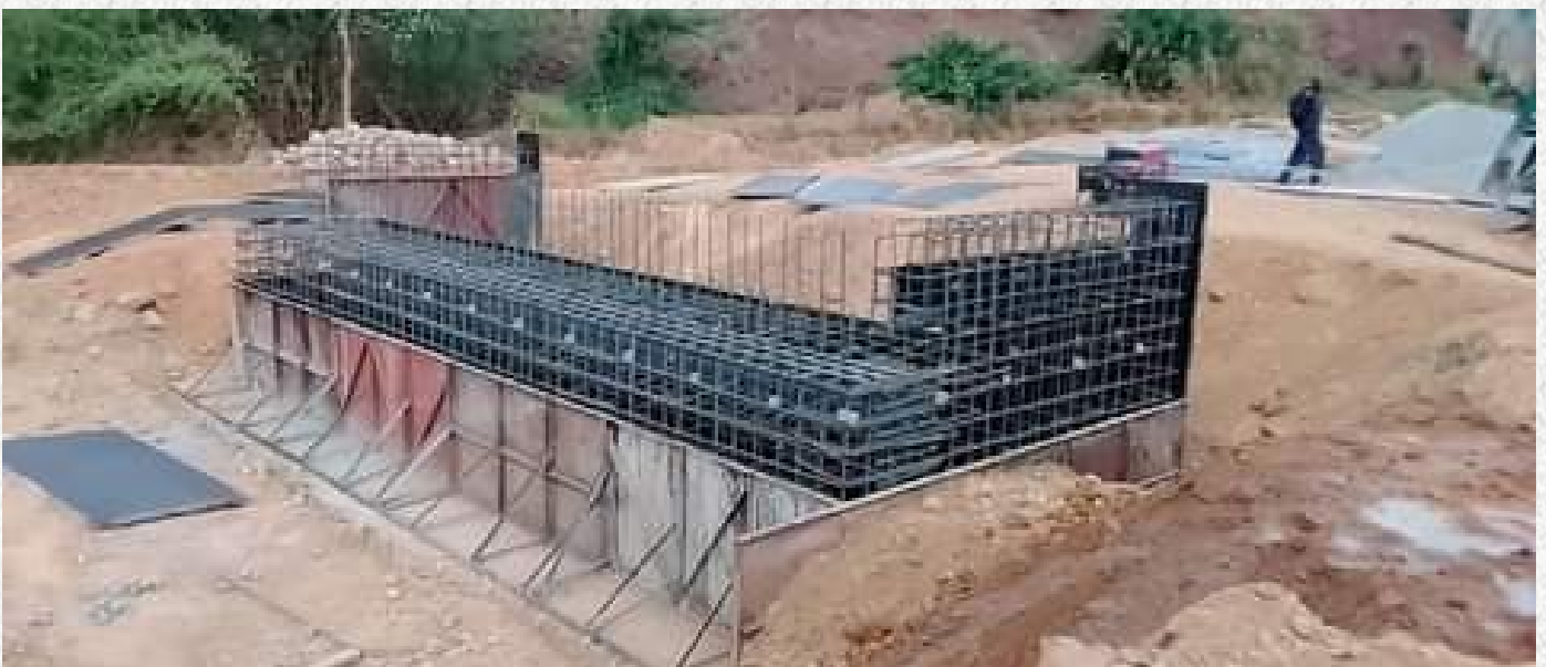
Preparation for the casting of concrete at the abutment.

The assembly and launching of the ACROW Bridge are expected to be completed towards the end of November, 2023.