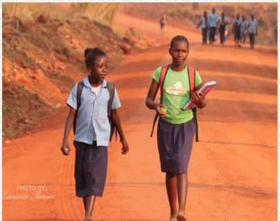
Pupils captured using the Chipata-Magwero Road.

The Chipata-Magwero Road is a stretch of 11.6 kilometers and has been rehabilitated under Force Account.