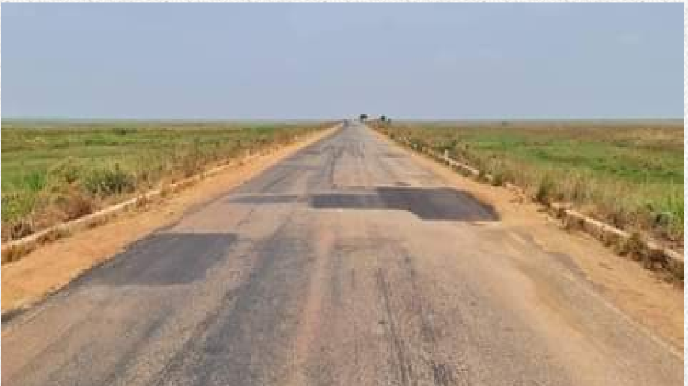
A completed patched section of the Tuta Road.