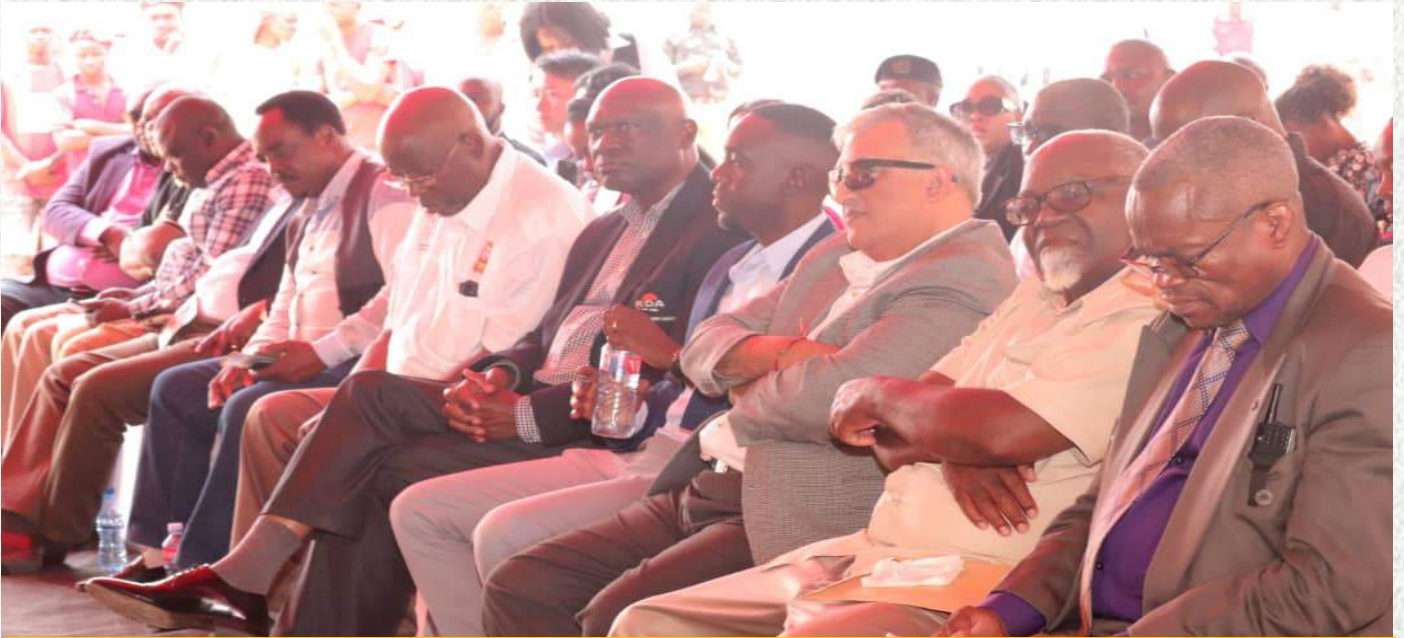
Road Sector Board Chairpersons and Vice Board Chairpersons following proceedings during the signing of the Concession Agreement for the development of Sakania Border Post infrastructure and the Ndola-Mufulira Road in Mufulira.