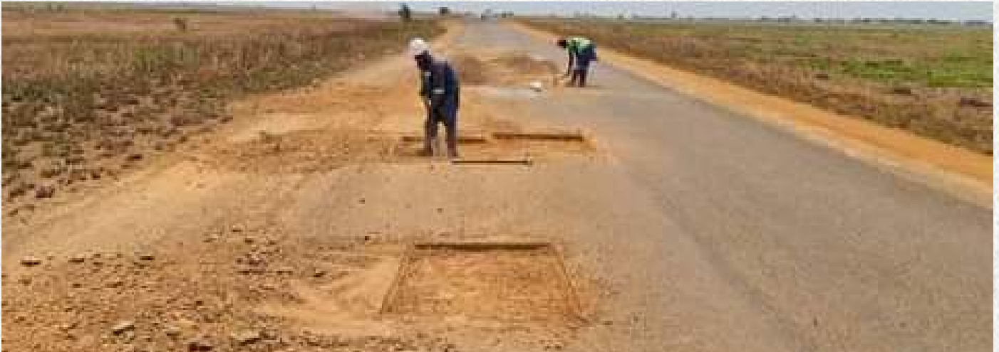
Pothole patching works in progress.

P othole patching works on the Tuta Road from Musaila to Mukuku Bridge in Luapula Province have recorded substantial progress.