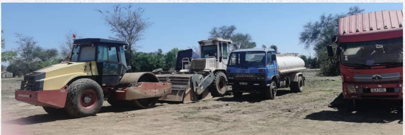
Equipment mobilization in preparation for commencement of works on the Monze-Niko Road in Southern Province.