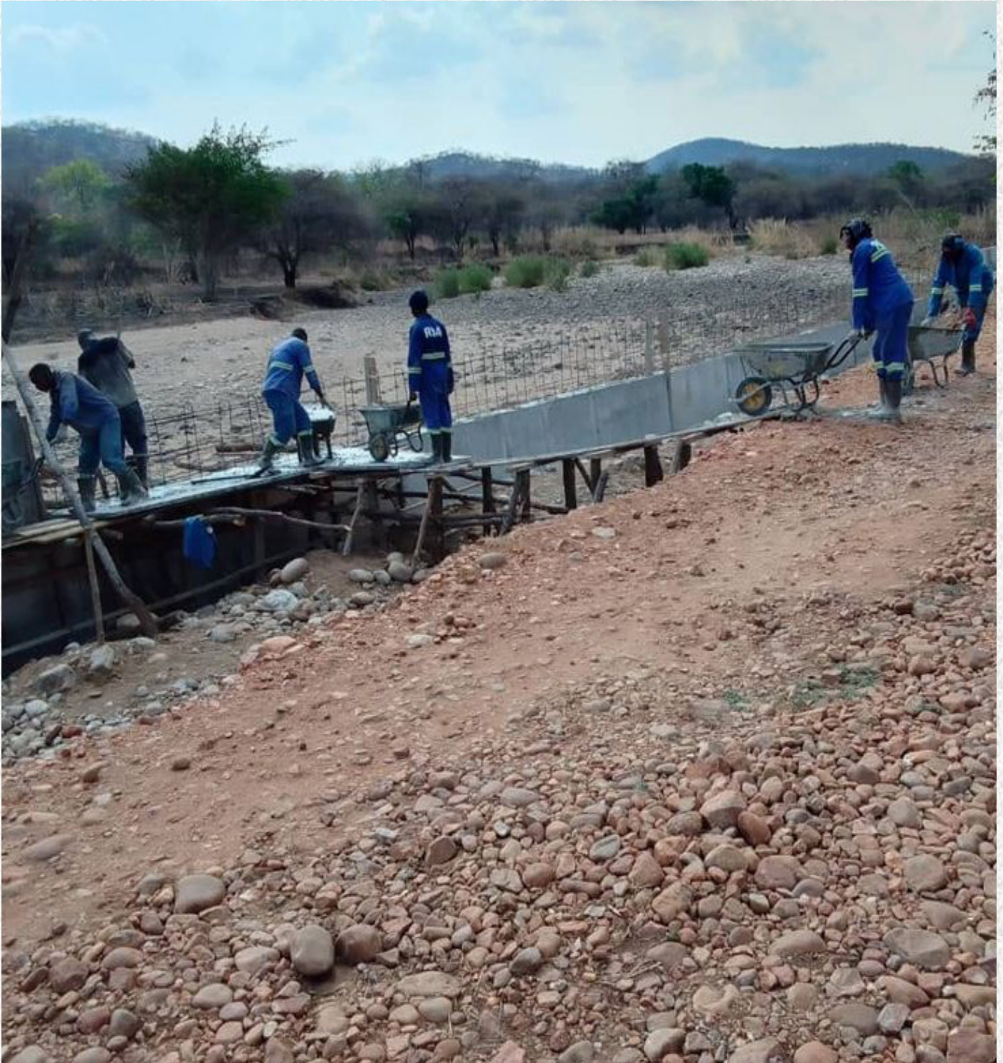
Construction of the retaining wall to protect the road embankment and Mwateshi Bridge in Rufunsa District.

The project has been carried out under Force Account by the Lusaka Regional Office.