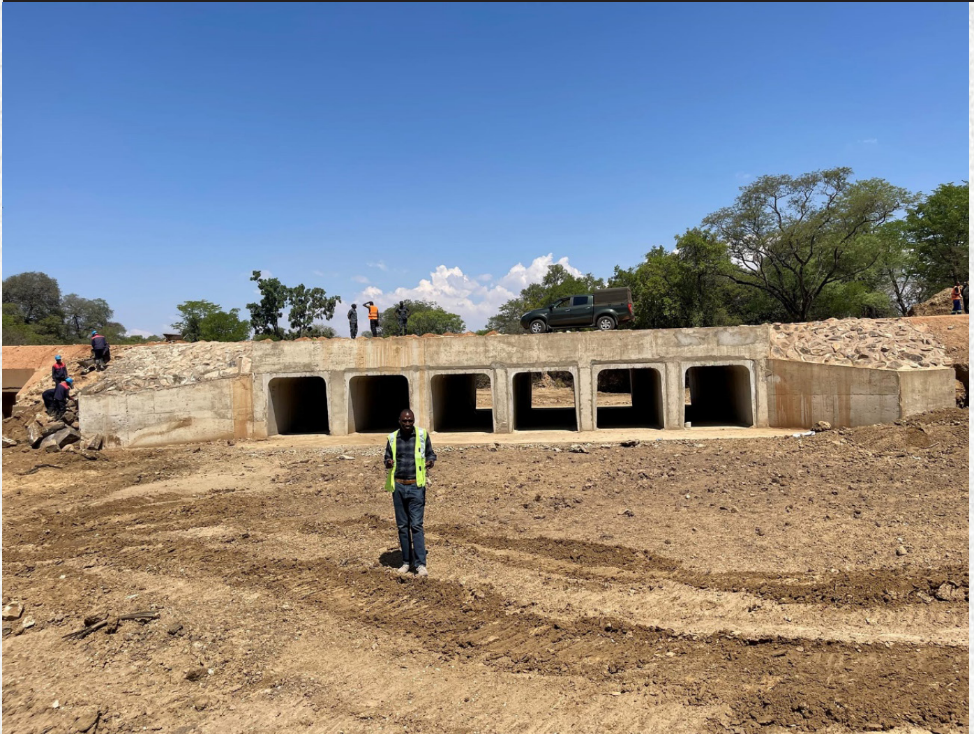
Six lines Dongo culvert along the Kalomo-Dundumwezi-Itezhi Tezhi Road in Southern Province.

T he Road Development Agency (RDA) has carried out the installation of six lines-portal frame culvert at Dongo crossing along the Kalomo-Dundumwezi-Itezhi Tezhi Road in Southern Province.