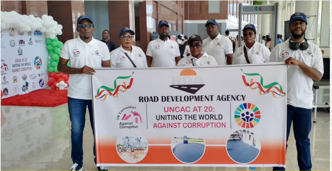
RDA participants during the 2023 International Anti-Corruption Day.

Meanwhile, the Road Development Agency (RDA) was among institutions that commemorated the 2023 International Anti-Corruption Day under the theme, “UNCAC at 20: Uniting the World Against Corruption.”