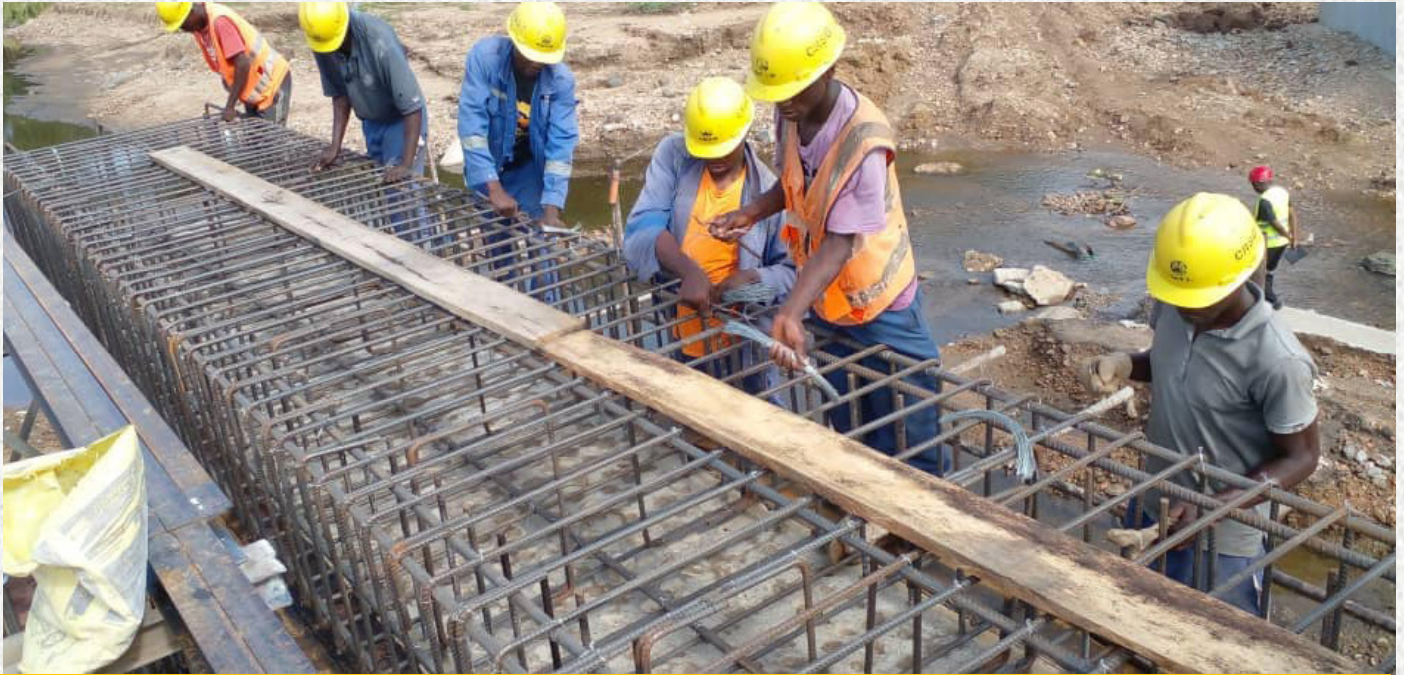
Steel works underway at Kampemba Bridge.

T he Government through the Road Development Agency (RDA) has engaged China Railway Seventh Group to construct the Kampemba and Luangwa Bridges in Chama District.