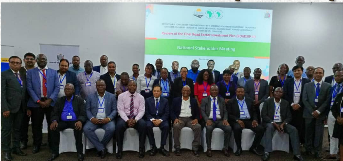
A group photo of some delegates that attended the stakeholder's engagement on the Draft Road Sector Investment Plan (RoadSIP III).

V arious stakeholders in the Road Sector recently converged at Mulungushi International Conference Centre in Lusaka to review the Draft Road Sector Investment Plan (RoadSIP III).