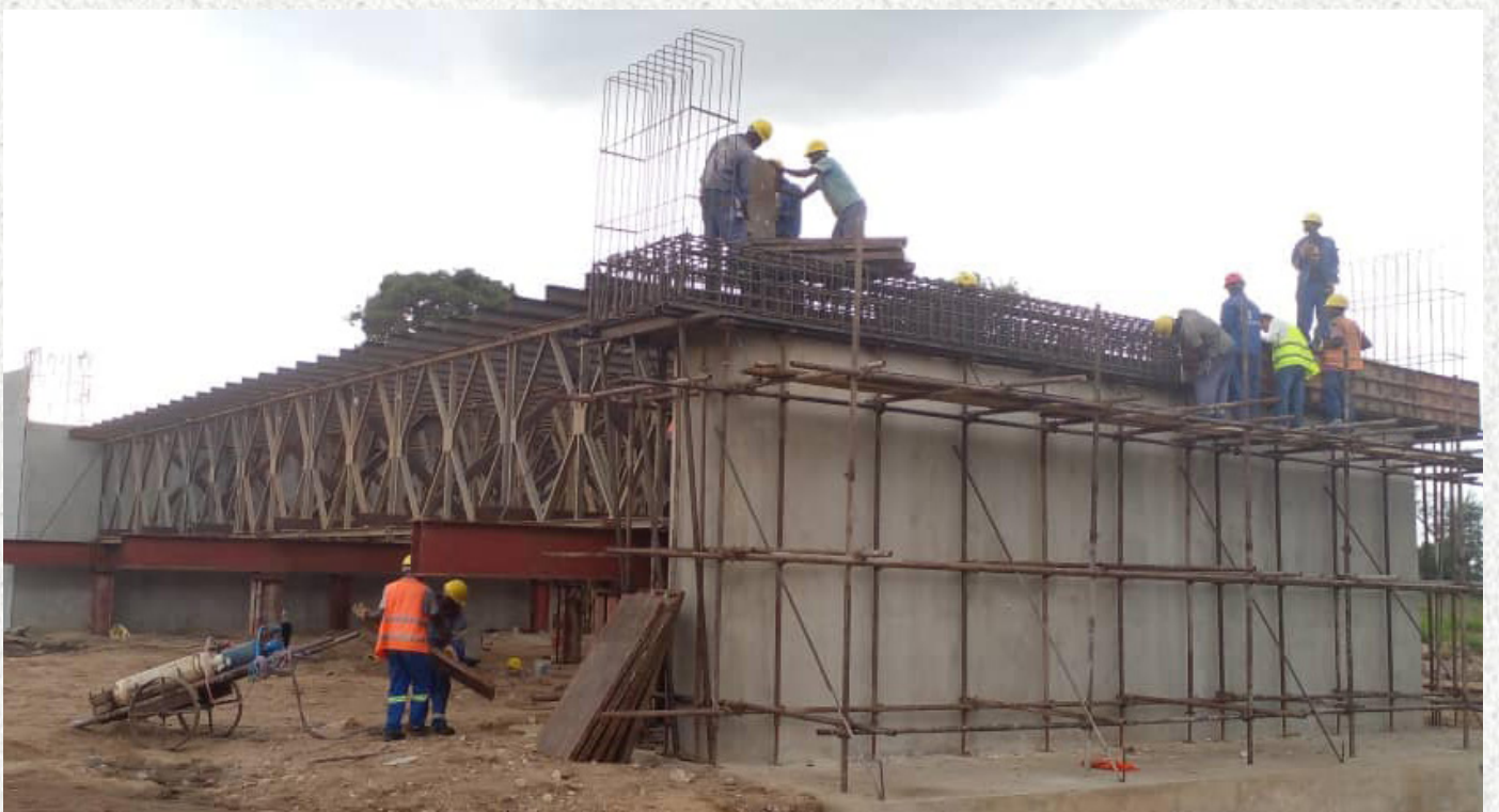
Kampemba Bridge under construction.

The contractor is currently working on the preparation works for the deck on the 45 metres span Kampemba Bridge.