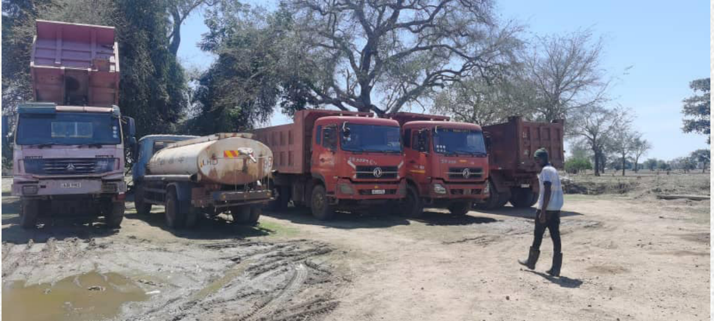
Equipment mobilisation in preparation for commencement of works on the Monze-Niko Road in Southern Province.

T he Government through the Road Development Agency (RDA) has embarked on a project to rehabilitate and upgrade the 74 kilometres Monze-Niko Road in Southern Province.