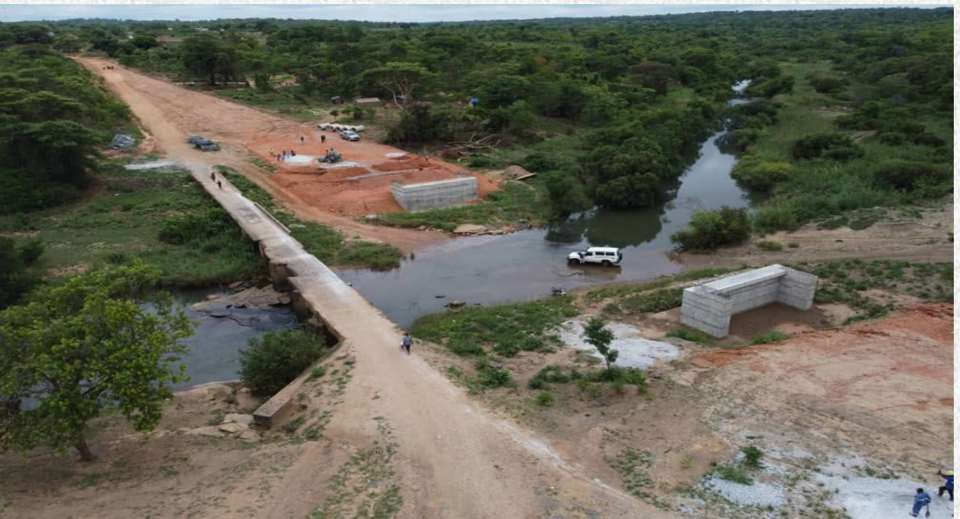
An aerial view of construction works at Mkushi Bailey Bridge in Luano District in Central Province.

The Agency has significantly made progress on the major civil works such as the construction of both abutments which have attained 95% progress towards completion, while the works on the approach embankments are currently underway with physical progress netting 50%.