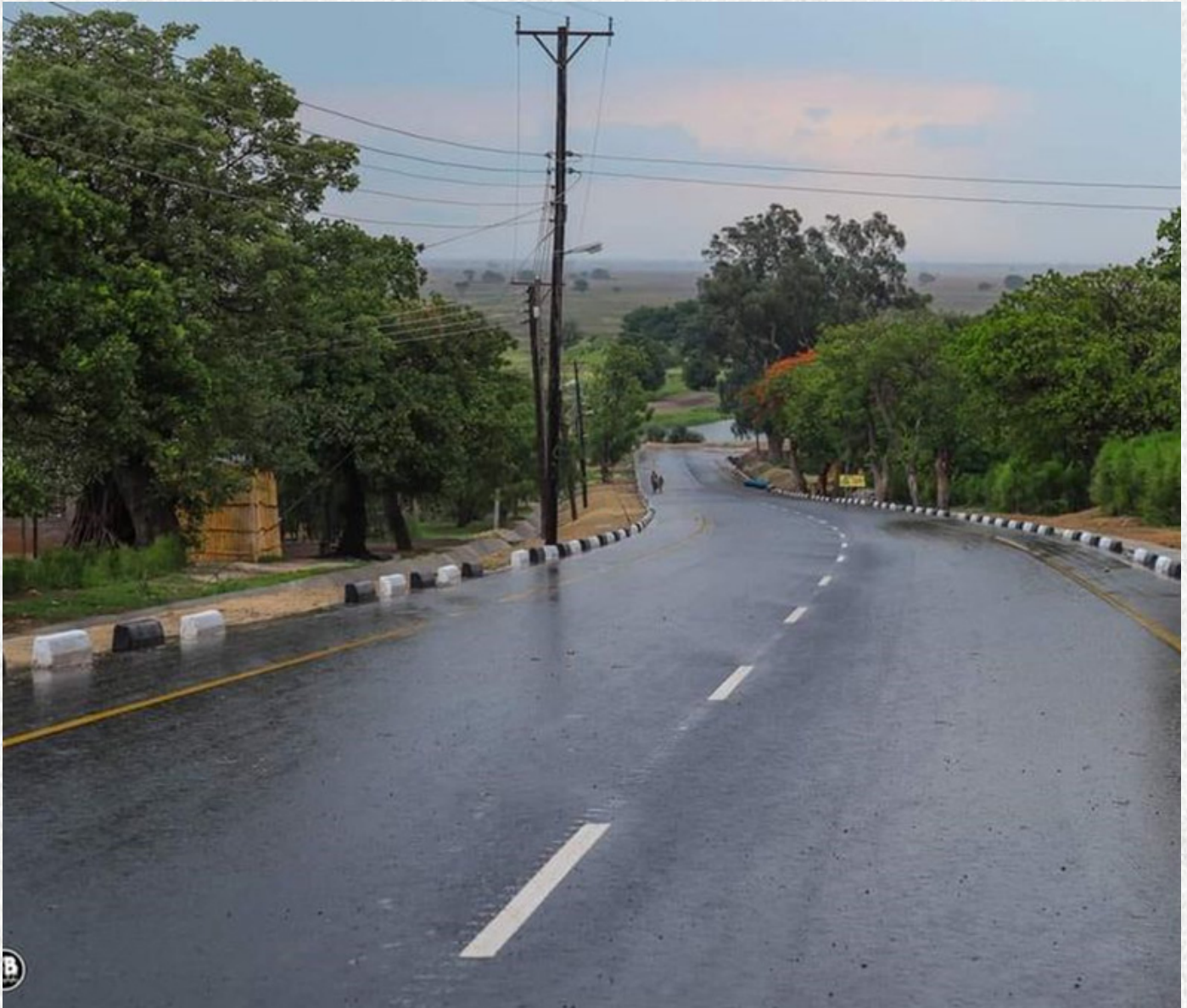
Newly rehabilitated Mongu-Limulunga Road.

I nfrastucture, Housing and Urban Development Minister, Hon. Eng. Charles L. Milupi says he is happy with the quality works executed on the Mongu-Limulunga Road as well as other road extension works on the project.