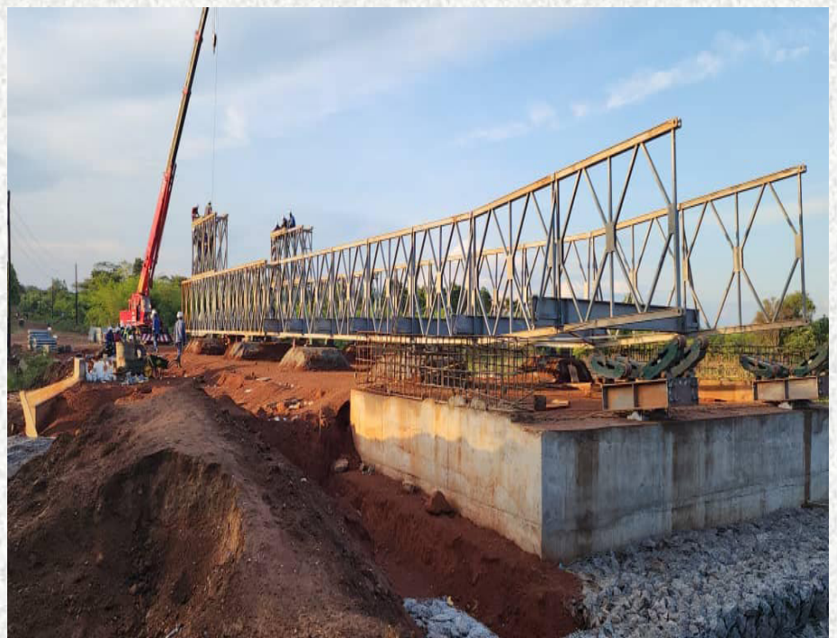
Launching of ACROW Bridge components.

The Agency has completed the major civil works and the remaining works are expected to be completed by mid-December 2023.