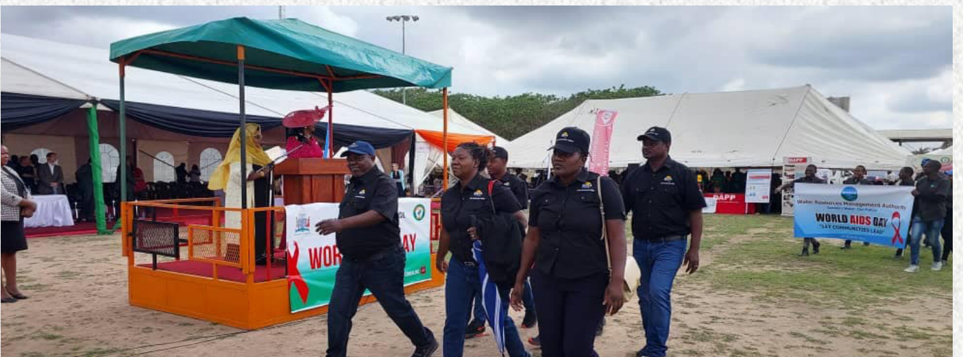
RDA taking the lead in the fight against HIV and AIDS.