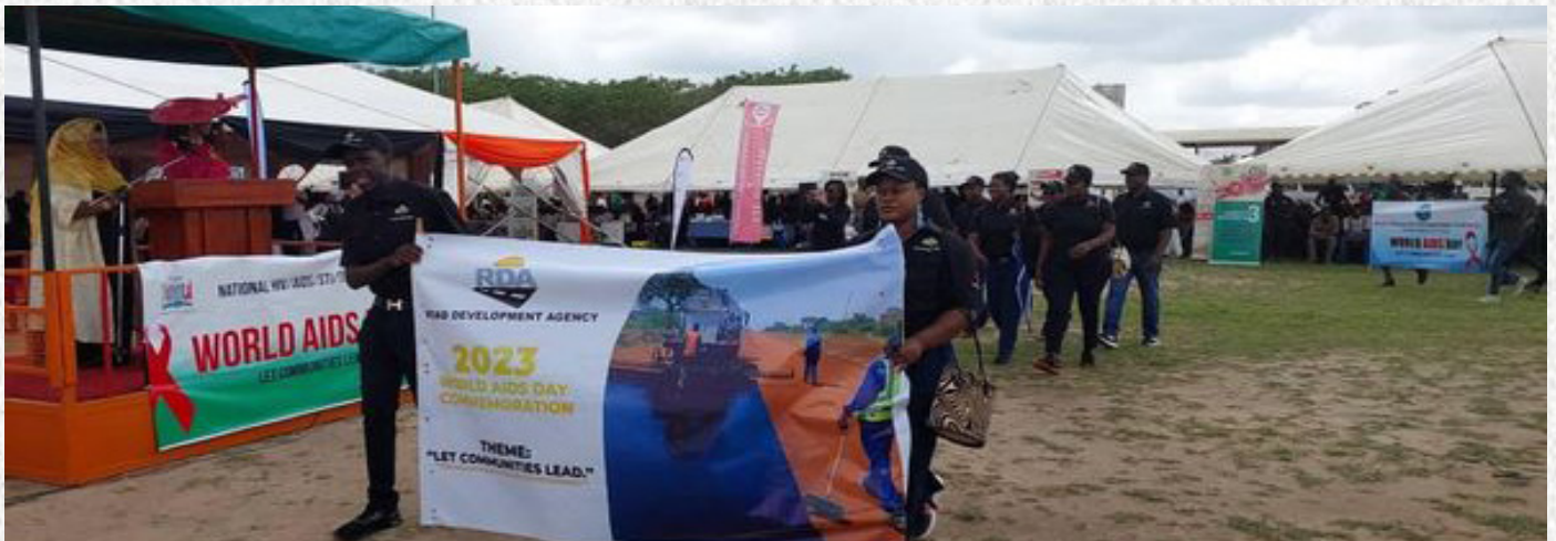
RDA staff during a march past during the commemoration of the 2023 World AIDS Day held at the Olympic Youth Development Centre (OYDC).

The national commemorative activities were held at the Olympic Youth Development Centre (OYDC) in Lusaka on 1 st December 2023.