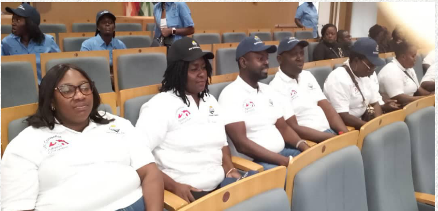
RDA participants during the 2023 International Anti-Corruption Day at Mulungushi International Conference Centre.