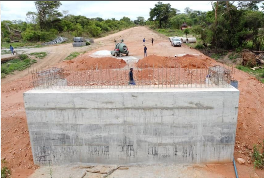
Construction of a Bailey Bridge in Luano District in Central Province underway.

T he Ministry of Infrastructure, Housing and Urban Development (MIHUD), through the Road Development Agency (RDA) has embarked on a project to construct the 45.72 metres long Bailey Bridge across the Mkushi River in the Luano District of Central Province.