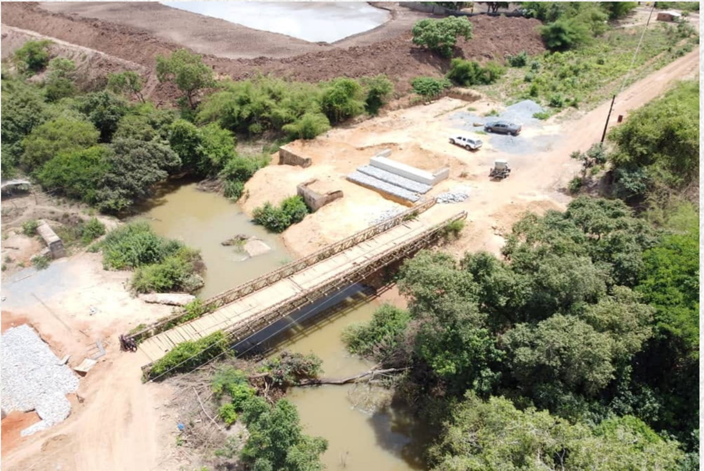
An aerial view of the 51.67 metres long ACROW Bridge being constructed across the Luombwa River in the Nasanga Farming Block of Serenje District in Central Province.

The Government through the Road Development Agency (RDA) has been constructing a 51.67 metres long ACROW Bridge across the Luombwa River in the Nasanga Farming Block of Serenje District in Central Province.