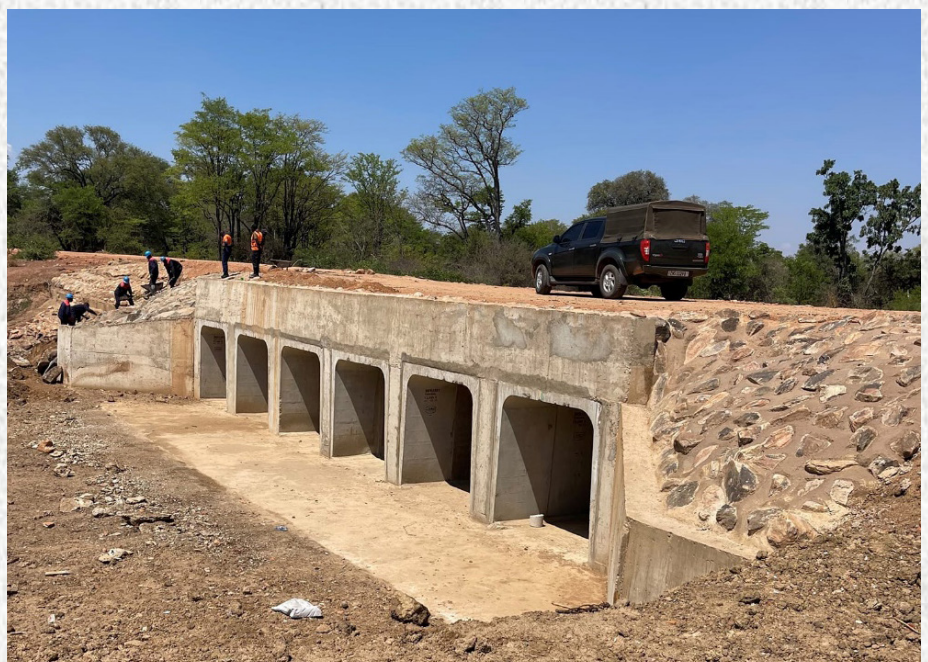
Six lines Dongo culvert along the Kalomo-Dundumwezi-Itezhi Tezhi Road in Southern Province.

The works on drainage structures along Kalomo-Dundumwezi-Itezhi Tezhi Road are being undertaken by the RDA in partnership with the Zambia National Service (ZNS).