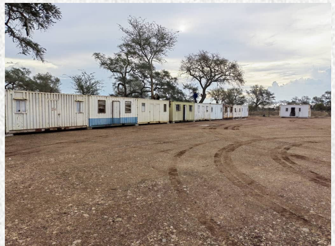
Camp establishment for the construction of the Monze-Niko Road.

Currently, camp establishment and mobilisation of the plant and equipment is underway. The contract was signed on November 7, 2023 and the project is expected to be completed within 24 months.