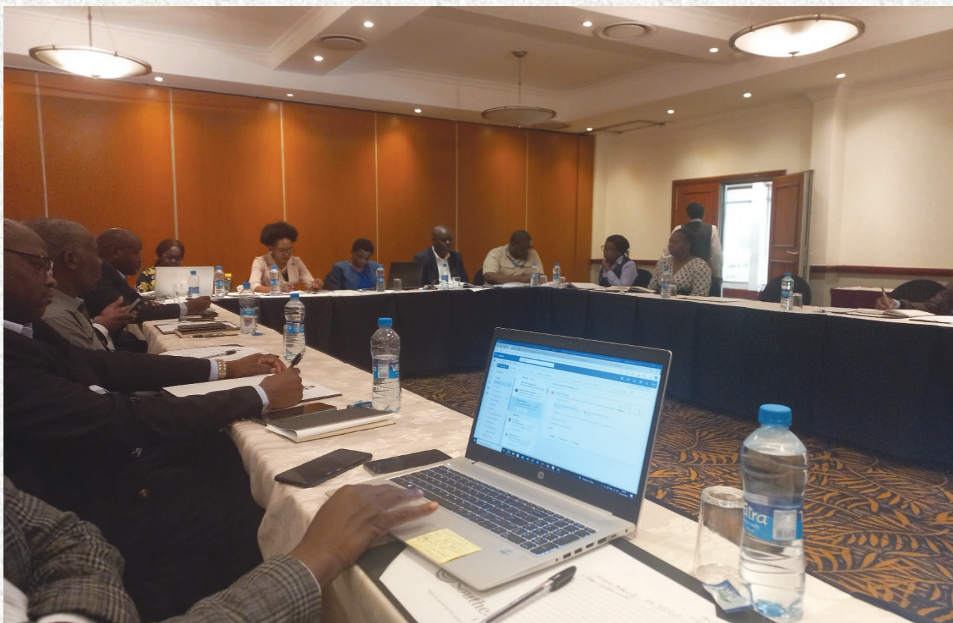
Management and Union Officials during the Union/Management meeting.