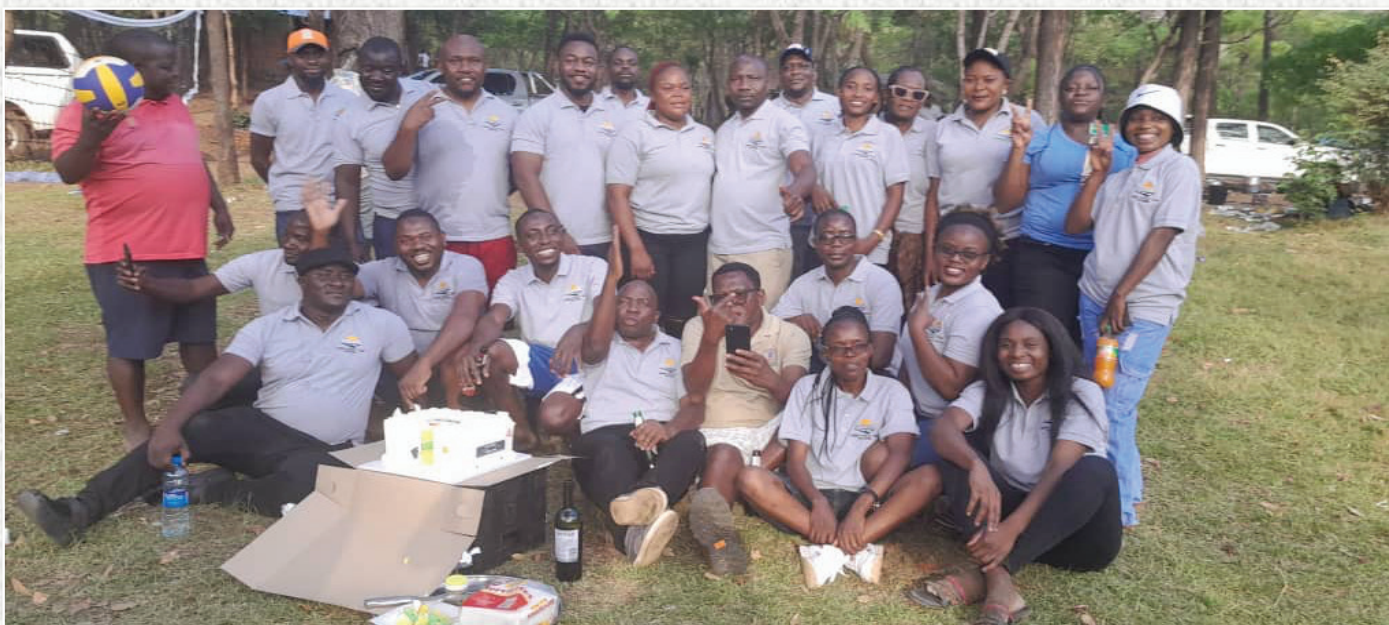
RDA Muchinga and Northern Region Officers during the team building exercise at Lwitikila Falls in Mpika.