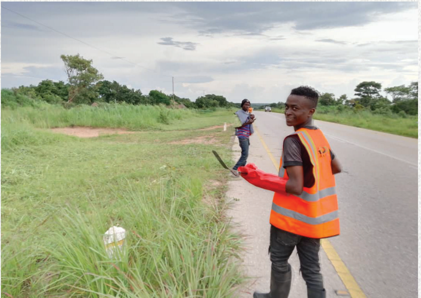
On the job: Musaila-Mukuku Bridge and Road Vegetation Control Project.