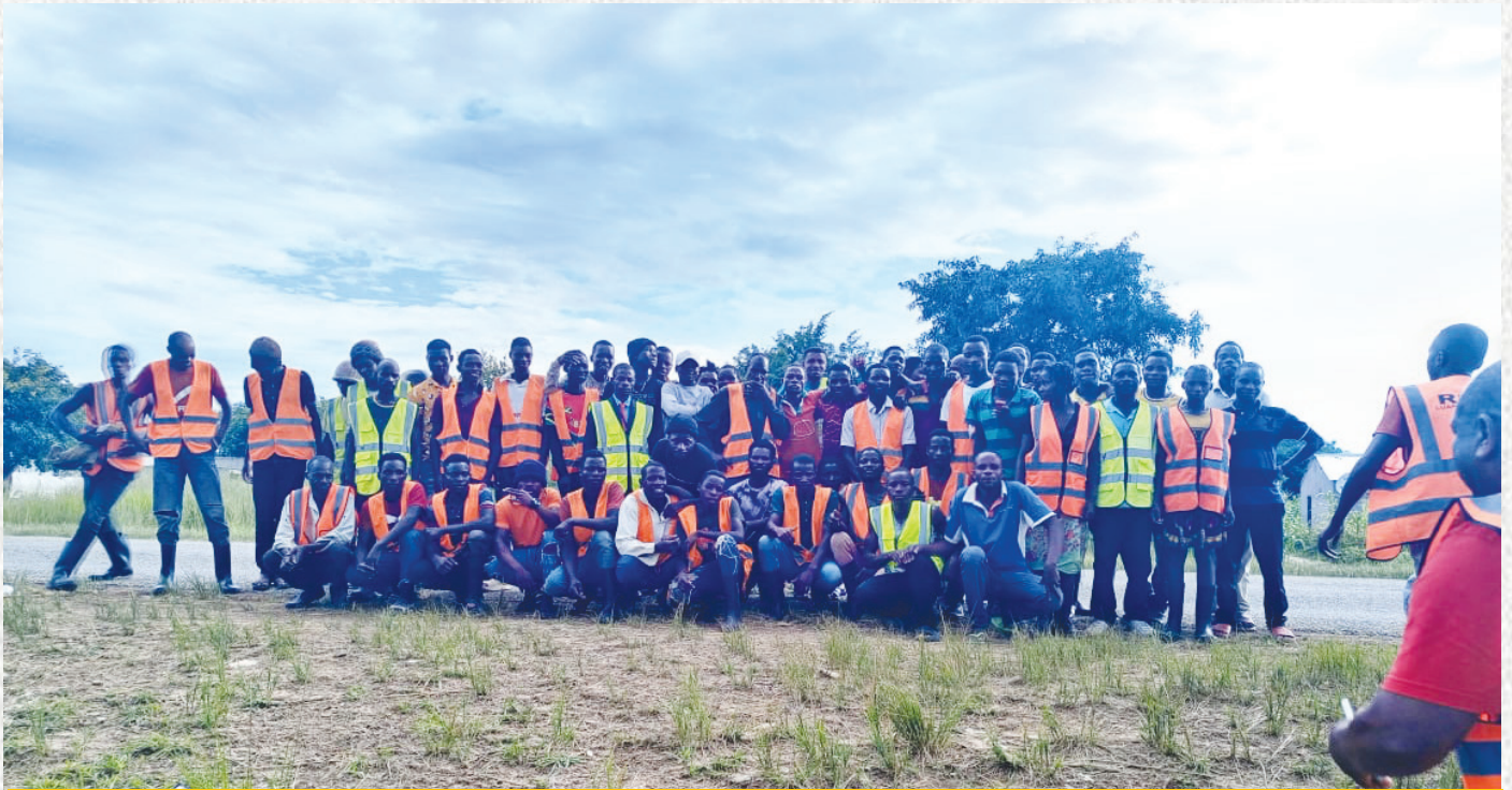
Temporary workers on Musaila-Mukuku Bridge and Road Vegetation Control Project.