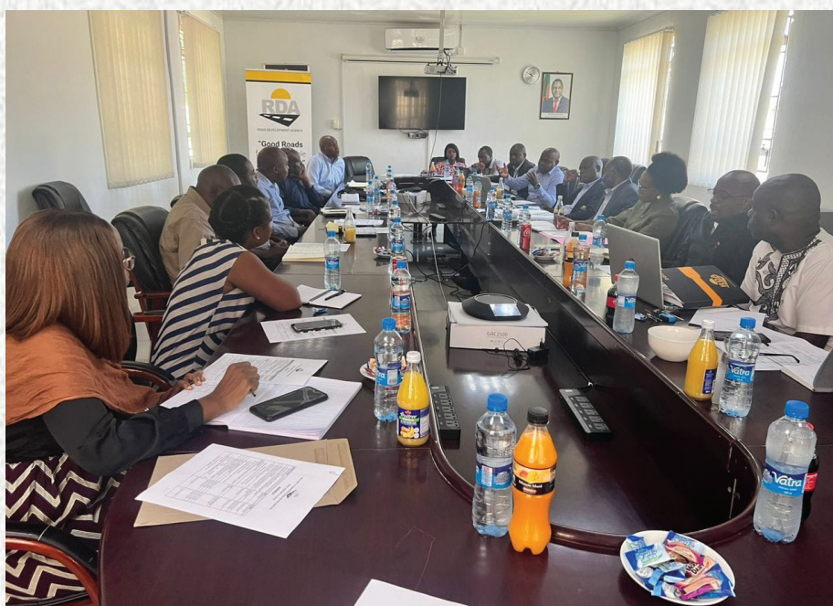
Officials from the RDA and the ACEZ during an engagement on matters pertaining to the Road Sector in Zambia held at the RDA Head Office.