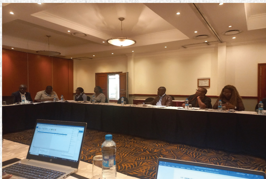
Some Union Officials during the meeting with RDA Management.

The two teams have agreed to be holding regular meetings to discuss matters pertaining to the running of the RDA in relation to employee welfare.