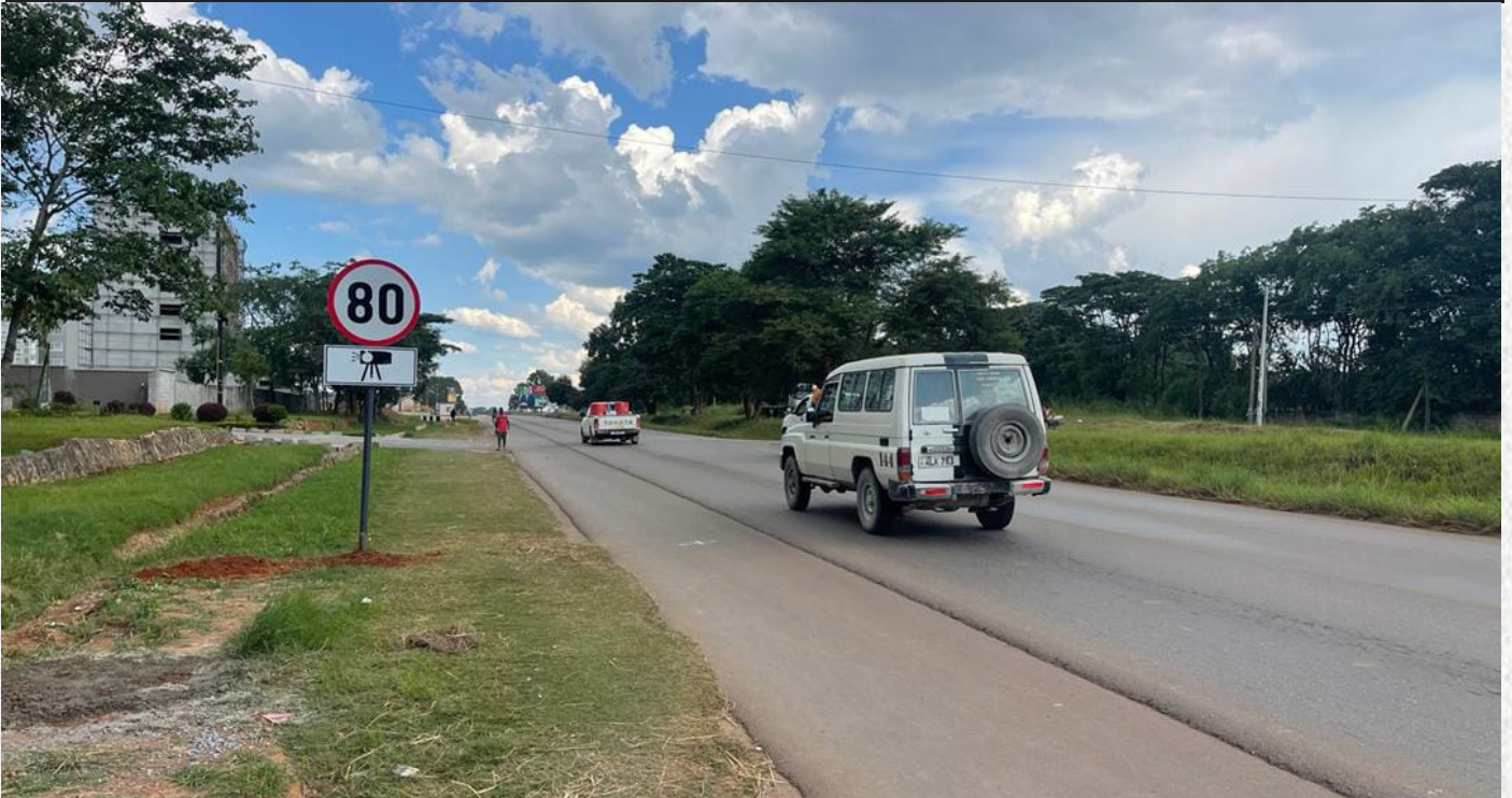
An 80 kilometres speed limit signage on Kapiri Mposhi-Chingola Road.

T he Road Development Agency (RDA) has completed the installation of camera speed limit signage on the T3, Kapiri Mposhi-Chingola and the Sabina-Mufulira Roads.