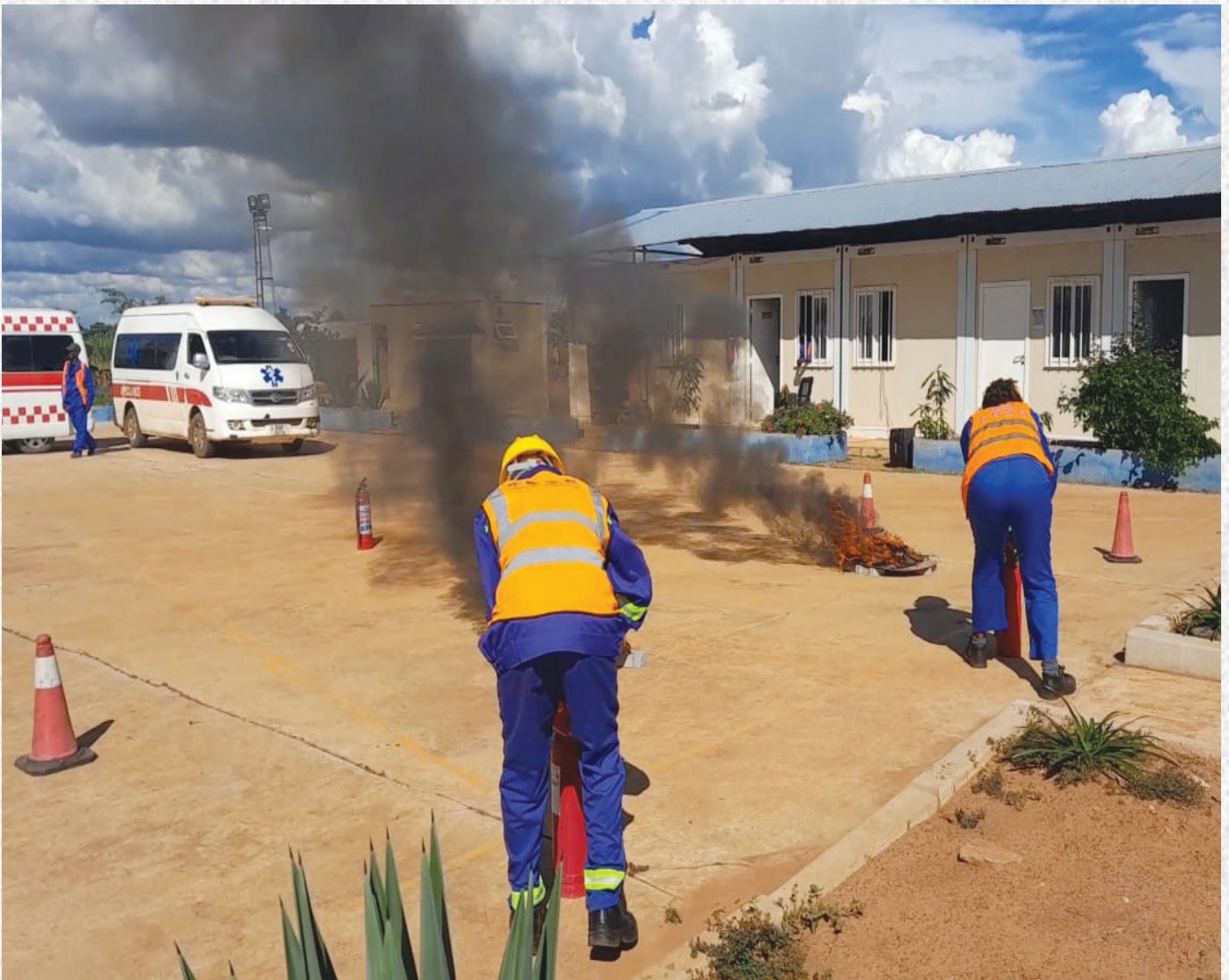
Fire Drill in progress at the Campsite.

T he Road Development Agency (RDA) Muchinga Regional Office in conjunction with CPG Consultant held Safety Drills as part the Chinsali-Nakonde Road Rehabilitation Project to raise awareness among employees under Lot 1 and Lot 2 of the project.