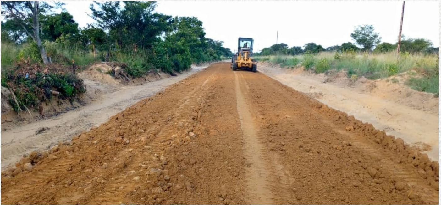
Holding maintenance works on selected sections of Mwandasengo-Luampa Road in Luampa District.

T he Government through the Road Development Agency (RDA) has placed high priority on the implementation of road development projects in Zambia.