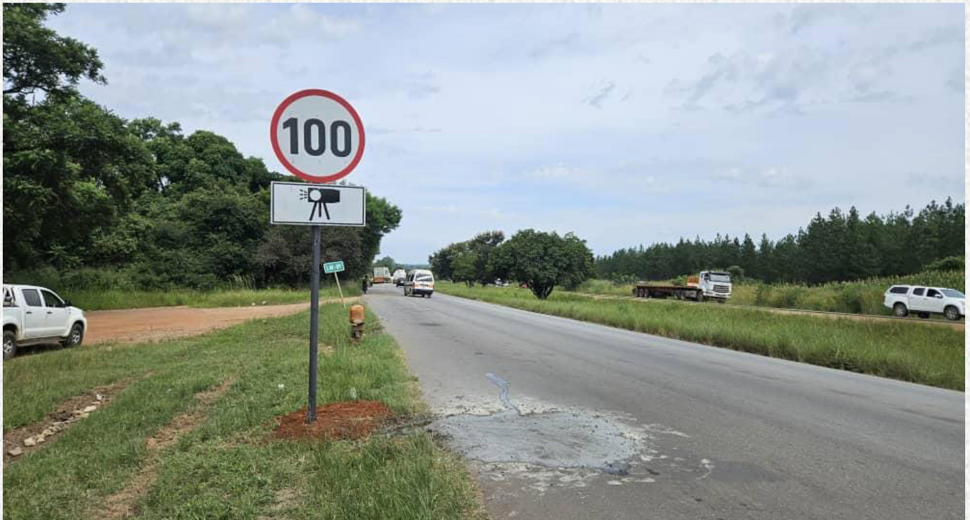
A 100 kilometres speed limit signage on Kapiri Mposhi-Chingola Road.

There is a total of 10 points that have speed cameras with varying speed limits. All the signs have been installed.