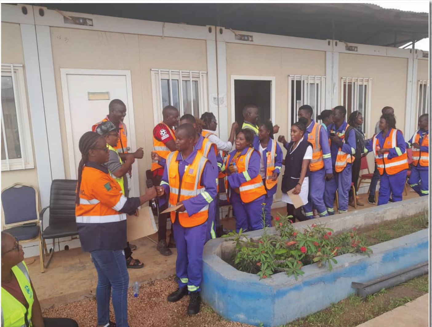
Awarding of certificates to the participants after the Safety Drills.