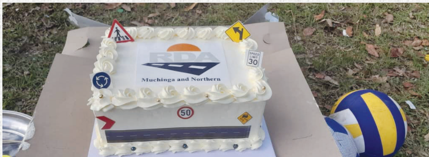
A befitting cake for the occasion.