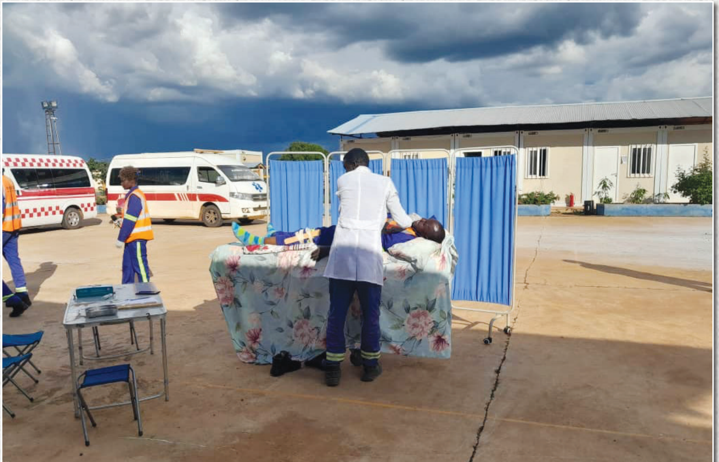
An employee displaying First Aid skills at Lot 1 Campsite during a Safety Drill.