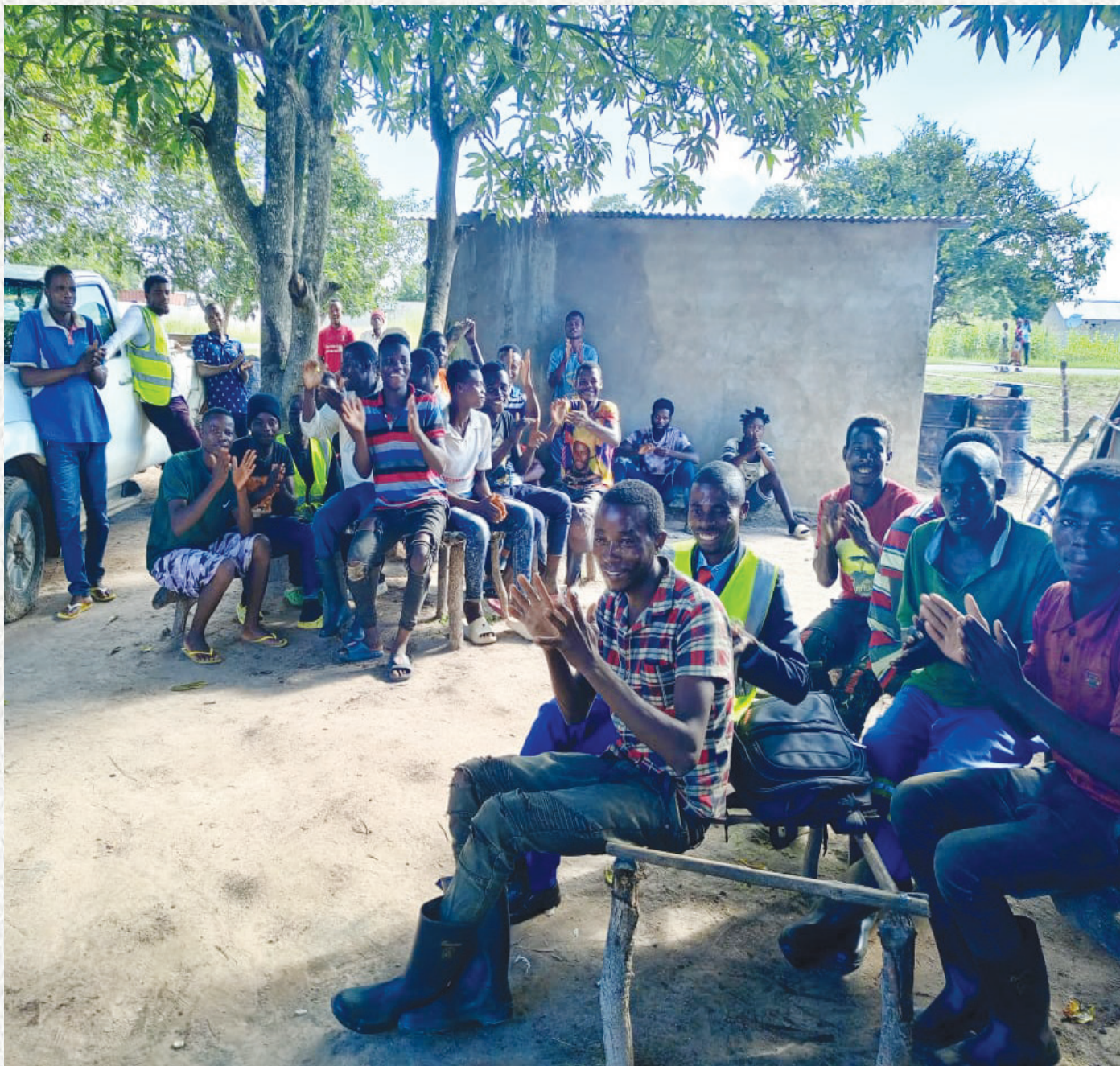
Elated temporary workers engaged on the Musaila-Mukuku Bridge and Road Vegetation Control Project.

T he Road Development Agency (RDA) has implemented the revised minimum wages temporary employees.