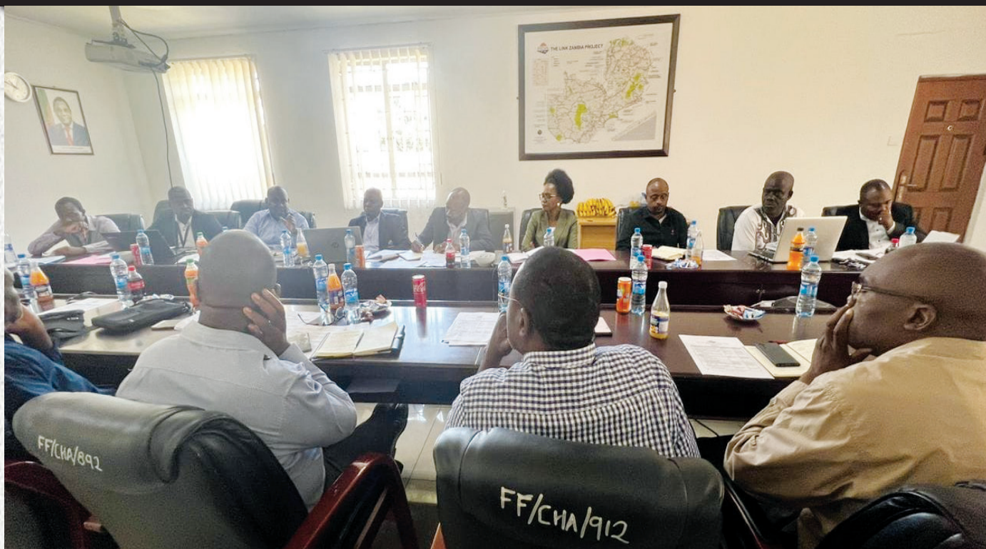
Officials from the RDA and the ACEZ during an engagement on matters pertaining to the Road Sector in Zambia held at the RDA Head Office.

The Road Development Agency (RDA) recently engaged the Association of Consulting Engineers of Zambia (ACEZ) to discuss matters pertaining to the Road Sector in Zambia at the RDA Head Office in Lusaka.