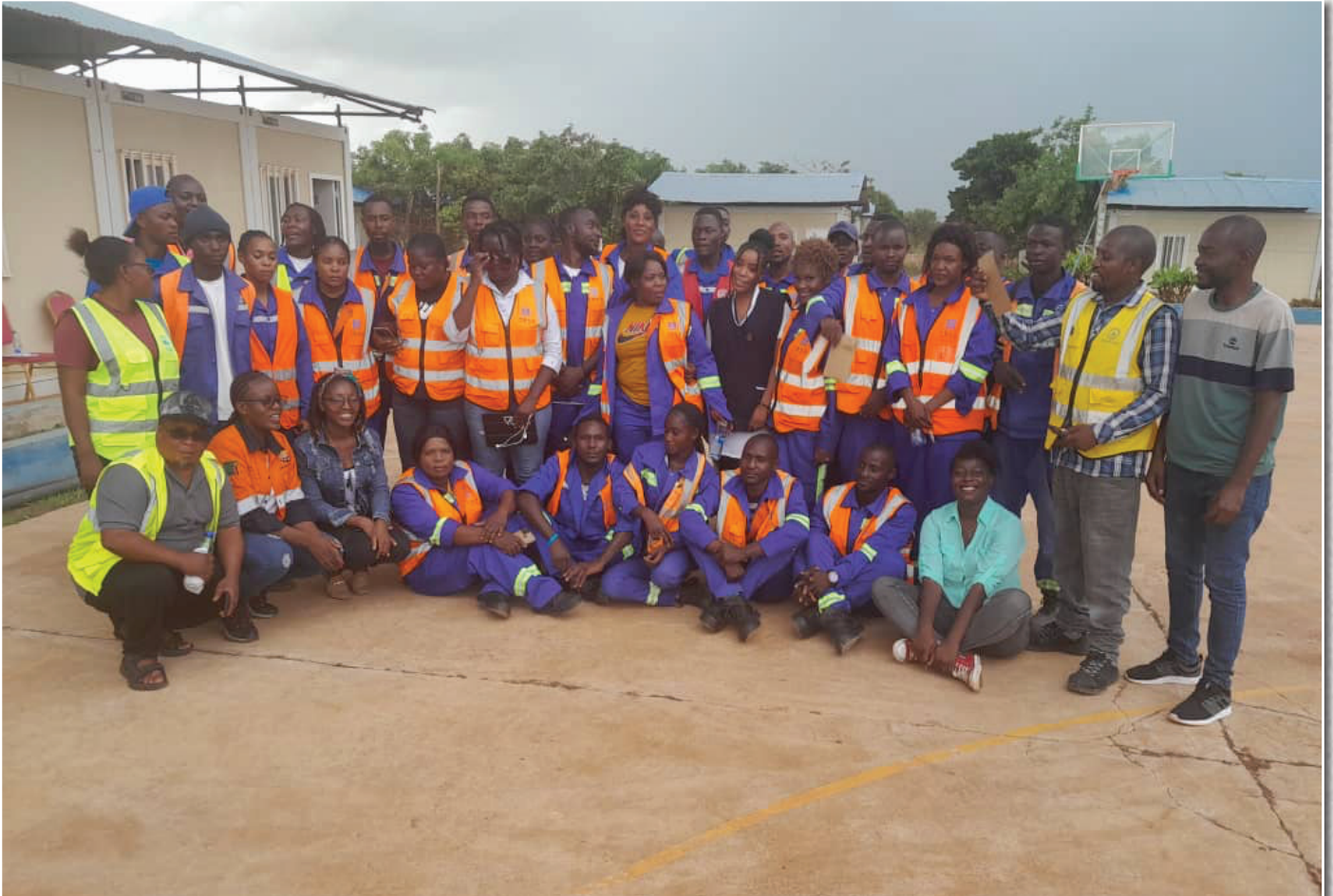
Group photo of officials from RDA Muchinga Regional Office, CPG Consultants and Employees at Lot 1 Campsite.