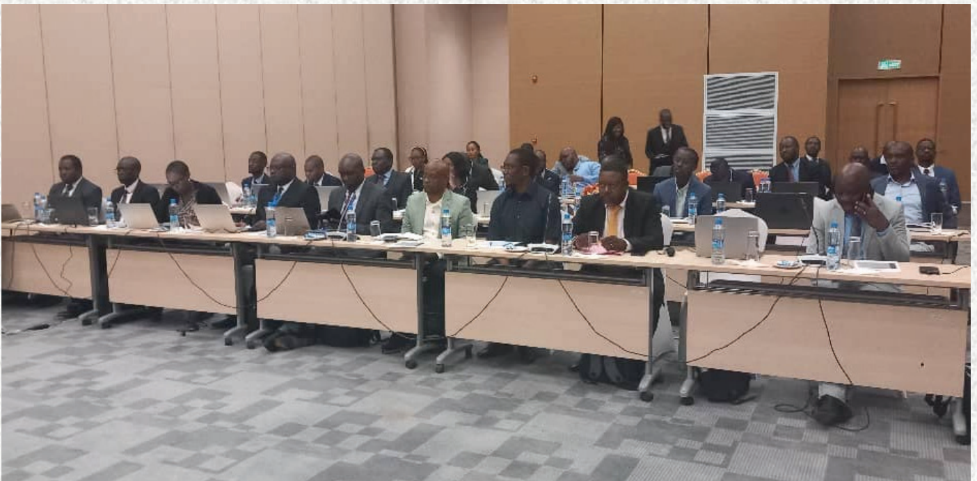
Delegates following proceedings at the Joint Donor Forum and Transport Sector Performance Review at the Mulungushi International Conference Centre.