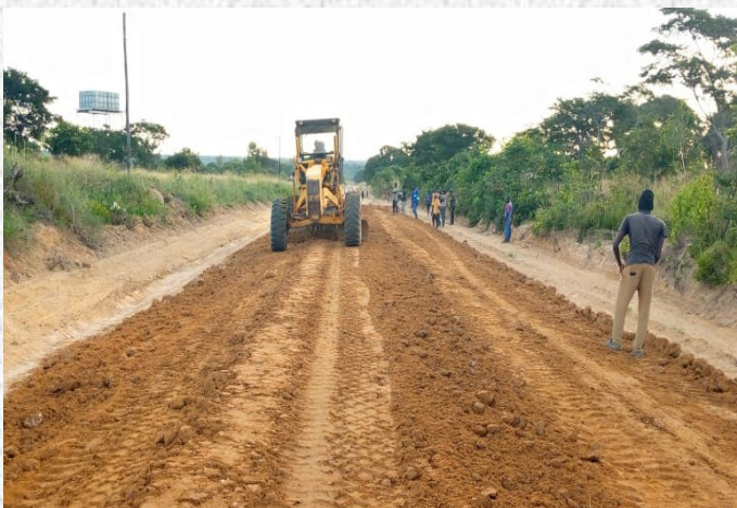
Holding maintenance works on selected sections of Mwandasengo-Luampa Road in Luampa District.

The overall physical progress currently stands at 15%. The progress had been affected by inclement weather conditions. The Agency through the Western Regional Office is mobilizing more pieces of equipment to urgently complete the works especially that the area is experiencing a dry spell.