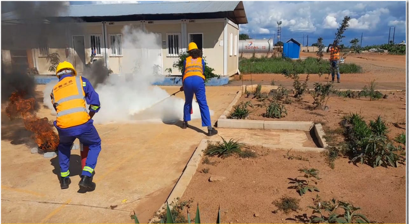
Employees displaying a Fire Drill during the safety awareness at Lot 1 Campsite.