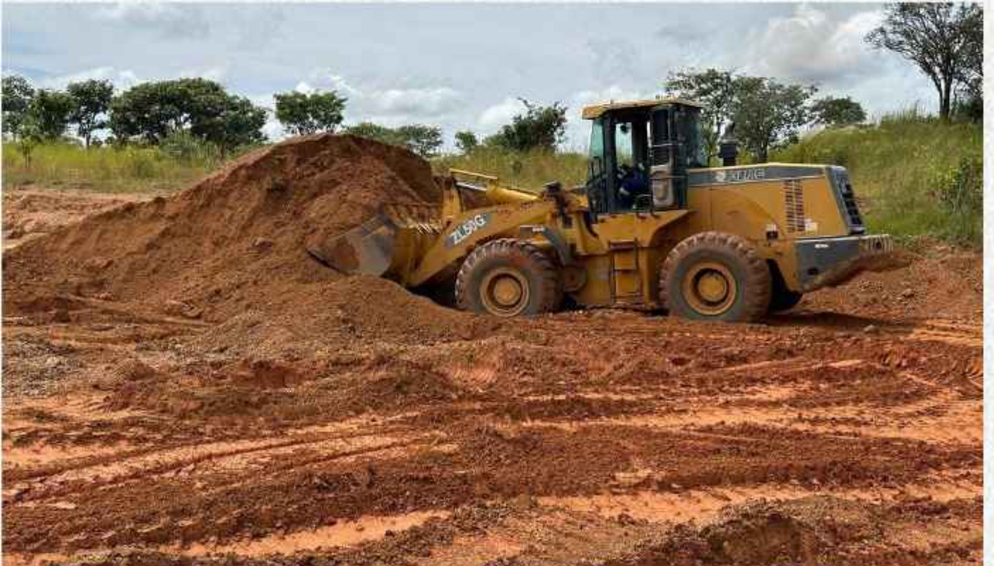
Holding maintenance works on the Musaila-Tuta Road.

The works are being carried out by the Road Development Agency (RDA) Luapula Regional Office and are expected to be completed by the end of June 2024.