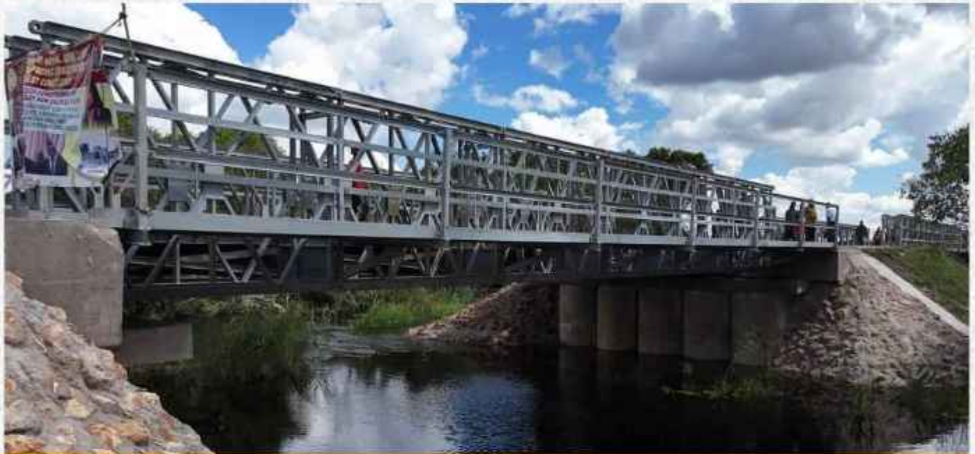
One of the commissioned ACROW Bridges across the Kashiji River along the Zambezi-Chinyama-Litapi Road in Zambezi District.