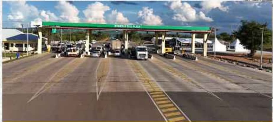
The newly constructed Konkola Toll Plaza along the Chingola-Kasumbalesa Road.