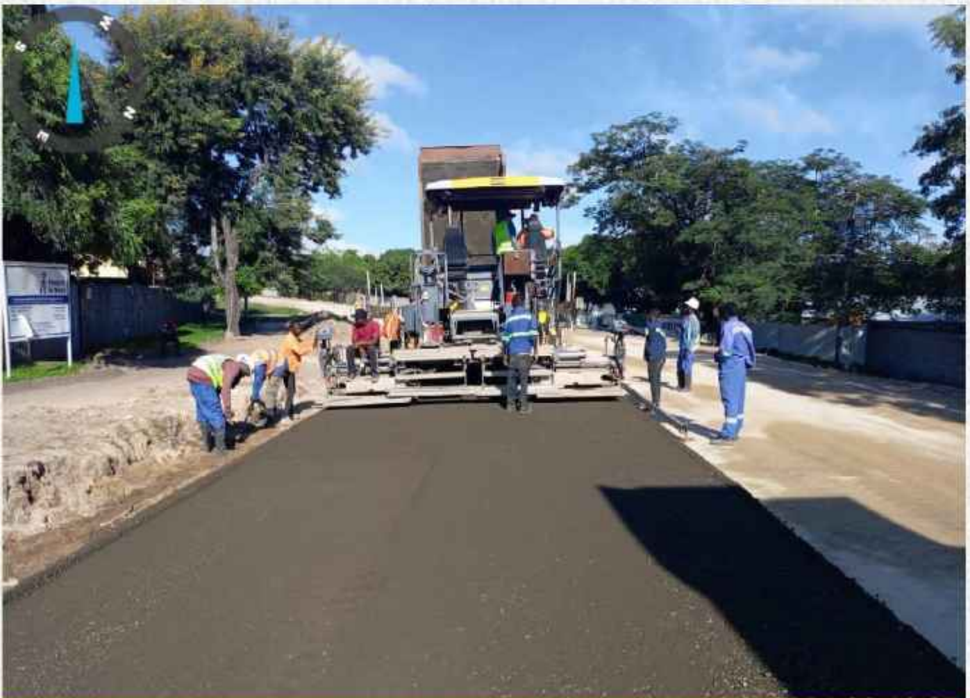
Laying of 175 millimetres crushed stone base on Lyambal road in Mangu.