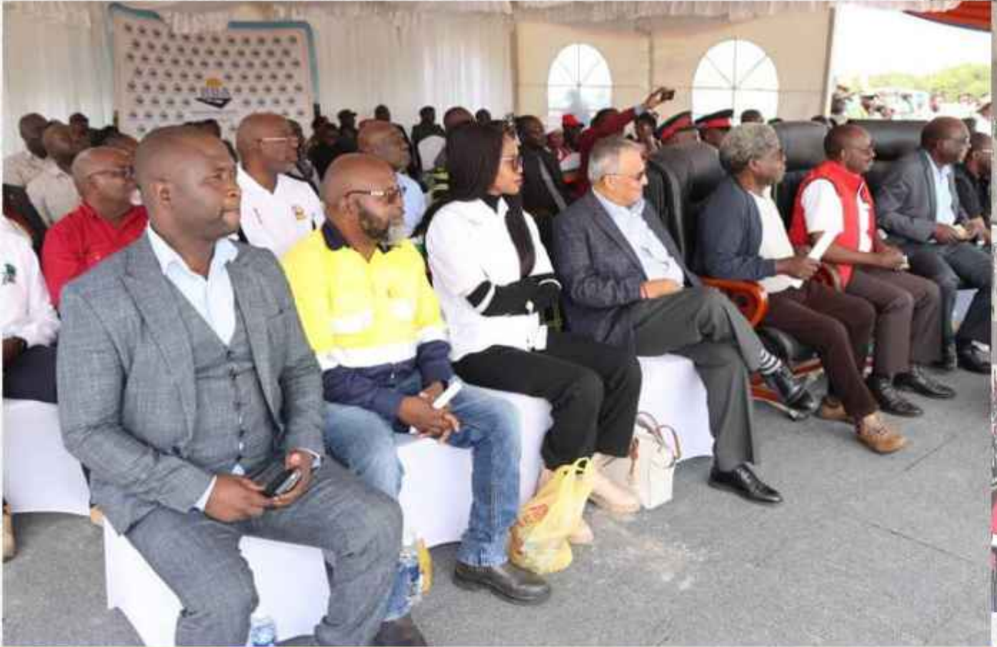
The Minister and his delegation as well as invited guests following proceedings during the commissioning of six ACROW Bridges in Zambezi District.