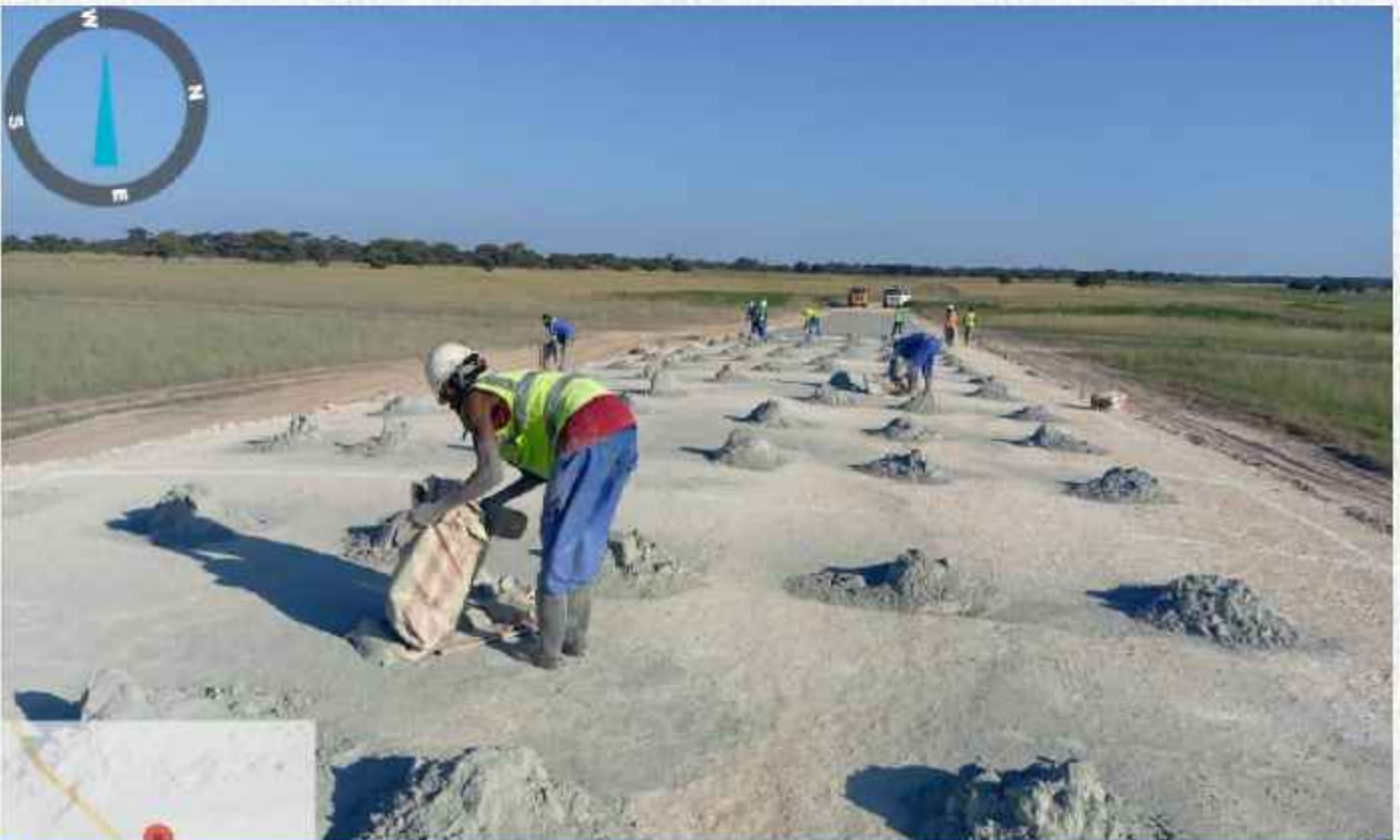
Preparations to commence cement stabilization.