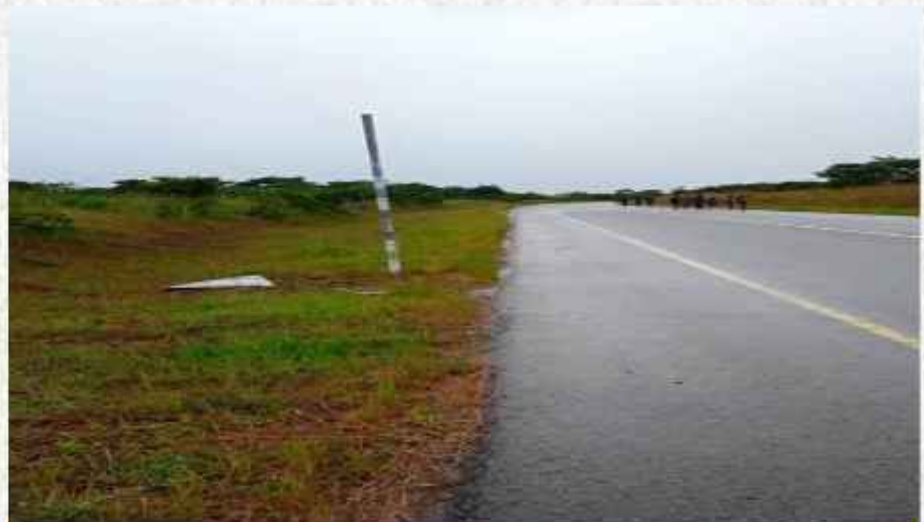
One of the road signs vandalized along the Nakonde-Mbala Road.

The RDA is appealing to members of the public to be alert and report people vandalizing road furniture to law enforcement agencies or the RDA.