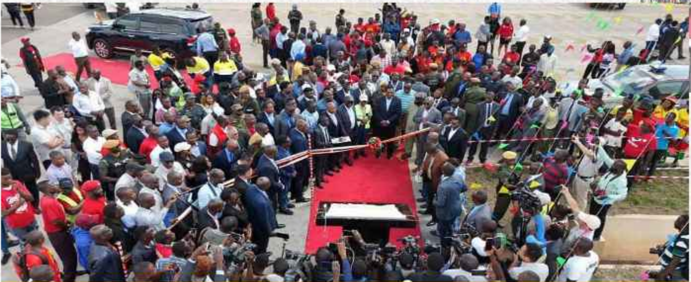
President Hakainde Hichilema and invited guests before the cutting of the ribbon and unveiling of the plaque.

PPP model in Zambia. This achievement will attract more investments into PPP projects, thereby further bolstering Zambia’s infrastructure development and driving economic growth,” he said.