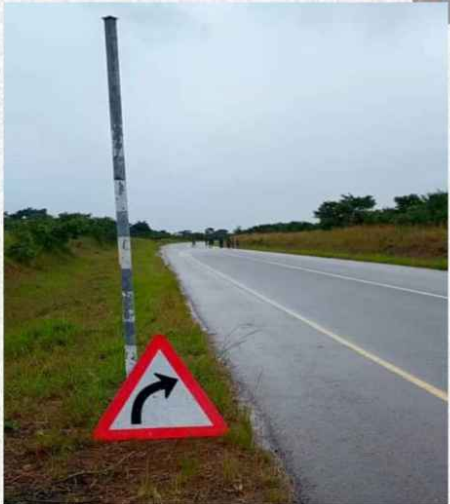
One of the road signs vandalized along the Nakonde-Mbala Road in Muchinga Province.

In most cases, road signs, traffic lights, guardrails and studs have been removed or tampered with. The removal or damage to road furniture does pose a danger to road users especially those that may not be familiar with particular stretches of the roads.