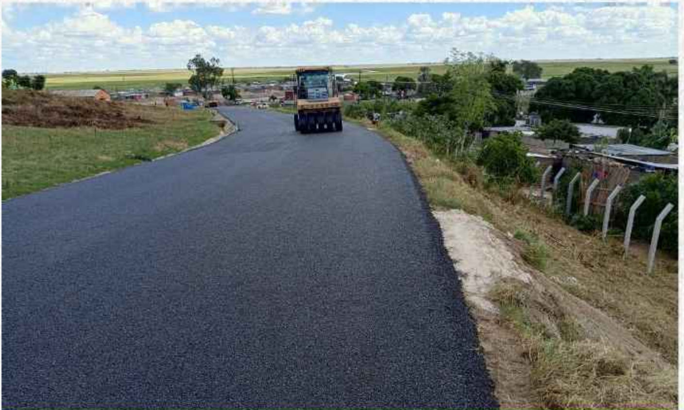
Asphalt concrete surfacing works on the Lyambai Road.

The Lyambai Road also provides connectivity to the famous Mongu-Kalabo Road.