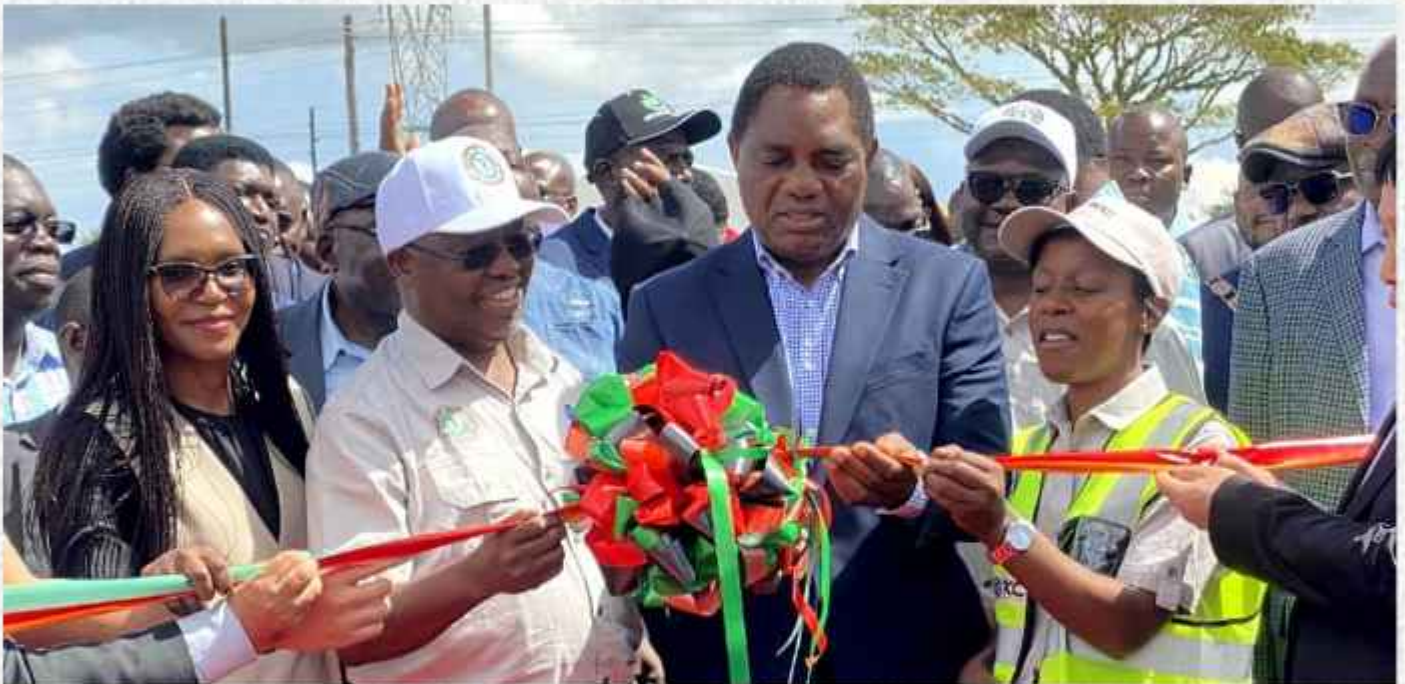
President Hakainde Hichilema cutting the ribbon during the commissioning of the rehabilitated Chingola-Kasumbalesa Road under the Public-Private Partnership (PPP) financing model.

President Hakainde Hichilema on 12 th April 2024 commissioned the rehabilitated Chingola-Kasumbalesa Road under the Public-Private Partnership (PPP) financing model.