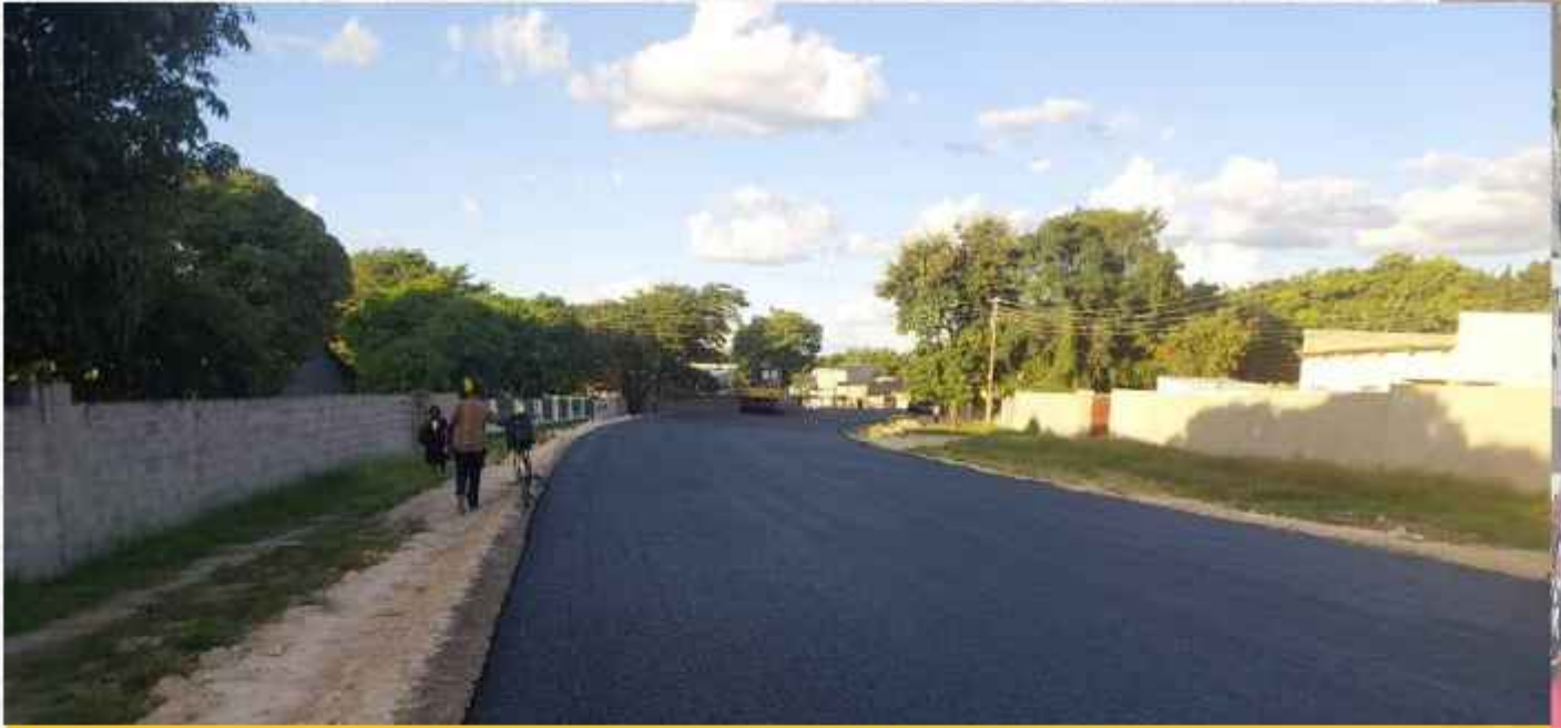
Asphalt concrete surfacing works on the Lyambai Road in Mongu District.

Asphalt concrete surfacing works on the Lyambai Road in Mongu District have been completed.