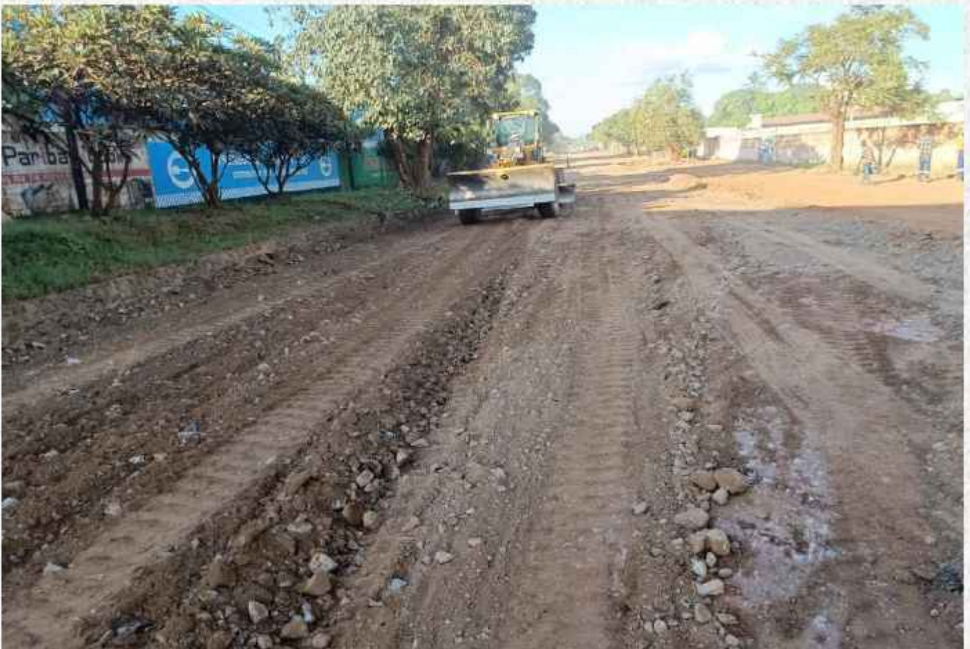
Chibuluma Road works.