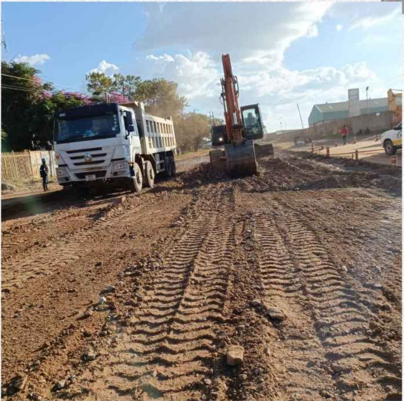
Clearing and grubbing works underway.

The contractor engaged to construct the 7 kilometers Chibuluma Road to concrete standard in Kitwe has commenced works.