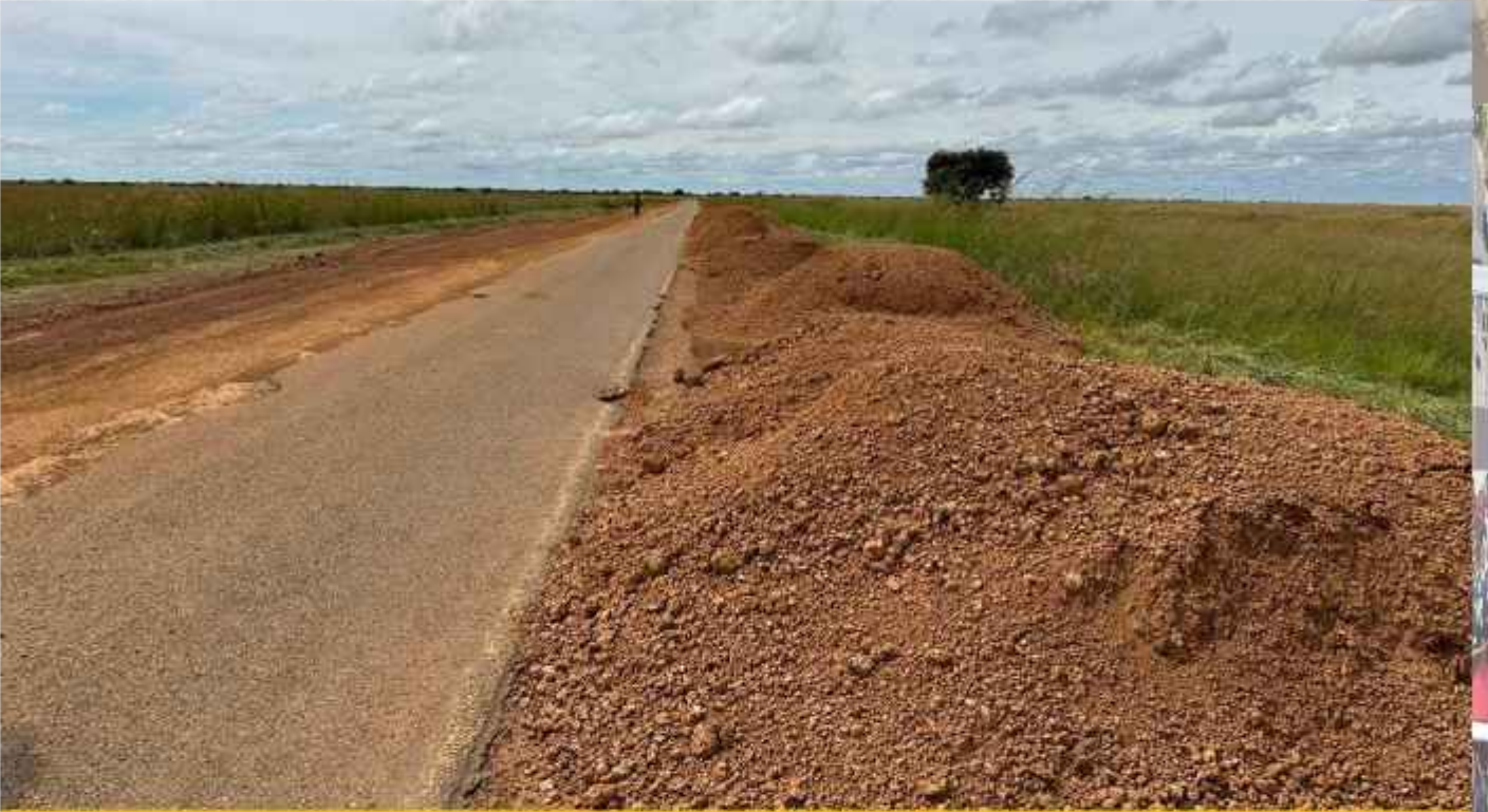
Holding maintenance works on the Musaila-Tuta Road in progress.

Holding maintenance works on the Musaila-Tuta Road (113 kilometers) have resumed.