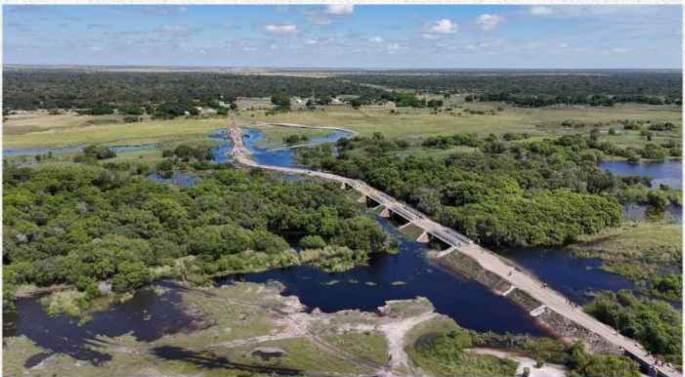
Aerial view of the commissioned ACROW Bridges across the Kashiji River along the Zambezi-Chinyama-Litapi Road in Zambezi District.