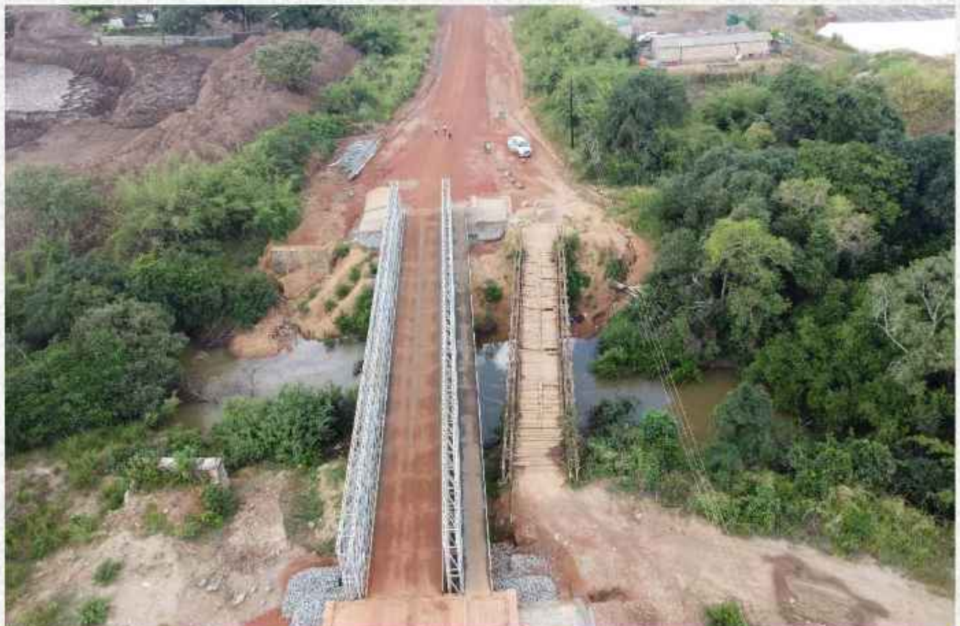
Newly installed Luombwa ACROW Bridge across the Luombwa River in the Nasanga Farm Block of Serenje District.