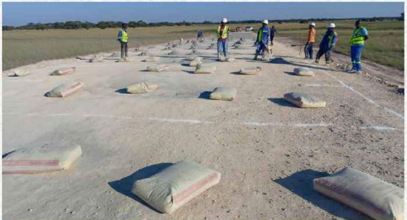
Preparations to commence cement stabilization.