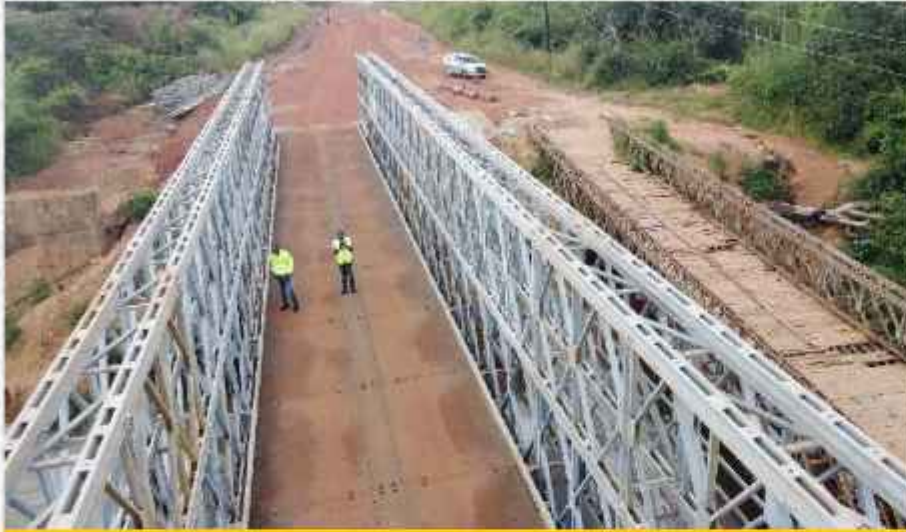
Newly installed Luombwa ACROW Bridge across the Luombwa River in the Nasanga Farm Block of Serenje District in Central Province.

The construction and installation work of the 51.67 metres span ACROW Bridge across the Luombwa River in the Nasanga Farm Block of Serenje District in Central Province have been completed