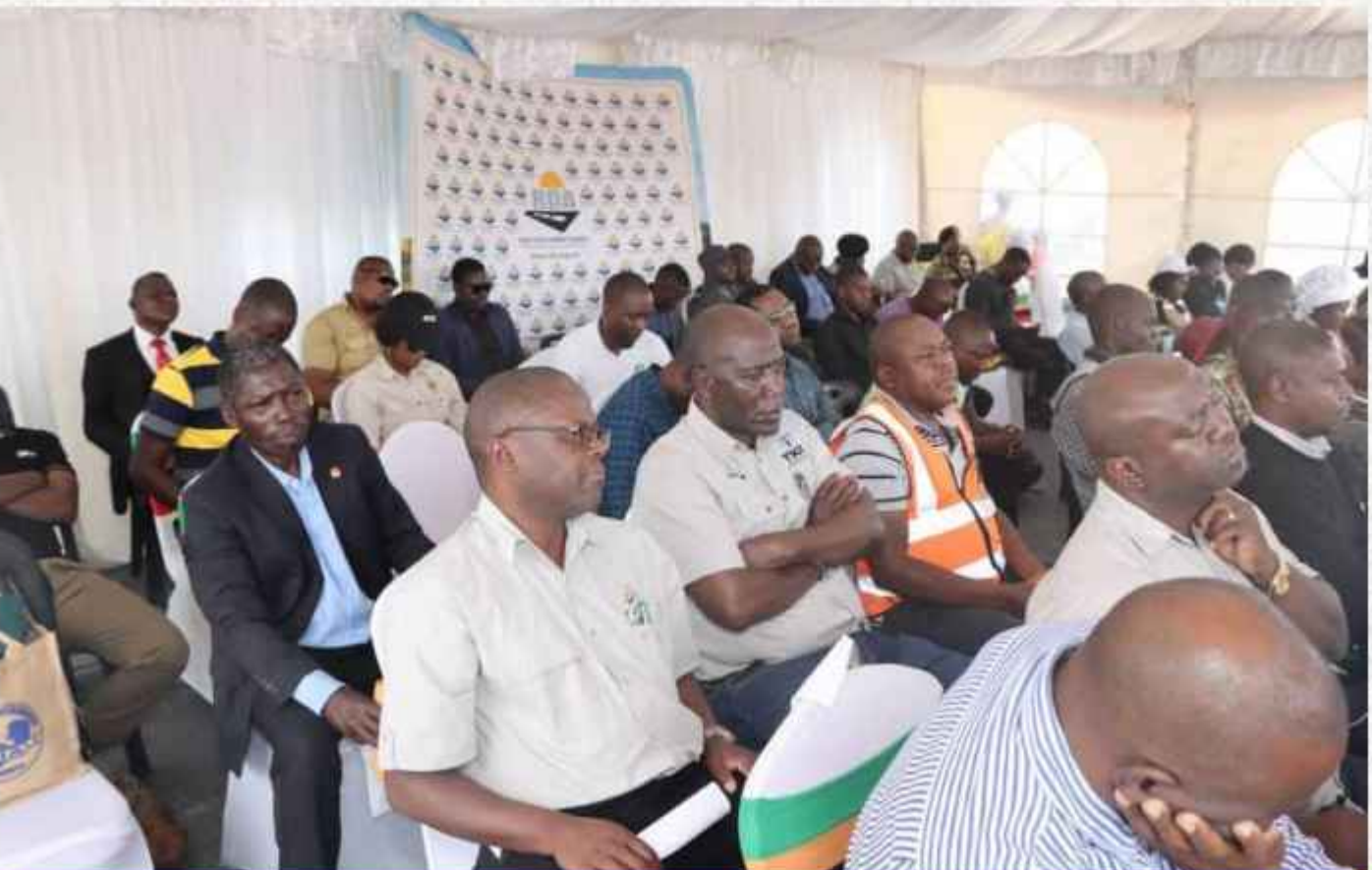
RDAs Staff and some invited guests following proceedings during the commissioning of six ACROW Bridges in Zambezi District.