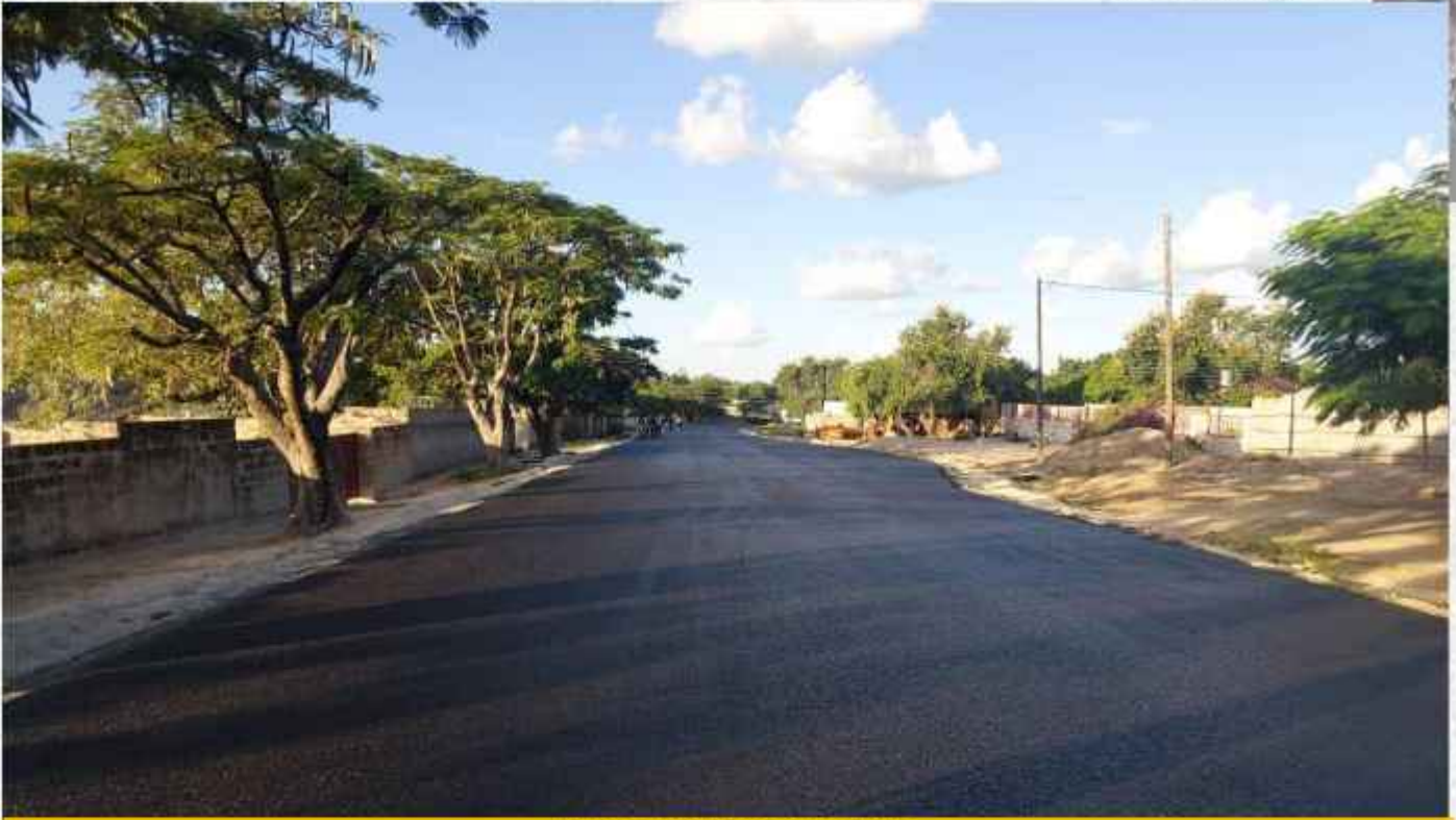
New look Lyambal Road in Mangu District.