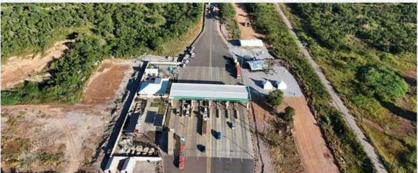
Aerial view of the rehabilitated Chingola-Kasumbalesa Road and Konkola Toll Plaza.