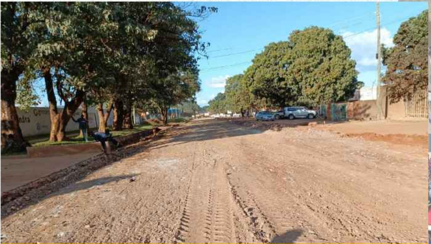
Road bed preparation in progress.