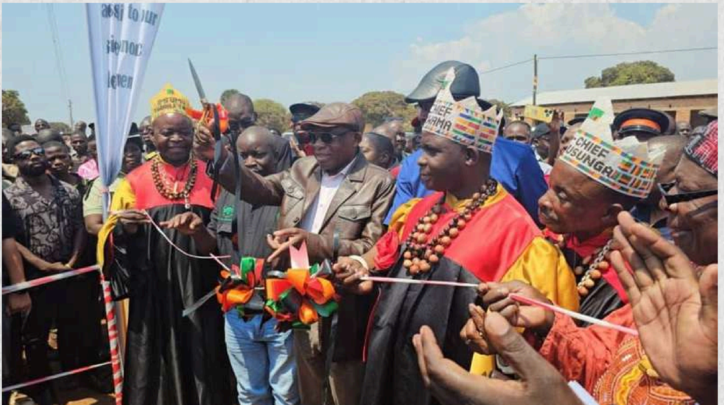
Groundbreaking Ceremony for the Nchelenge to Chiengwe Road via Kashikishi and Mununga project in Nchelenge, Luapula Province.