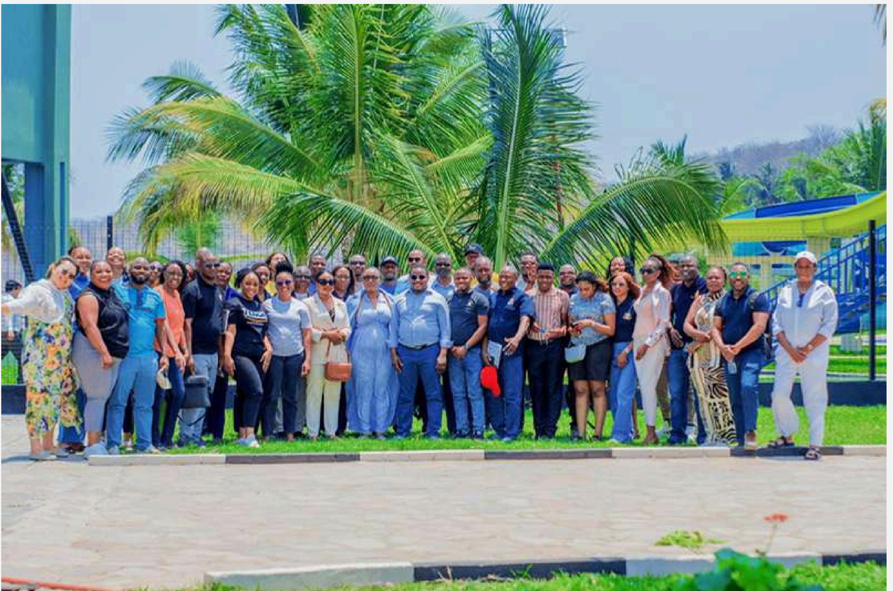
Participants of the ZIPRC CPD Reputation Management Training in Siavonga District.