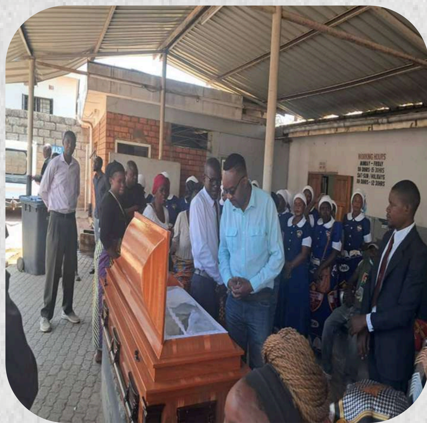
RDA employees during body viewing at the University Teaching Hospital.