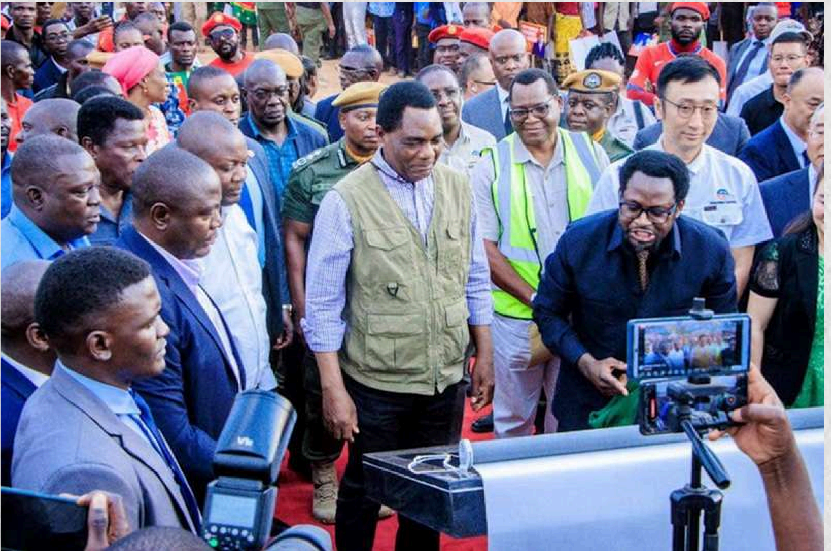
President Hakainde Hichilema during the groundbreaking ceremony of the Solwezi-Kipushi Road in Solwezi District.