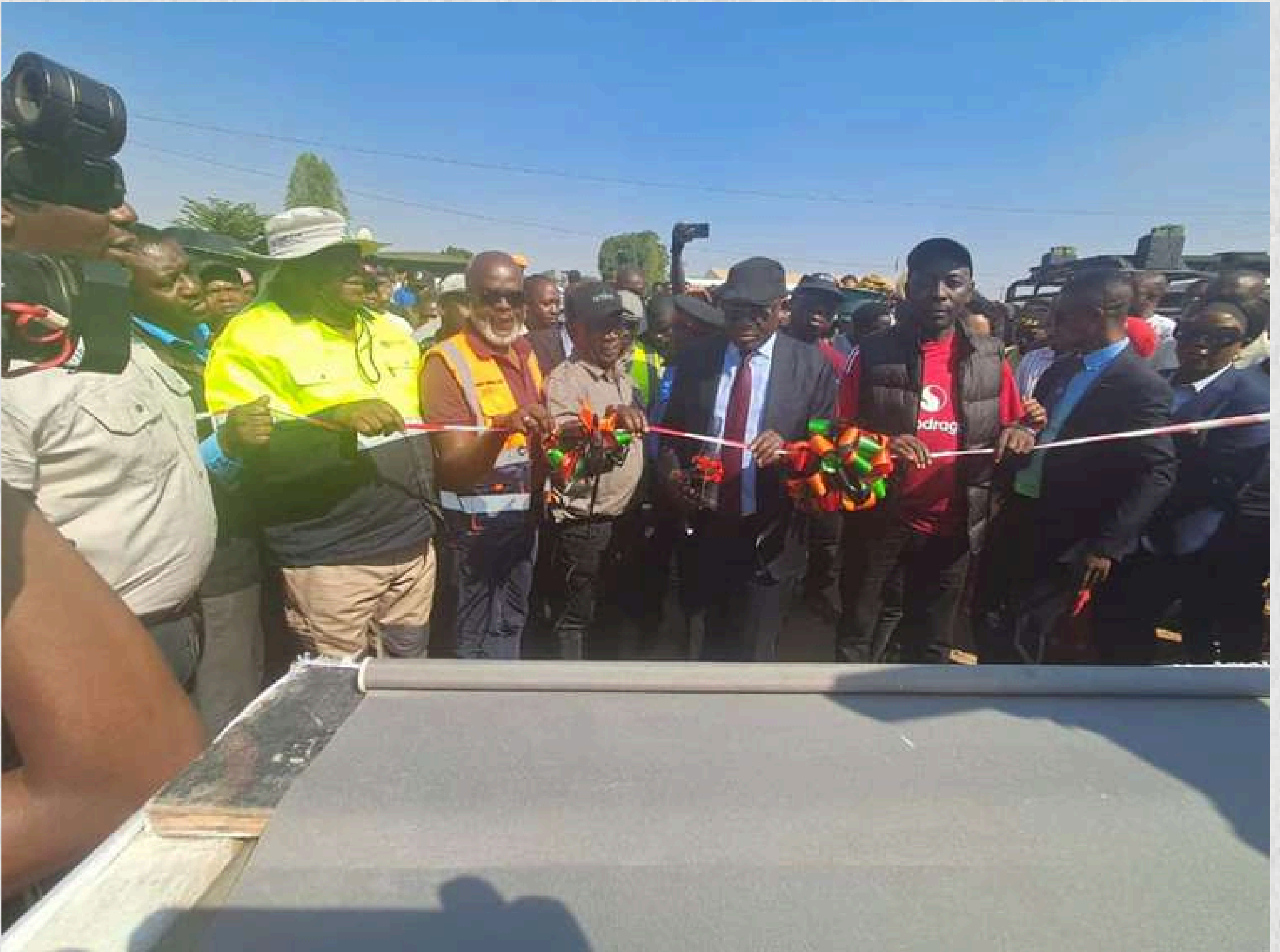
Groundbreaking ceremony for the construction and rehabilitation of Urban Roads in Ndola.

Urban road infrastructure is vital for the socio-economic development of cities, particularly in developing countries, where improved road networks can enhance accessibility, reduce transportation costs, and facilitate the efficient movement of goods and people.