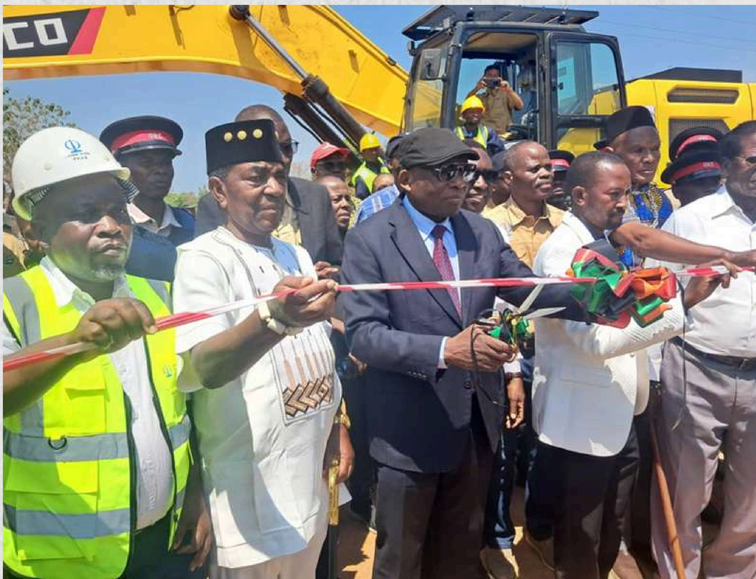
Groundbreaking Ceremony for the Samfya-Kasaba Road Project in Chifunabuli, Luapula Province.

The Government recently launched works to upgrade the Samfya-Kasaba Road via Lubwe and the Nchelenge-Chiengwe Road via Kashikishi and Mununga to bituminous standard in Luapula Province.