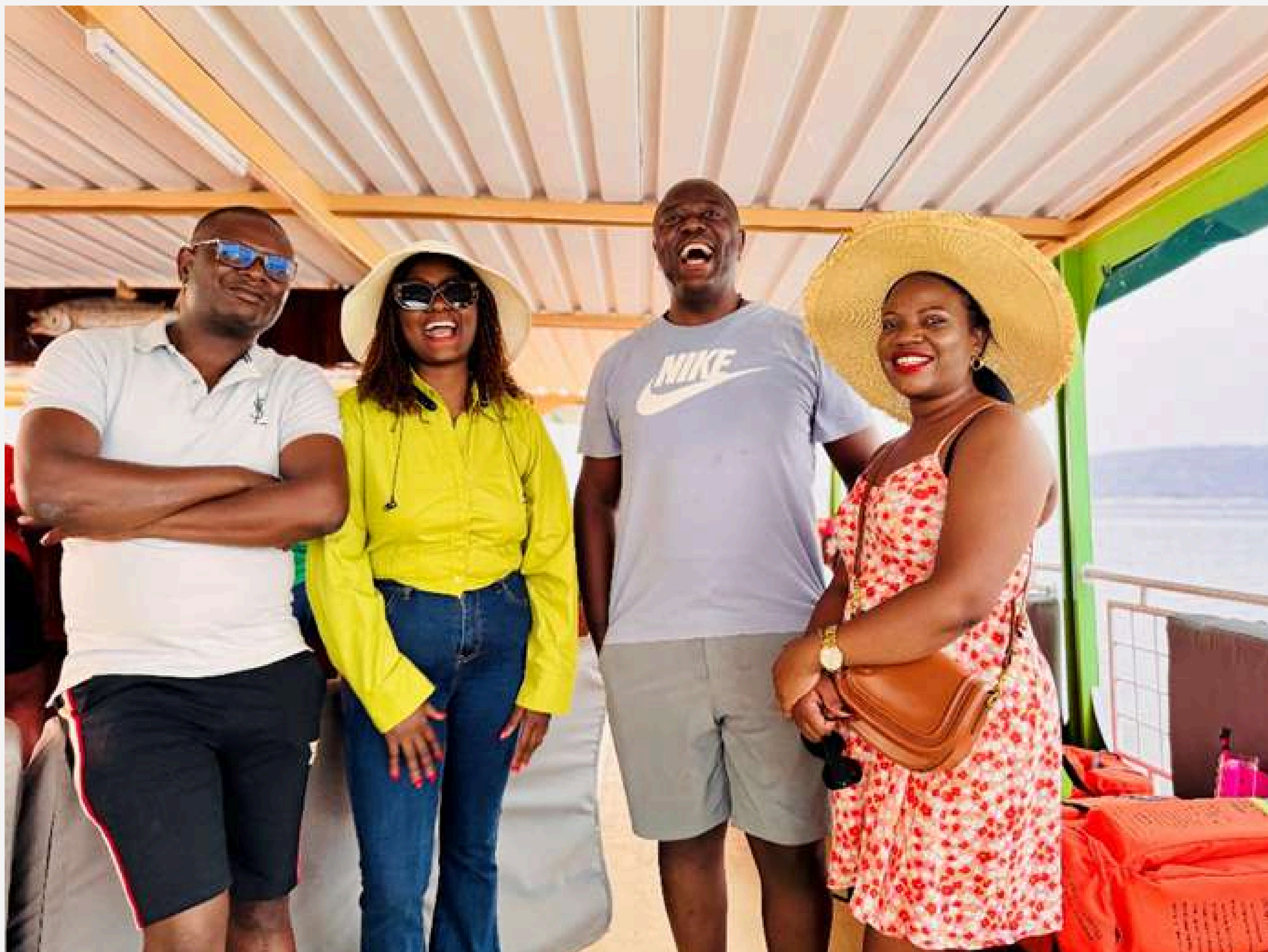
A light moment: RDA Communications and Corporate Affairs Unit Staff during a boat cruise on the sidelines of the training.

Participants of the training also took time to have plenary sessions on Crisis Communication and Reputation Recovery, Managing Bad Reputation, Dealing with a Crisis, and Corporate Reputation.