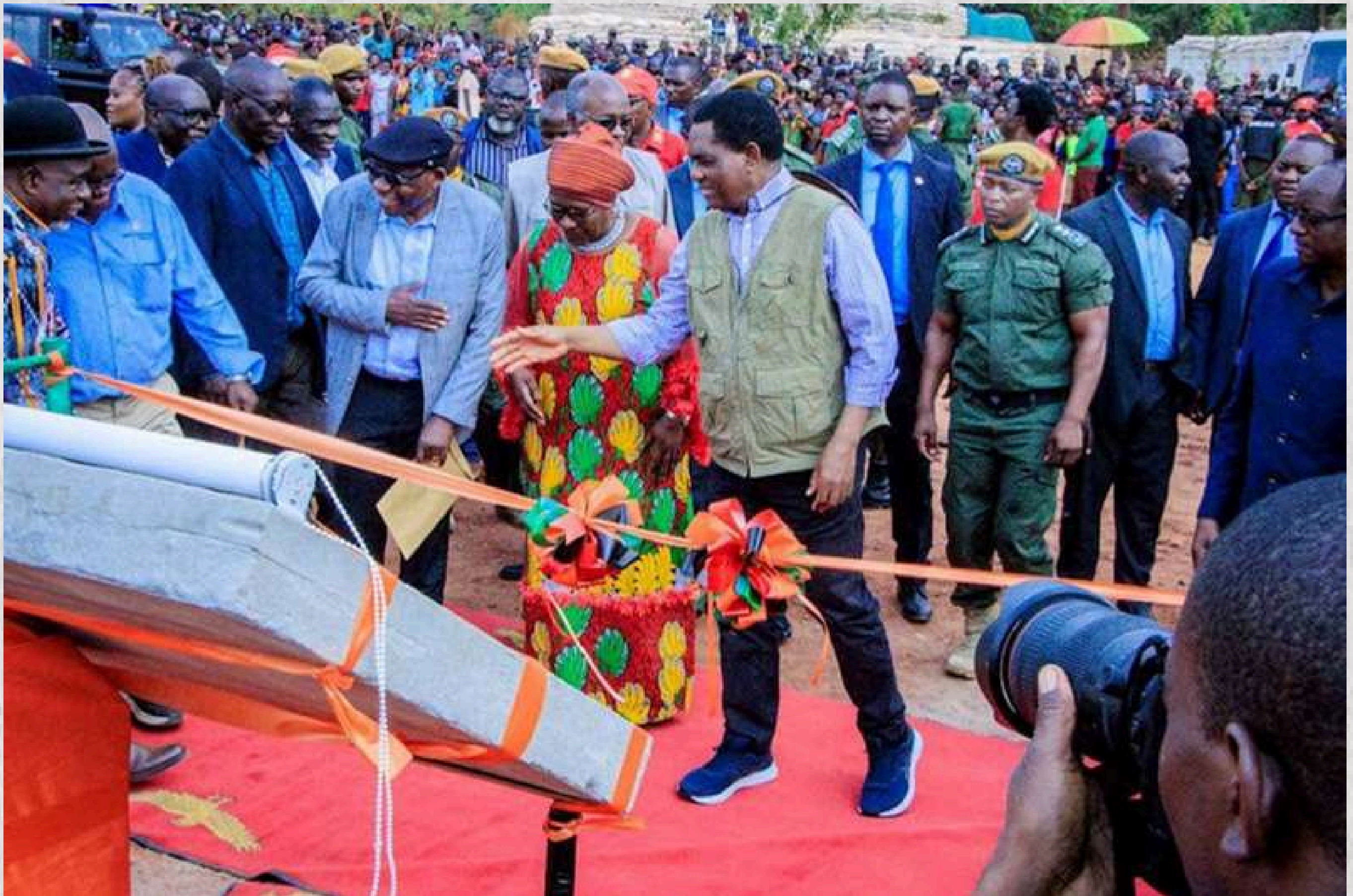
President Hakainde Hichilema during the groundbreaking ceremony of the Mutanda-Kasempa-Kaoma Road in Kasempa District.

President Hakainde Hichilema recently launched construction works to upgrade to bituminous standard the Solwezi-Kipushi Road and Border infrastructure and the Mutanda-Kasempa-Kaoma Road in North Western Province.